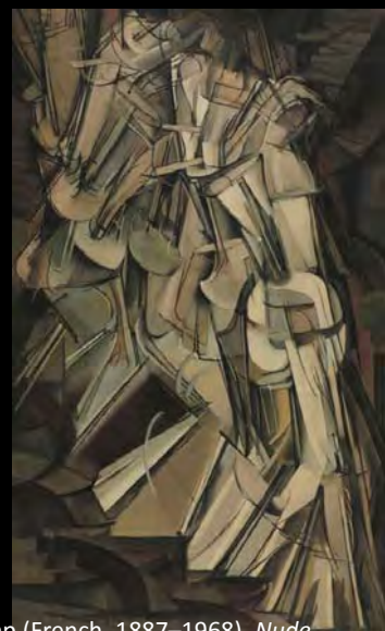
Marcel Duchamp (French, 1887–1968), Nude Descending a Staircase (No. 2) , 1912. Oil on canvas,

NEW-YORK HISTORICAL SOCIETY MUSEUM & LIBRARY MAKING HISTORY MATTER