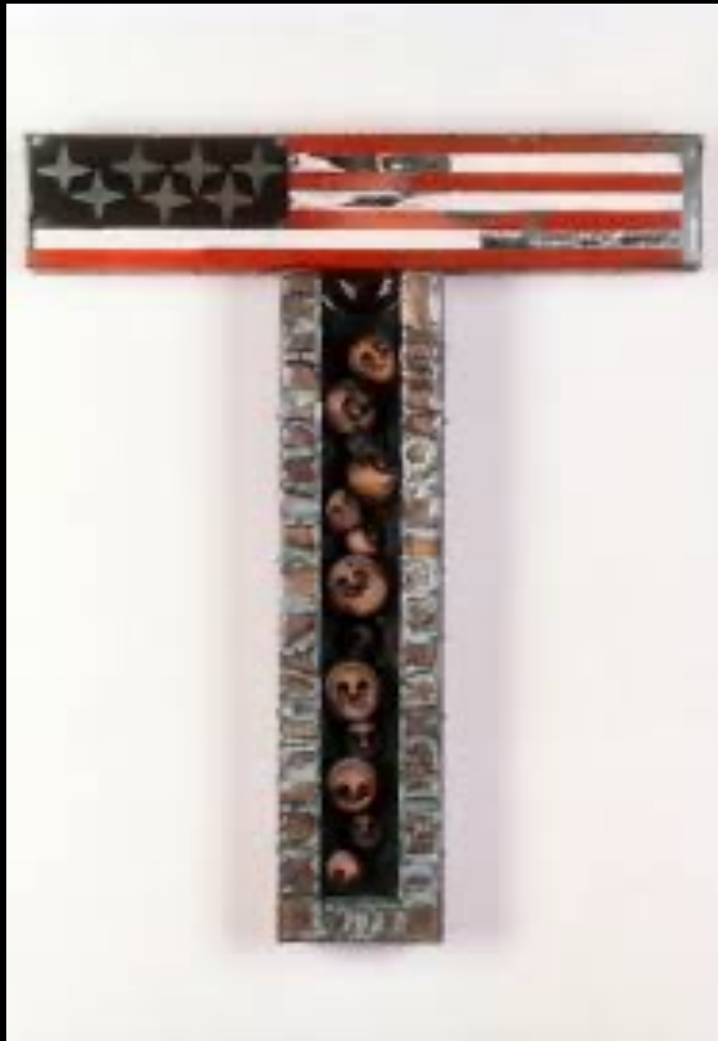
John Outterbridge Traditional Hang up 1969