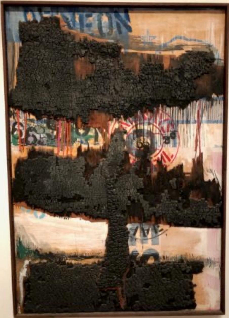
Noah Purifoy, Untitled ( 66 Signs of Neon ), ca. 1966. Mixed-media assemblage