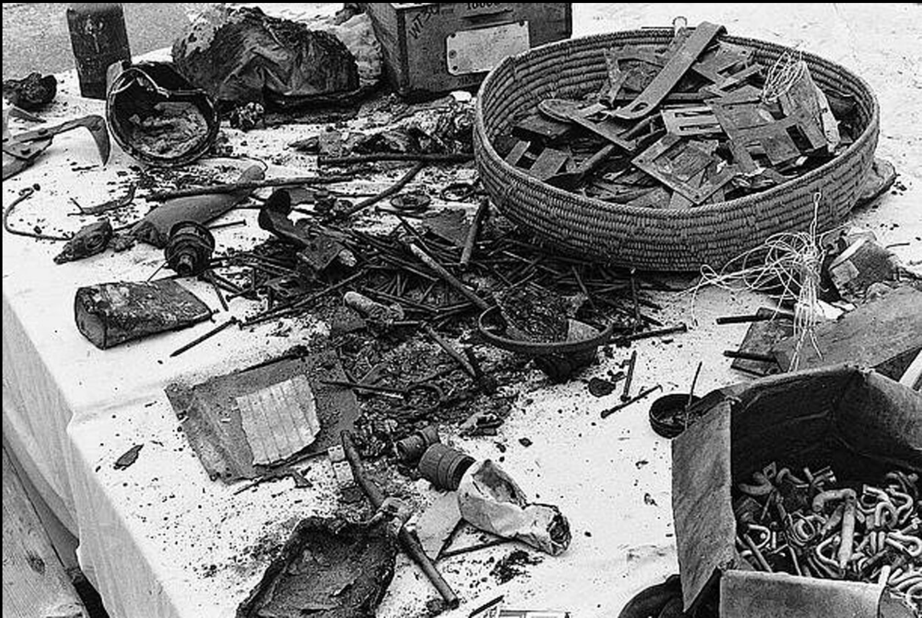
66 Signs of Neon Noah Purifoy