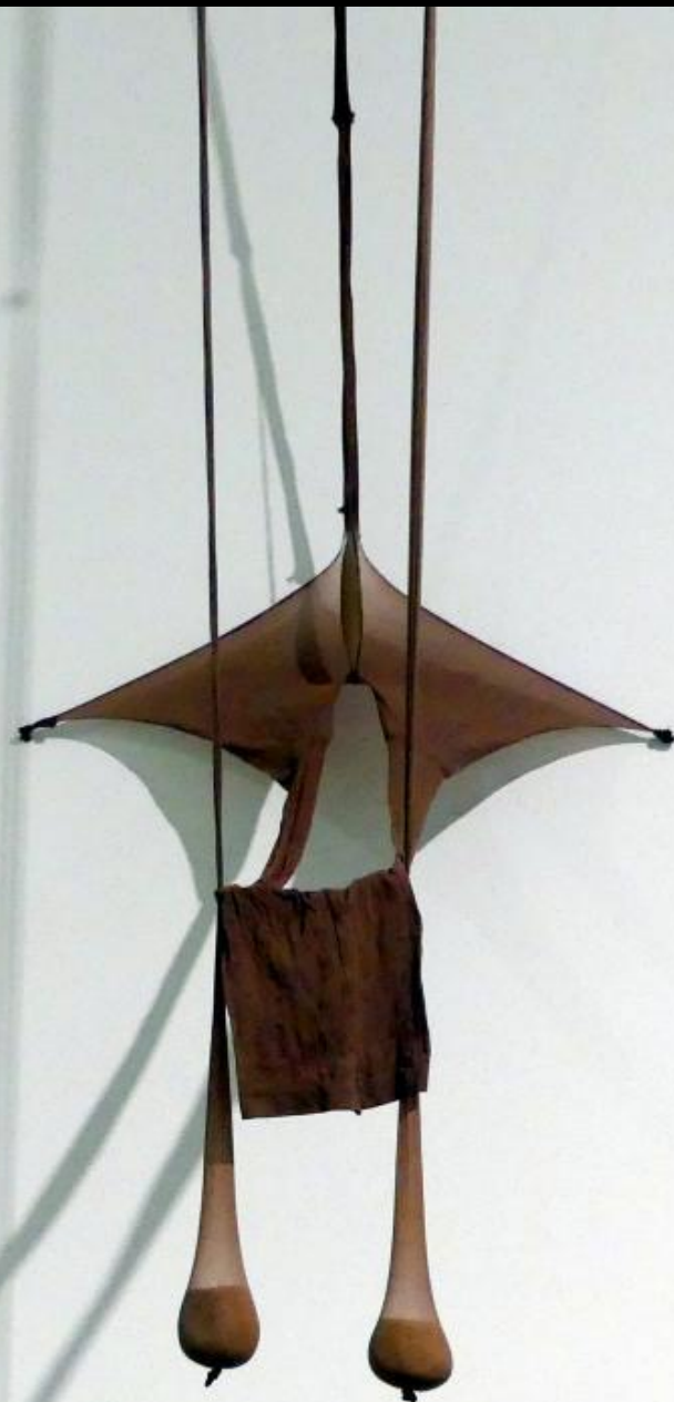
Senga Nengudi, Swing Low , 1977