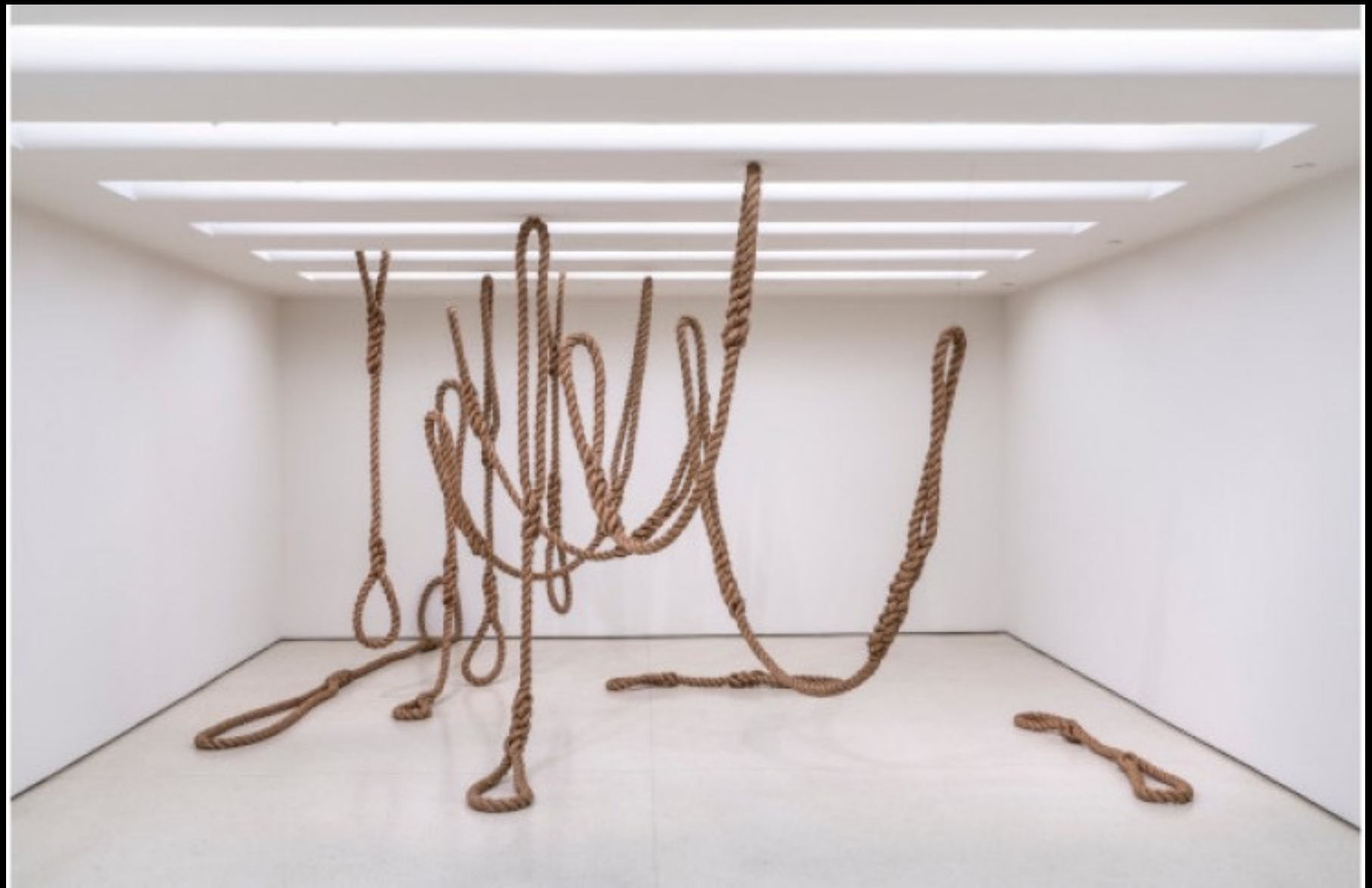
Maren Hassinger - Untitled, 1972/2020. Rope