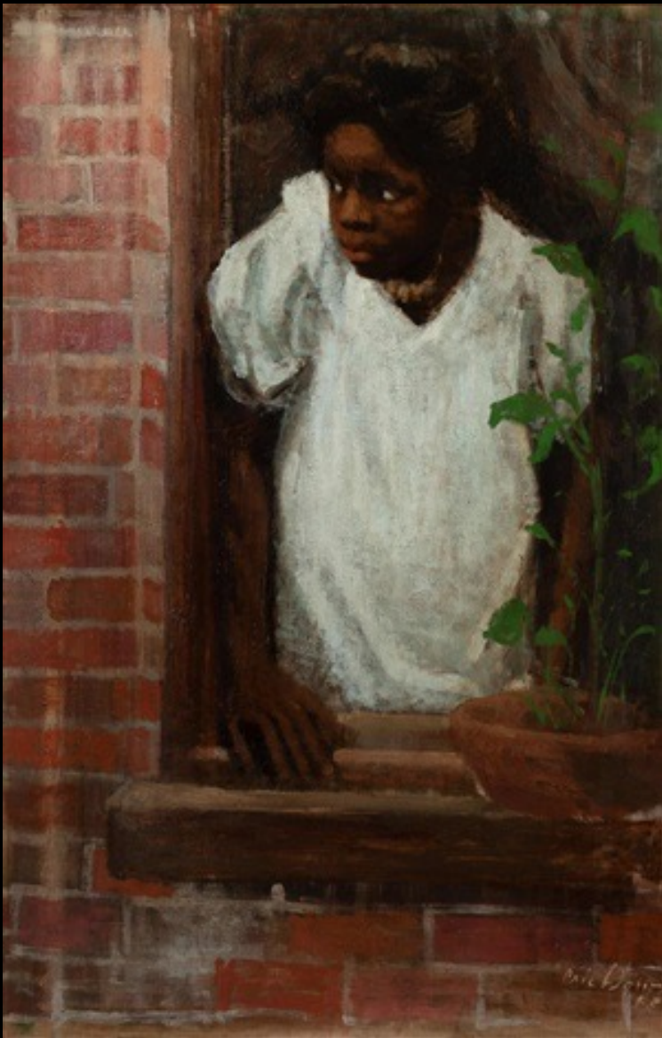
Ernest Crichlow Girl at Window 1965