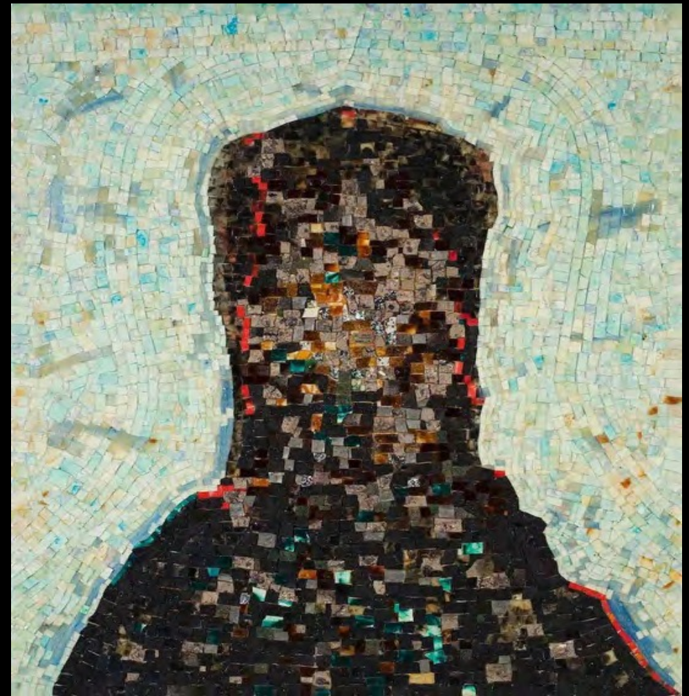
Jack Whitten Black Monolith, II: Homage To Ralph Ellison The Invisible Man, 1994, acrylic on canvas.