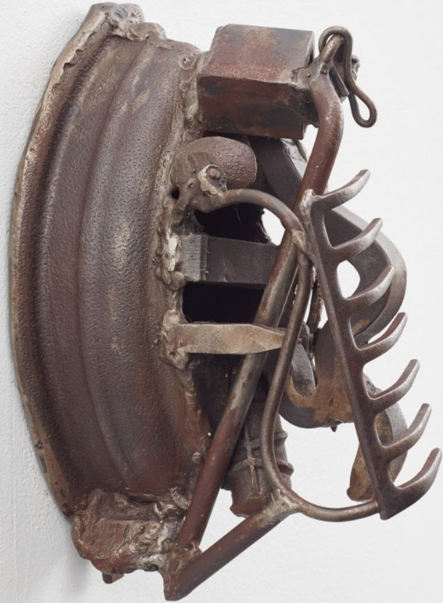
“Lynch Fragments” Melvin Edwards