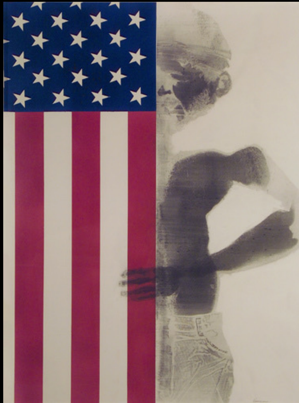
David Hammons Boy with Flag