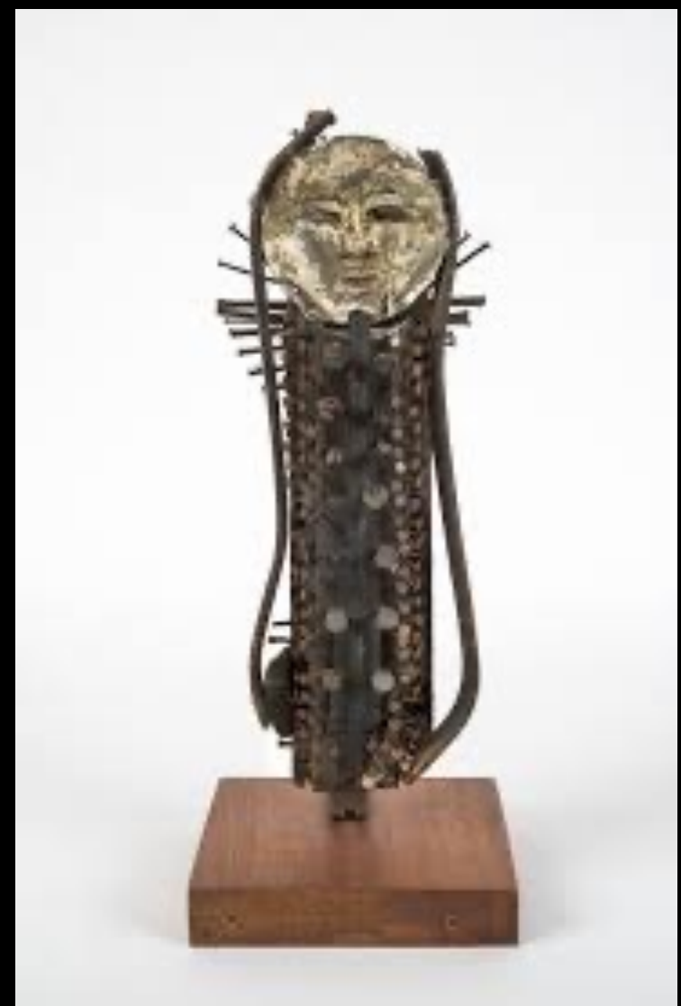
Noah Purifoy Untitled 1965