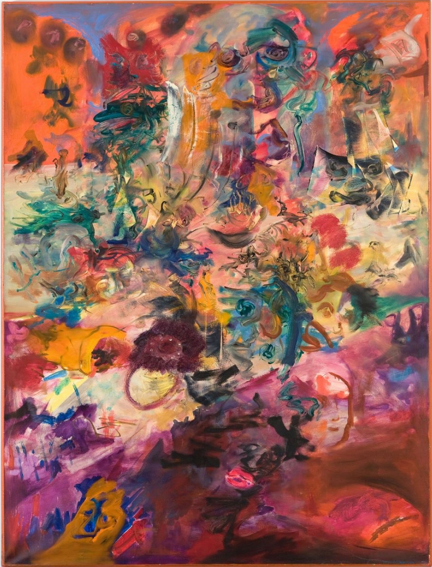
Jack Whitten King's Wish (Martin Luther's Dream), 1968