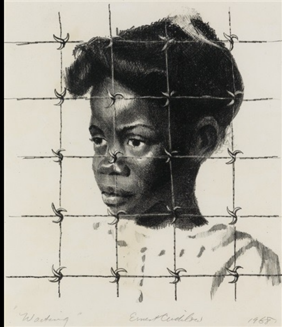
Ernest Crichlow (American, 1914–2005) Waiting 1968