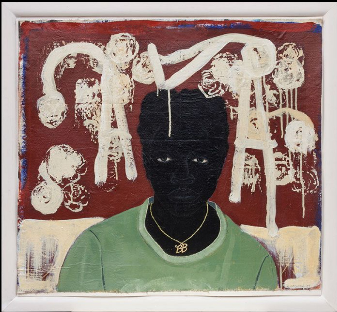
Kerry James Marshall (b. 1955), "Lost Boys: AKA BB," 1993,