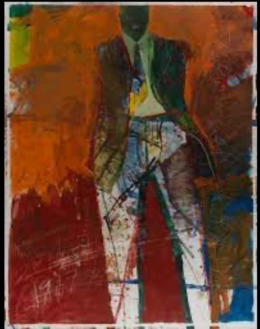
Raymond Saunders "Jack Johnson" 1971