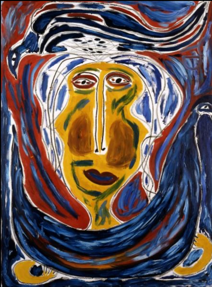
Thornton Dial, Sr., Life Go On , 1990, oil on canvas,