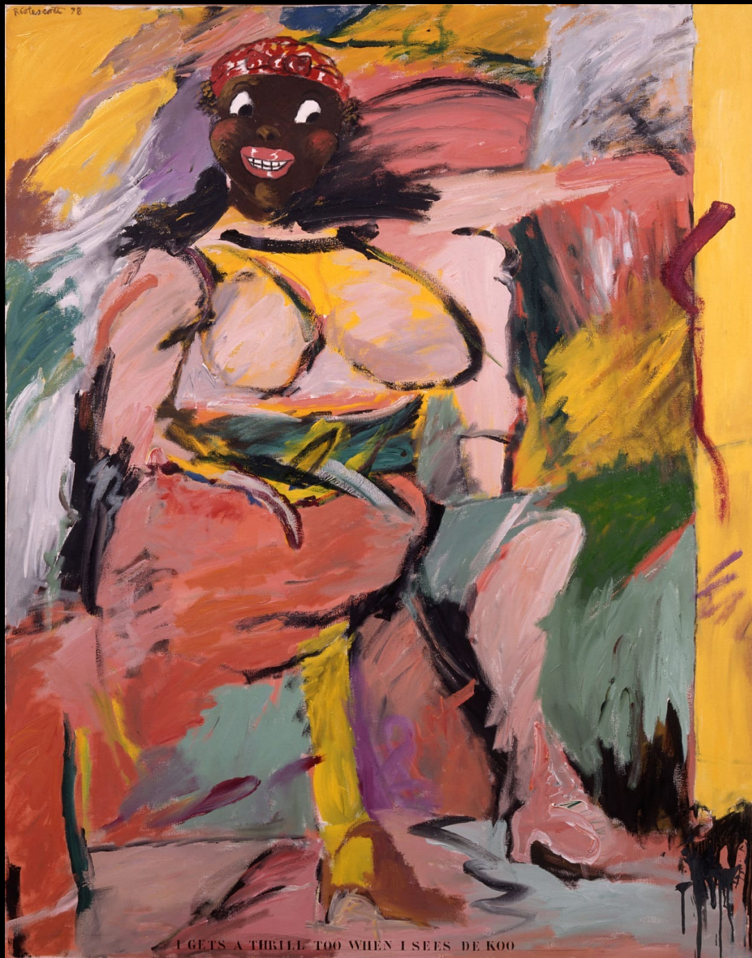
Robert Colescott I Gets a Thrill, Too, When I Sees De Koo , 1978, Acrylic on canvas, 84 x 60 inches.