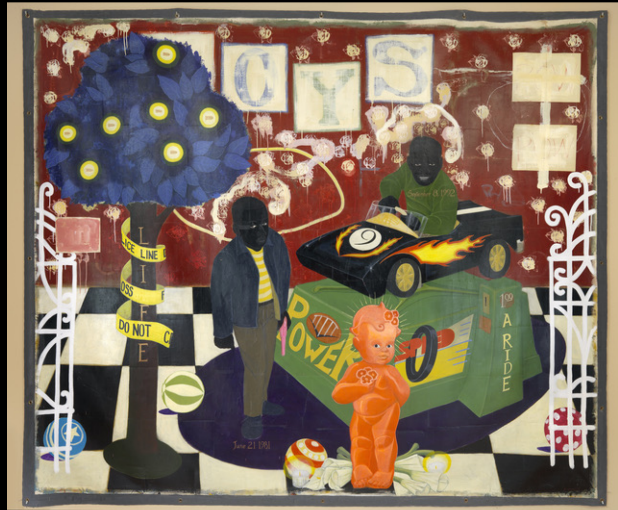
Kerry James Marshall The Lost Boys 1993