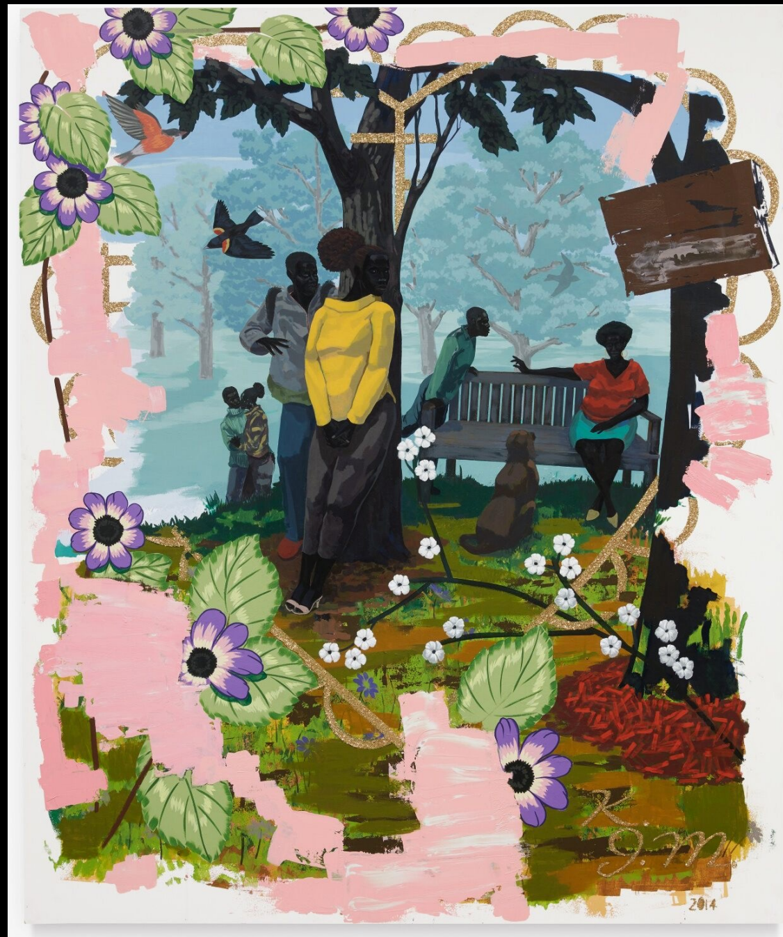
Kerry James Marshall VIGNETTE 19