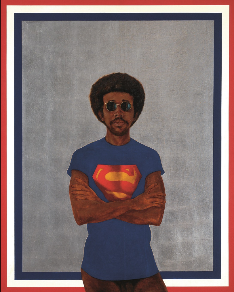
Barkley L. Hendricks, Icon for My Man Superman ( Superman never saved any black people — Bobby Seale ), 1969.