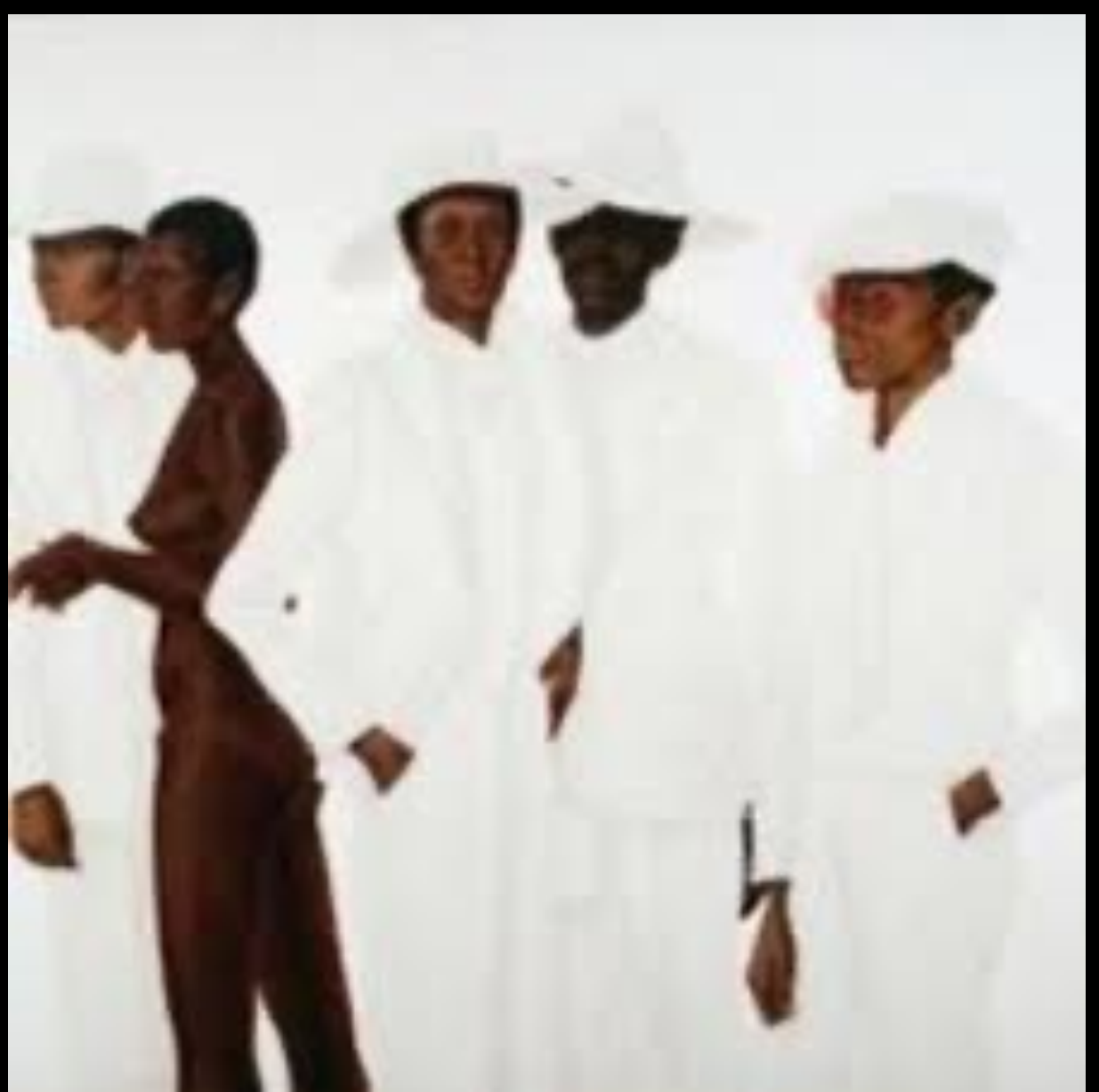
Barkley L. Hendricks What's Going On , 1974