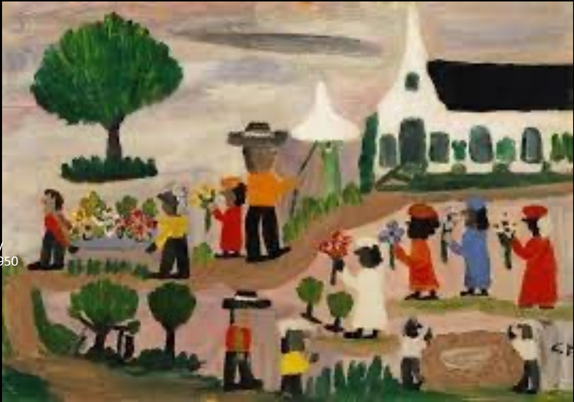
Funeral Procession, by Clementine Hunter, 1950