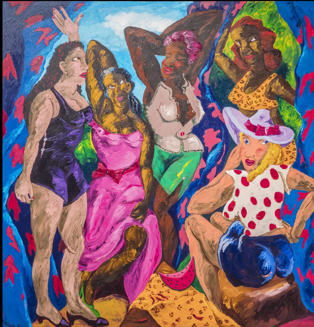
Robert Colescott Les Demoiselles d'Alabama: Vestidas , 1985, Acrylic on canvas, 96 x 92 inches.