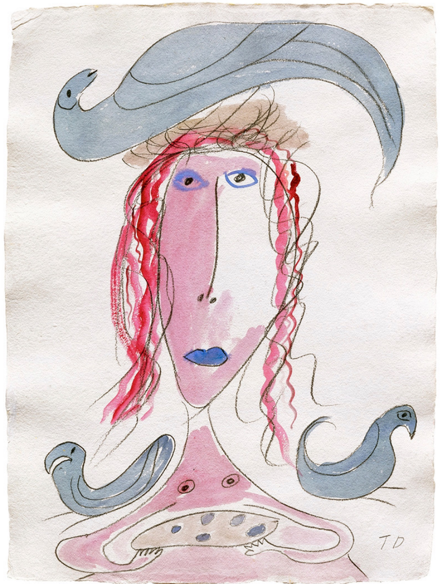
Thornton Dial Life Go On 1990