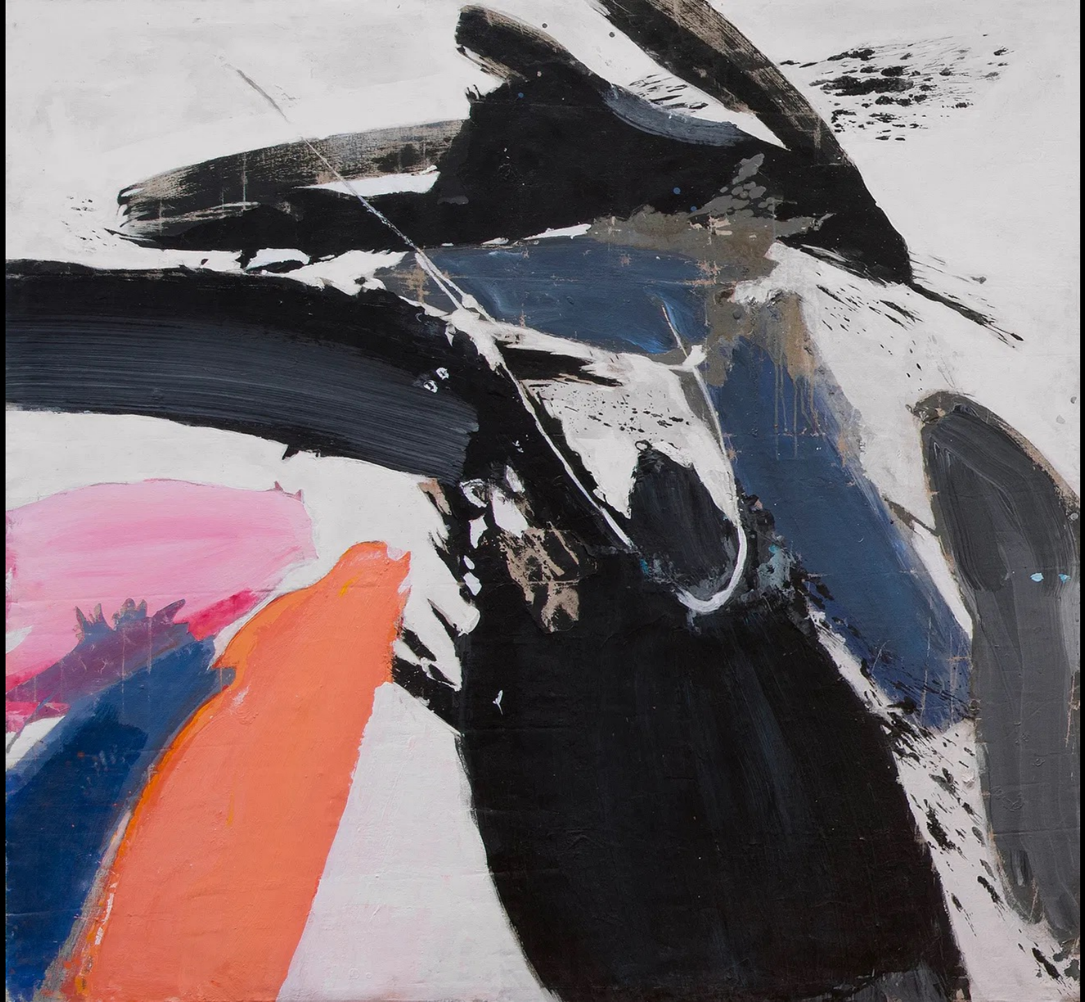
ED CLARK, "Winter Bitch," 1959 (acrylic on canvas,