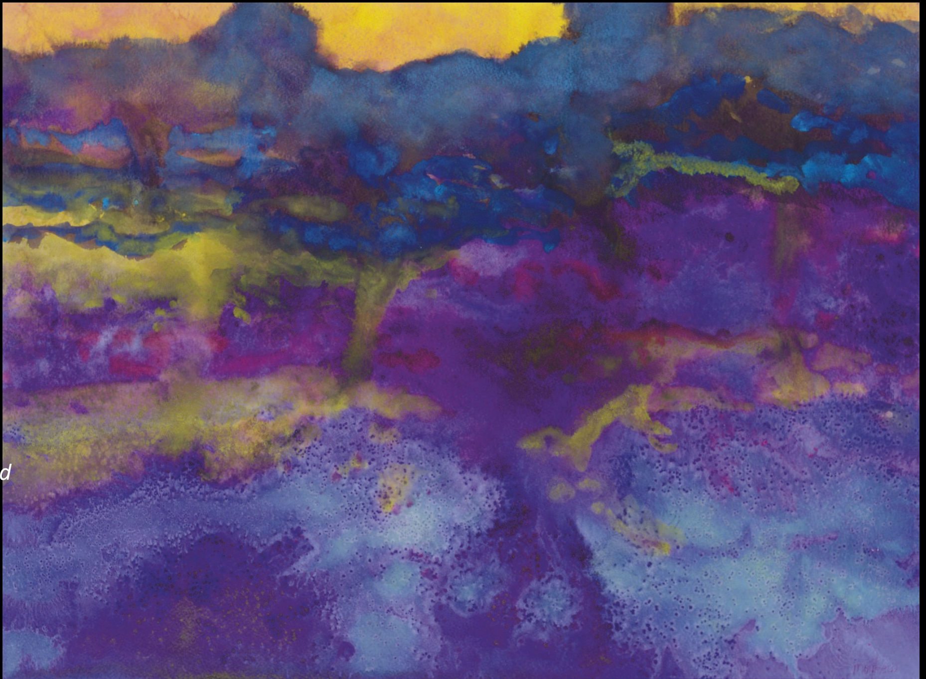
Richard Mayhew, Untitled (landscape)