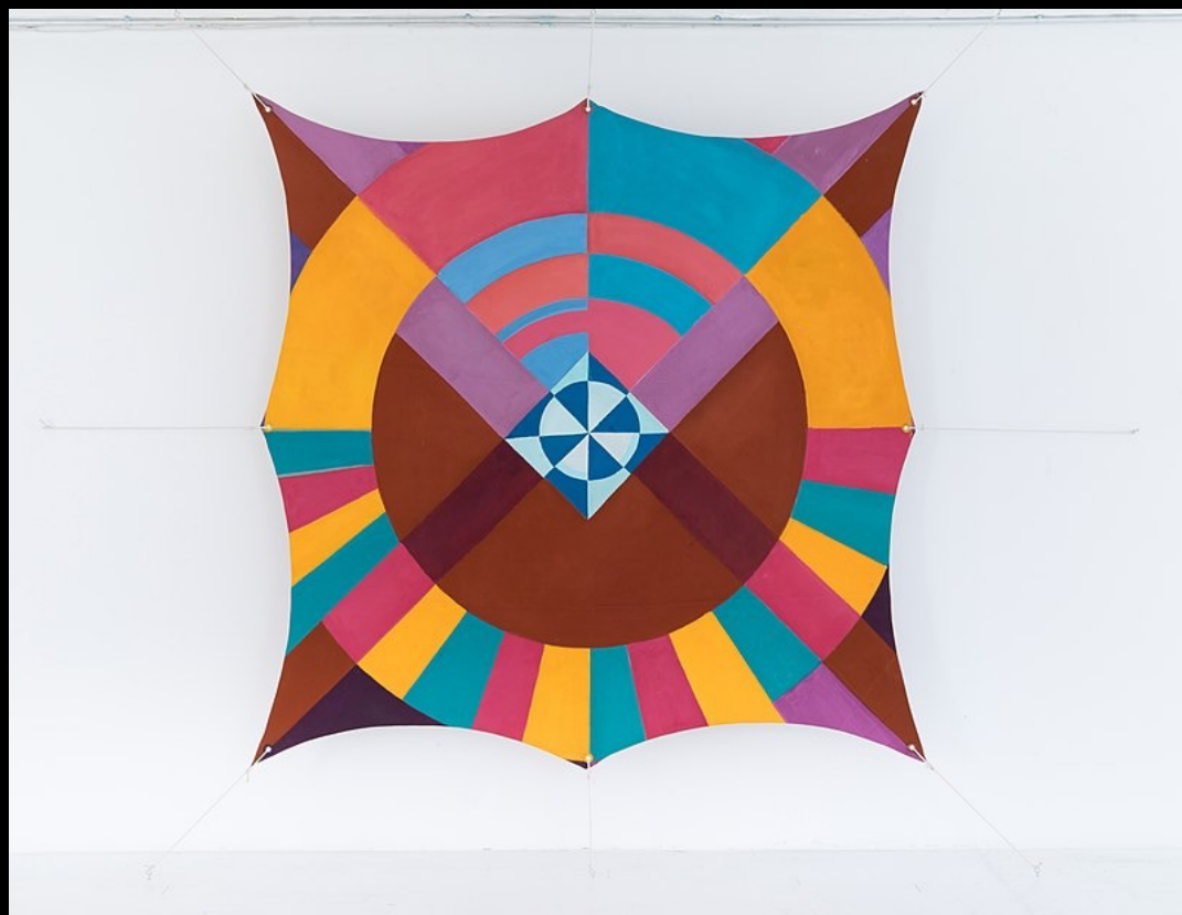
Joe Overstreet, Hoodoo Mandala , 1970 acrylic on canvas with metal grommets and cotton rope, 90 x 89 1/2 inches.,