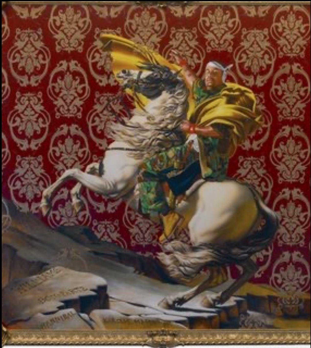
Kehinde Wiley (American, born 1977). Napoleon Leading the Army over the Alps , 2005. Oil on canvas,