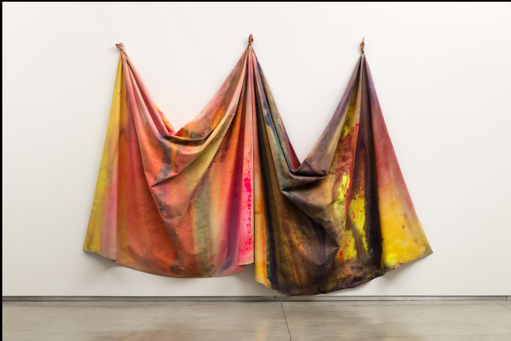
Sam Gilliam, 10/27/69 , 1969, acrylic on canvas, i