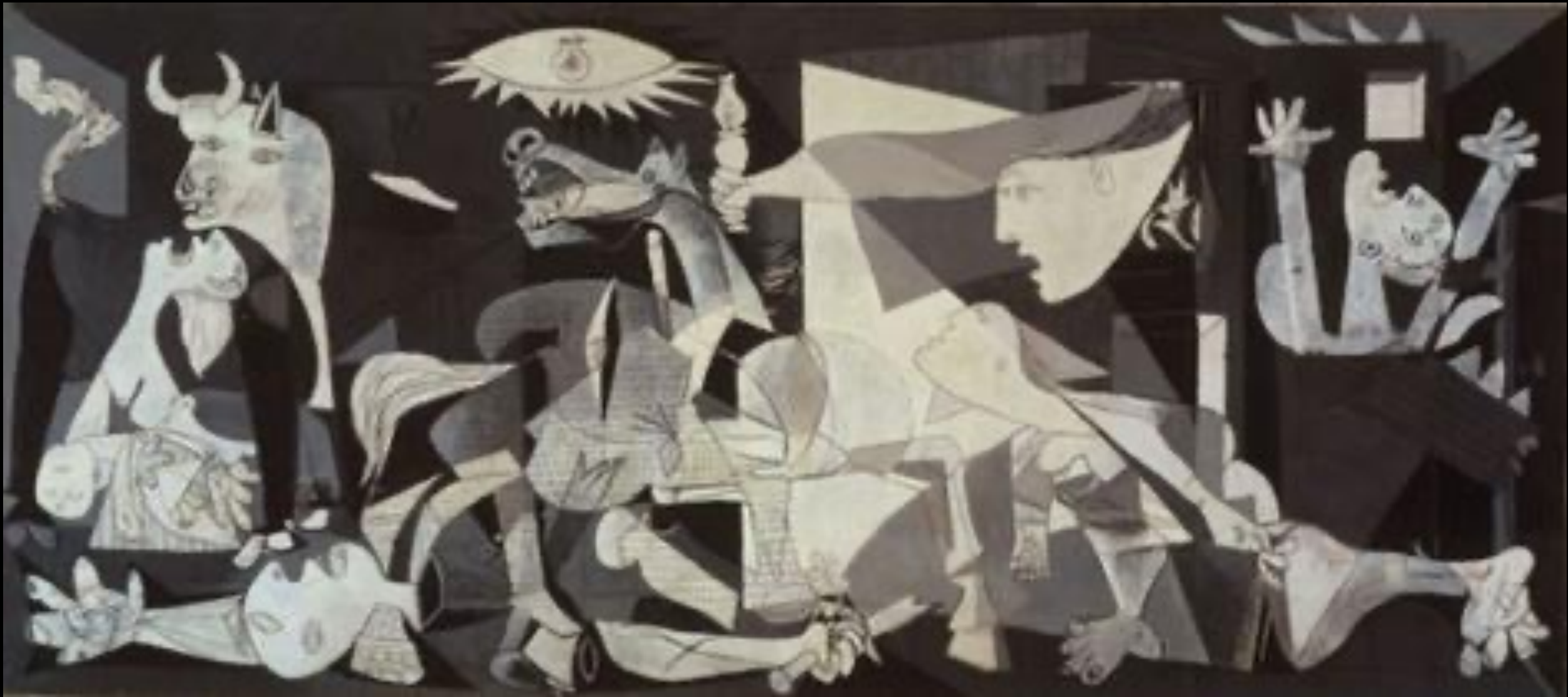
Picasso Guernica 1937