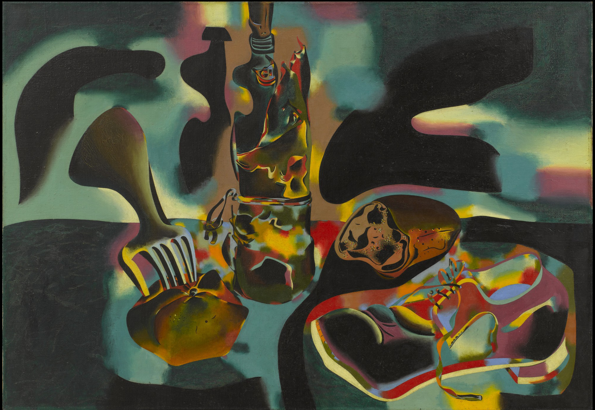
Jean Miro Still Life with Old Shoe Paris, January 24-May 29, 1937