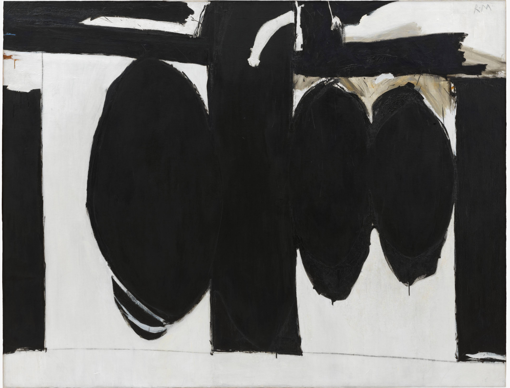
Robert Motherwell Elegy to the Spanish Republic No. 57