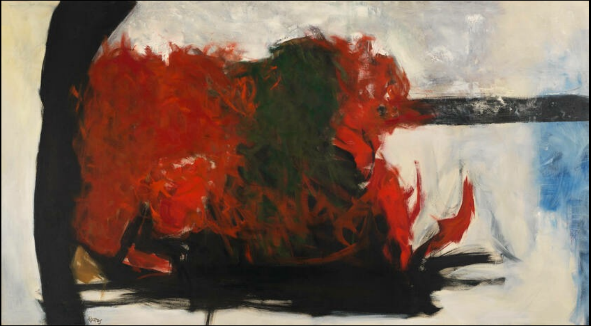
Theodoros Stamos High Snow, Low Sun 1957