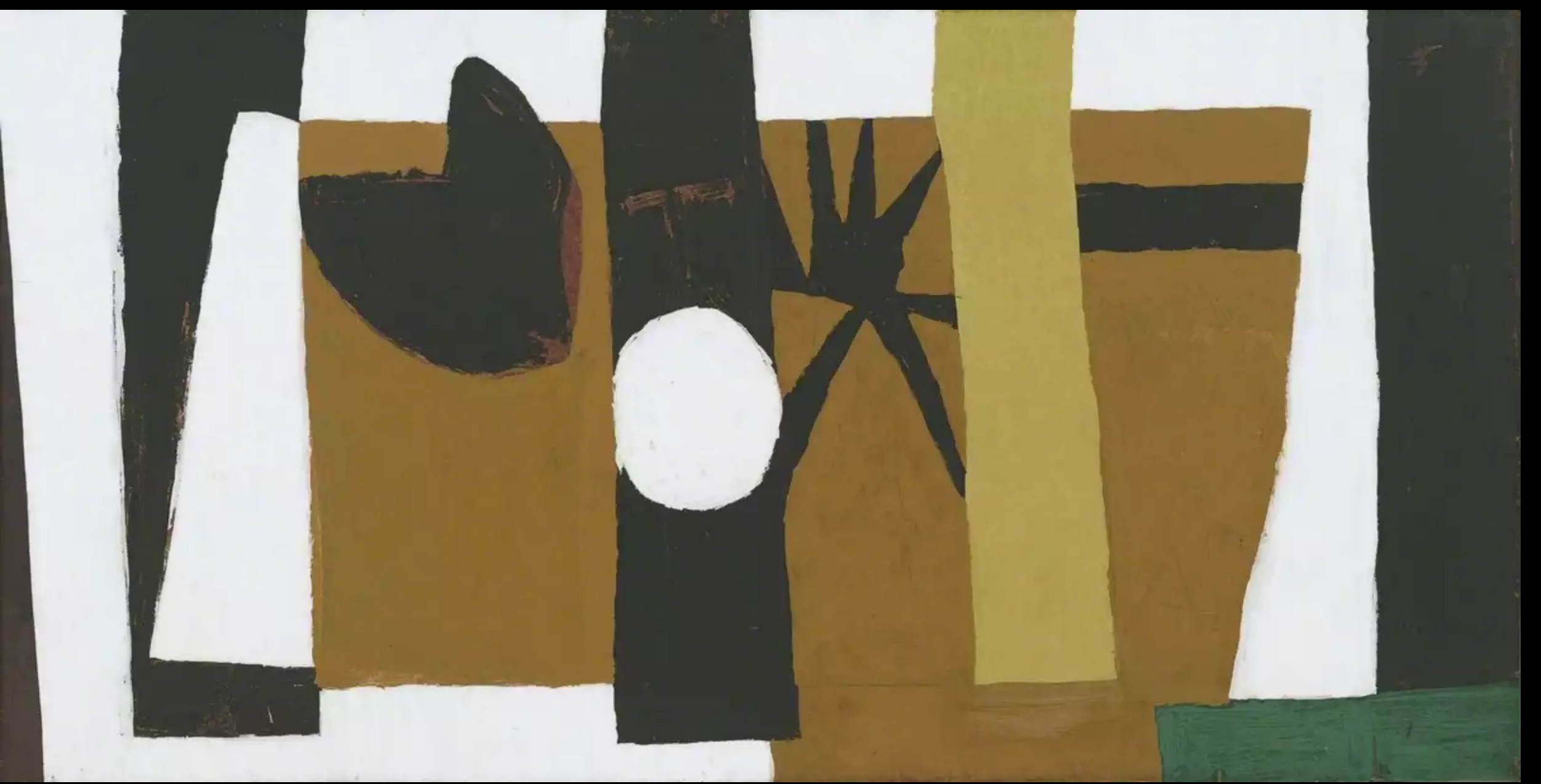
Robert Motherwell The Voyage 1949