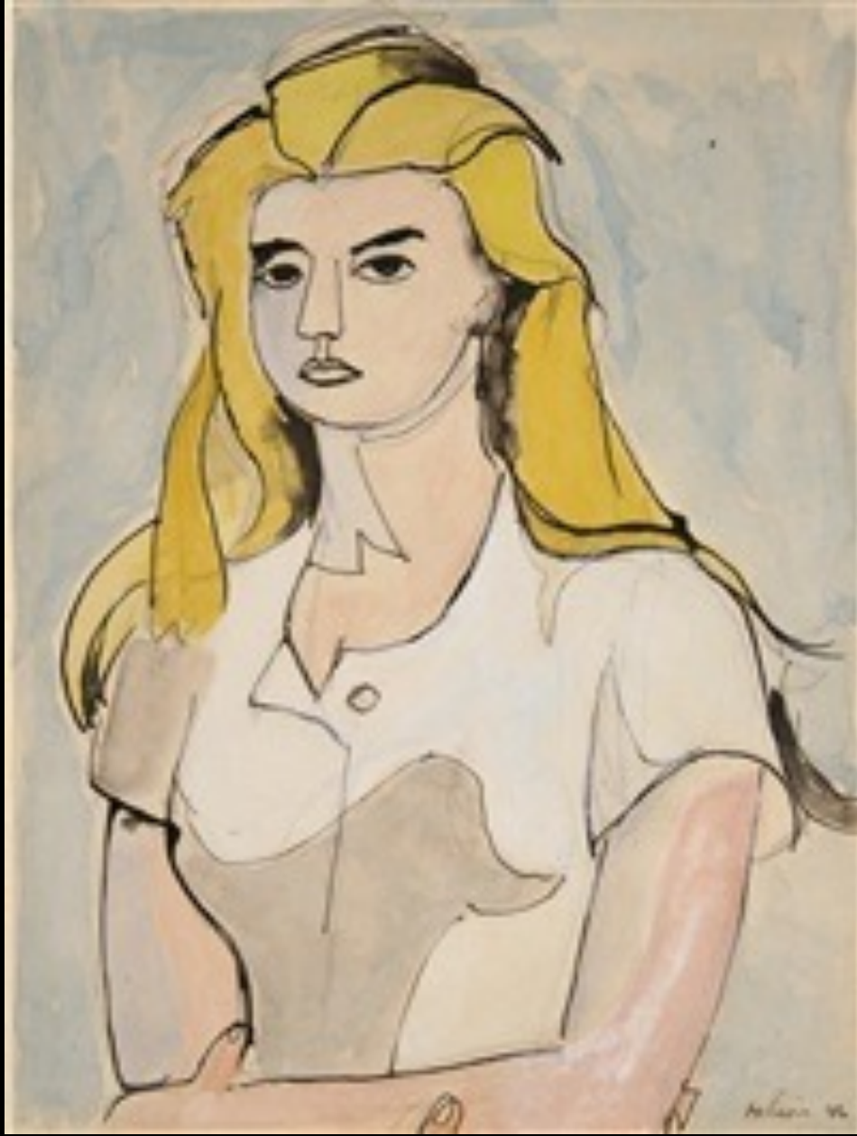
"Pegeen" 54, 1946