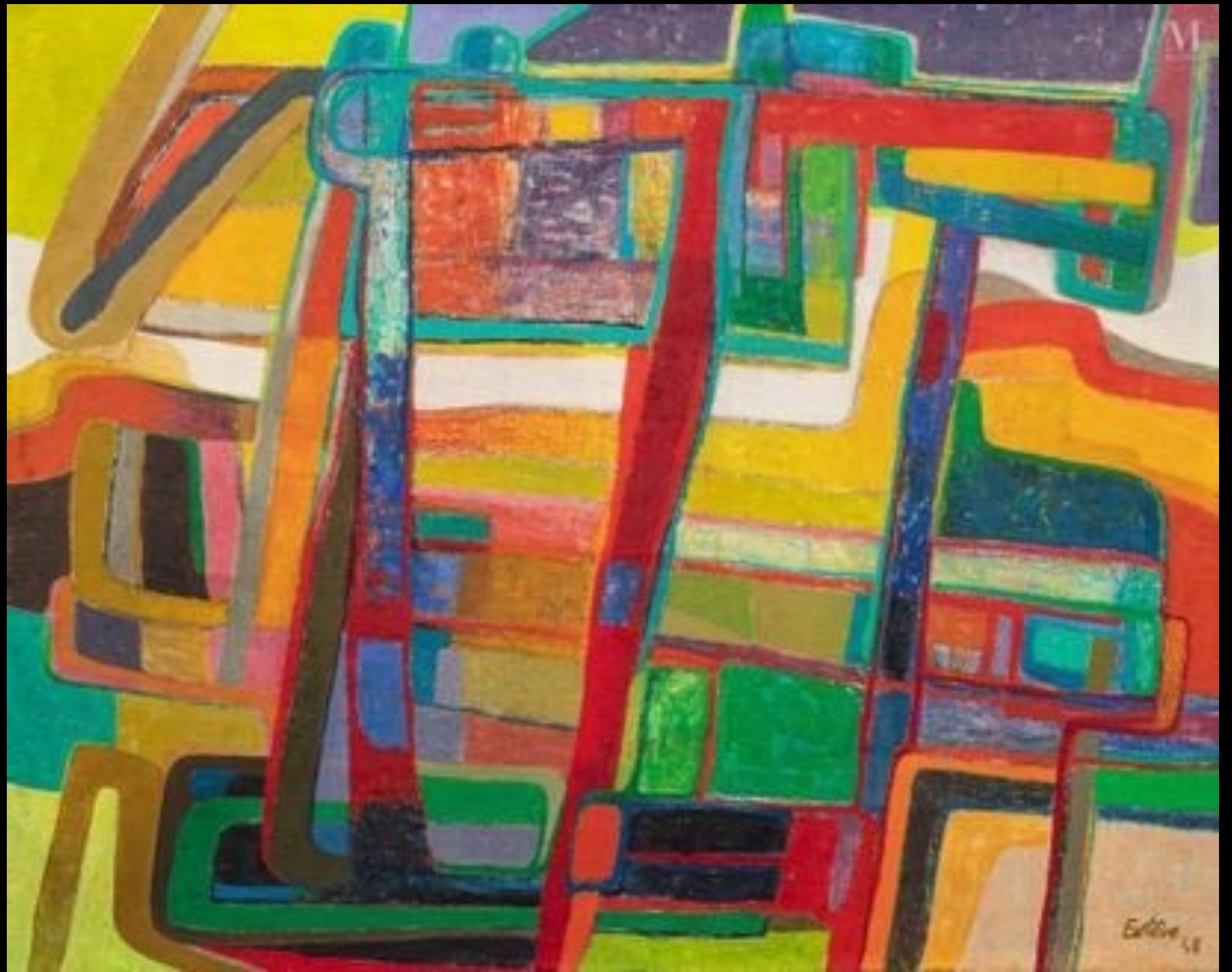
Maurice Estève La colline aux 3 arbres 1948