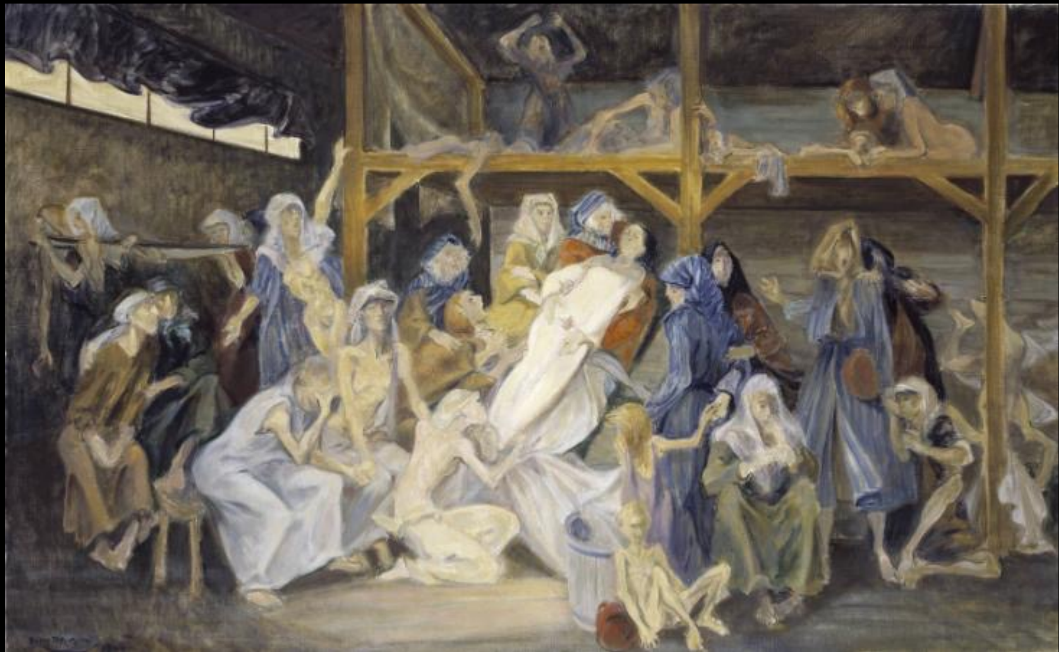
Boris Taslitzky La Mort de Danielle Casanova