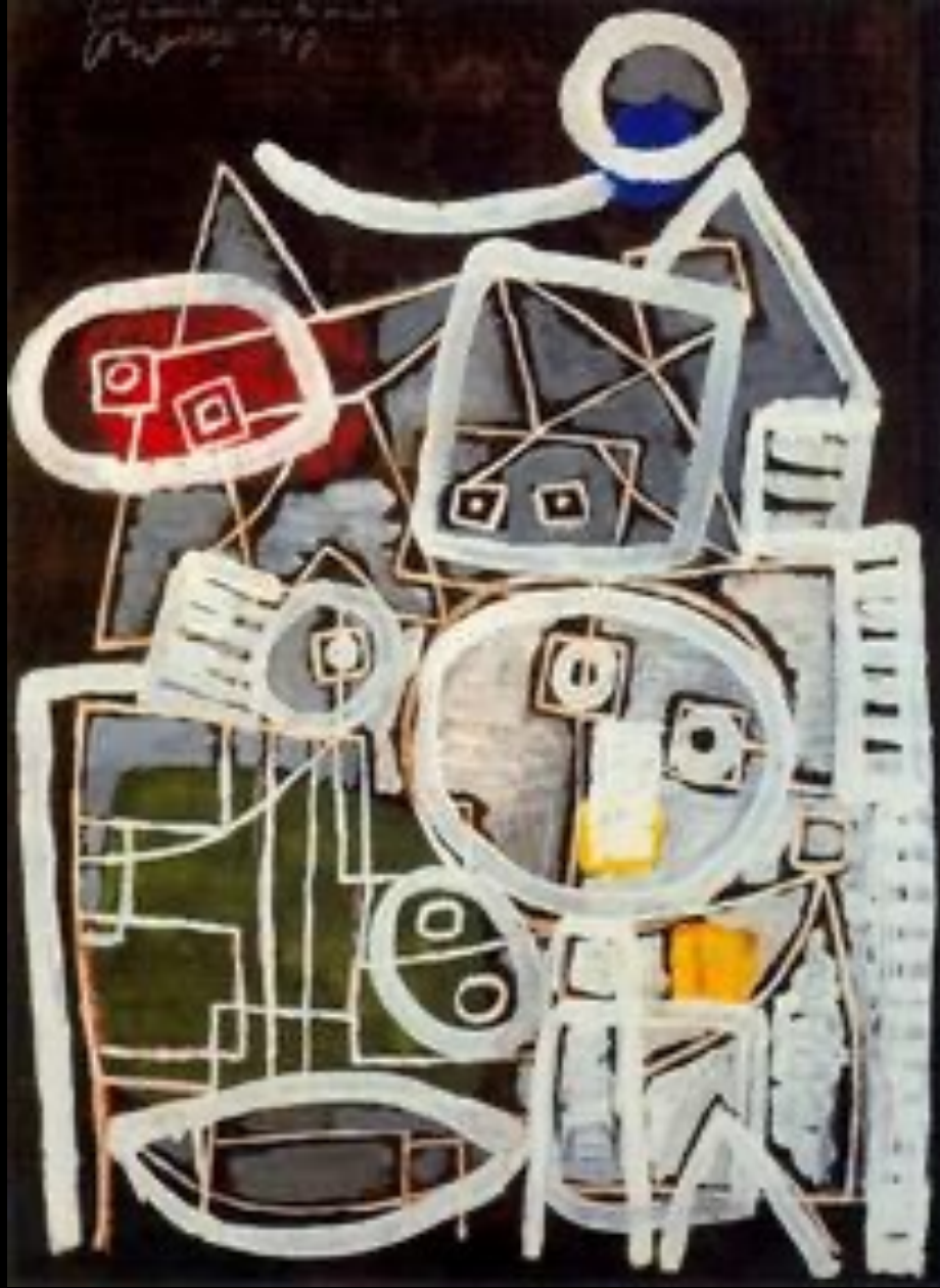
Corneille Children in the House 1948