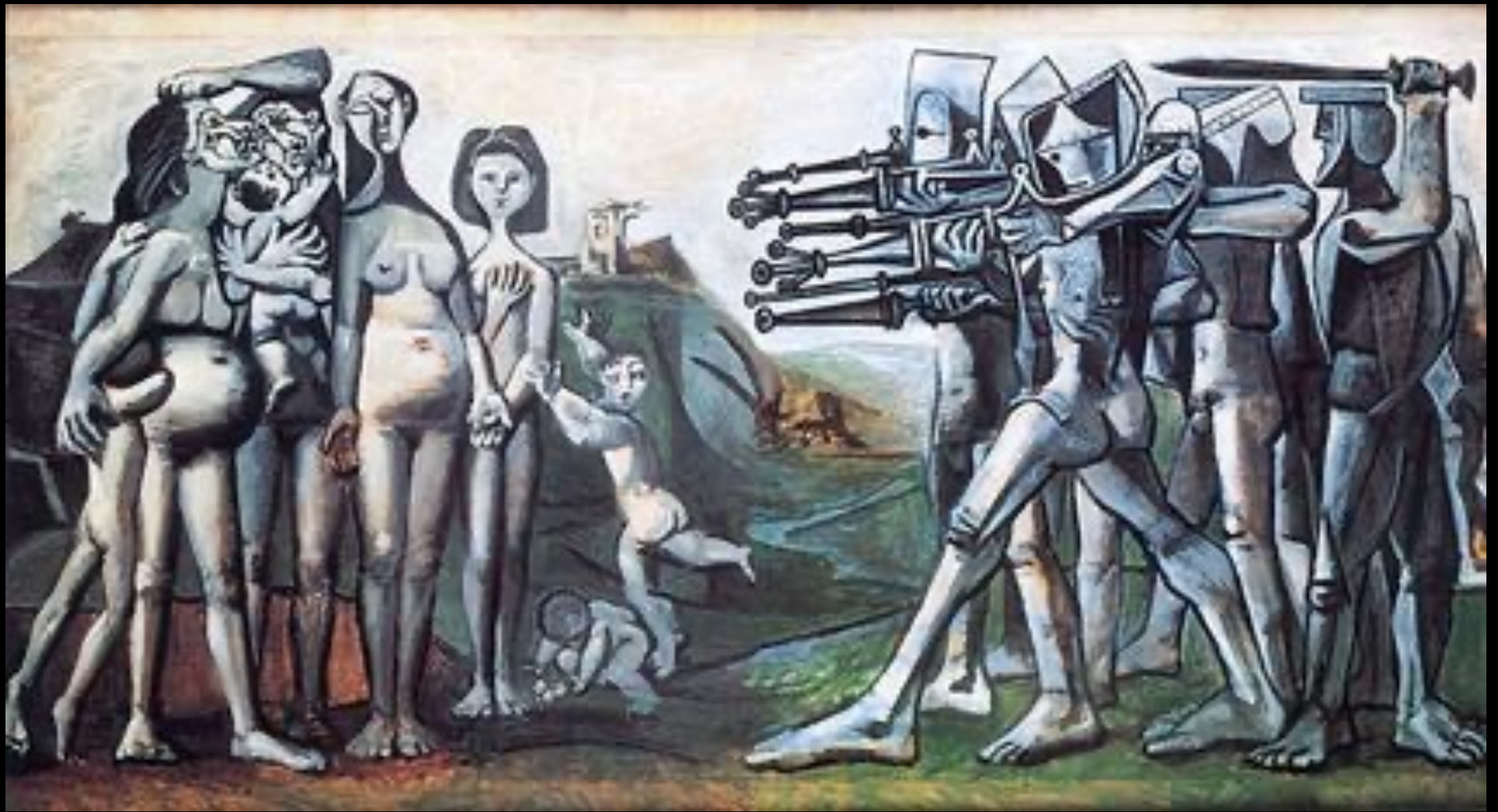
Picasso Massacre in Korea 1951