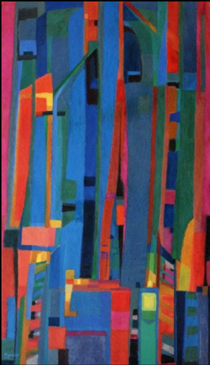
Alfred Manessier Salve Regina 1945