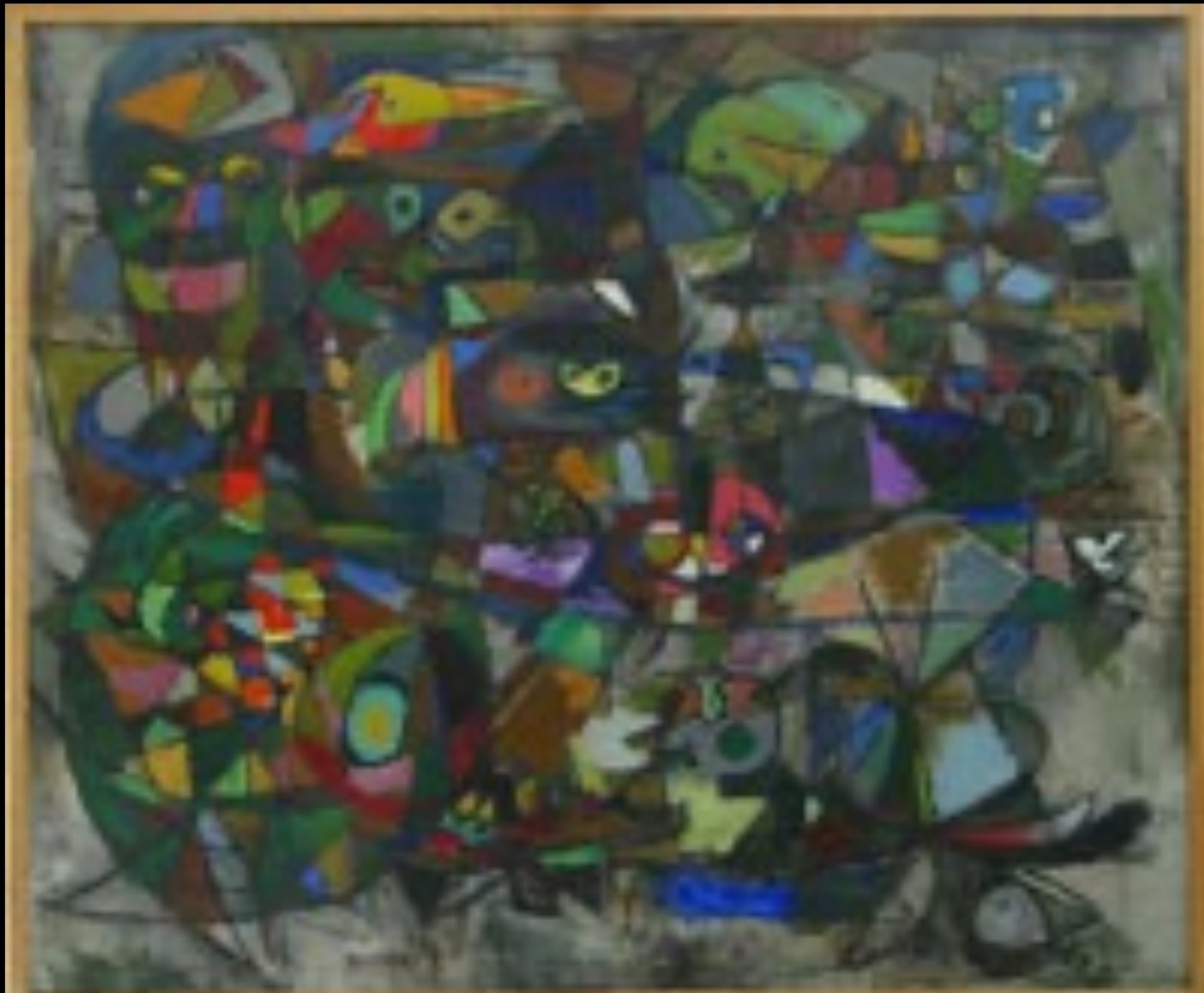
Asger Jorn Smating 1940