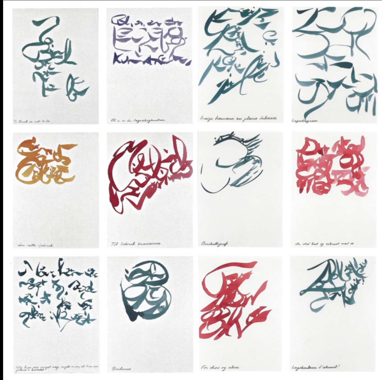
Linolog II 1972