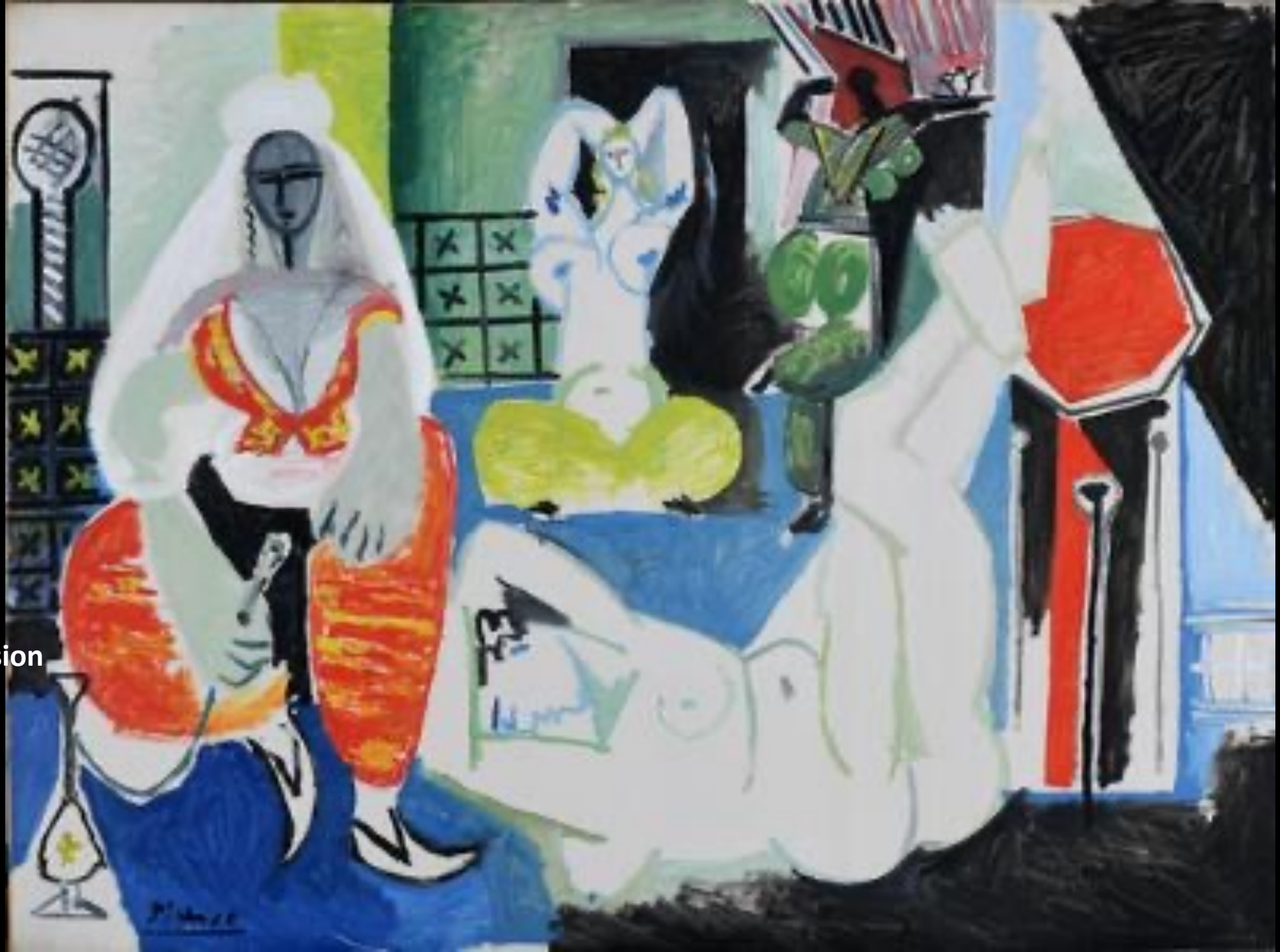
Picasso Women of Algiers, Version "I" 1954