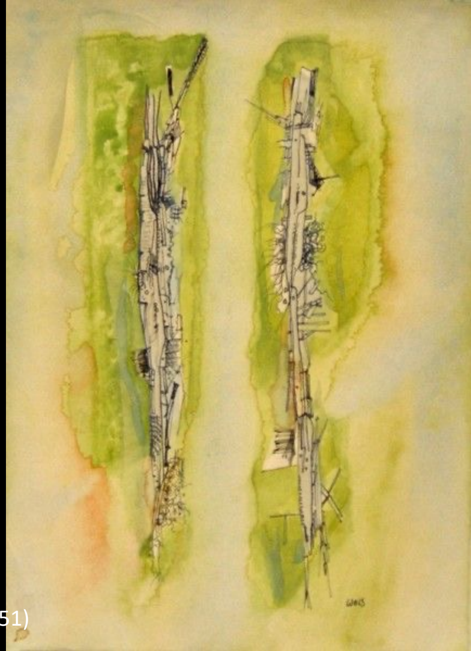
Wols (1913 - 1951) Untitled circa 1947-1949