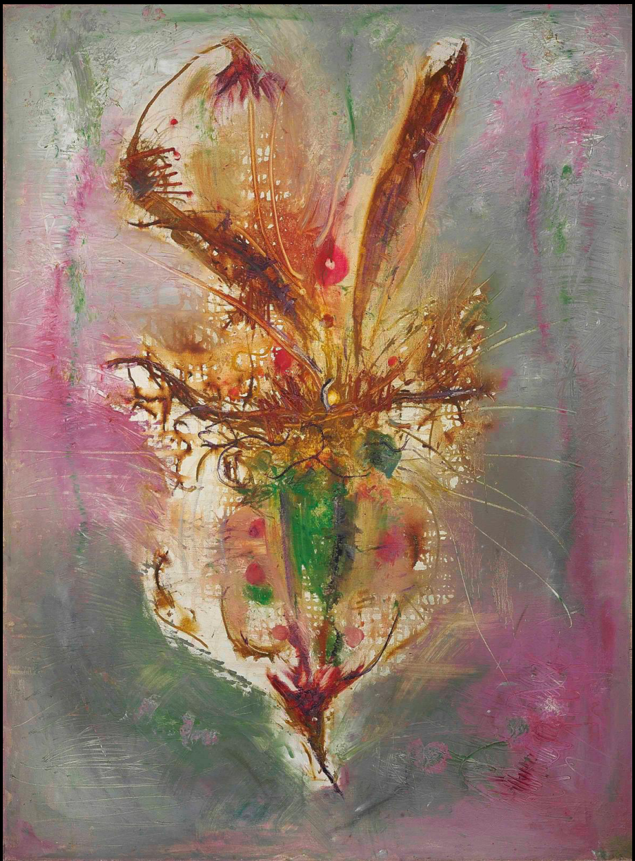
Wols (1913–1951), L'inachevée (Champigny) , 1950-1951, oil on canvas