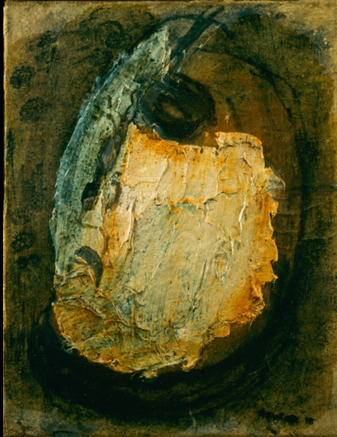
Jean Fautrier Hostage Number 7 1944