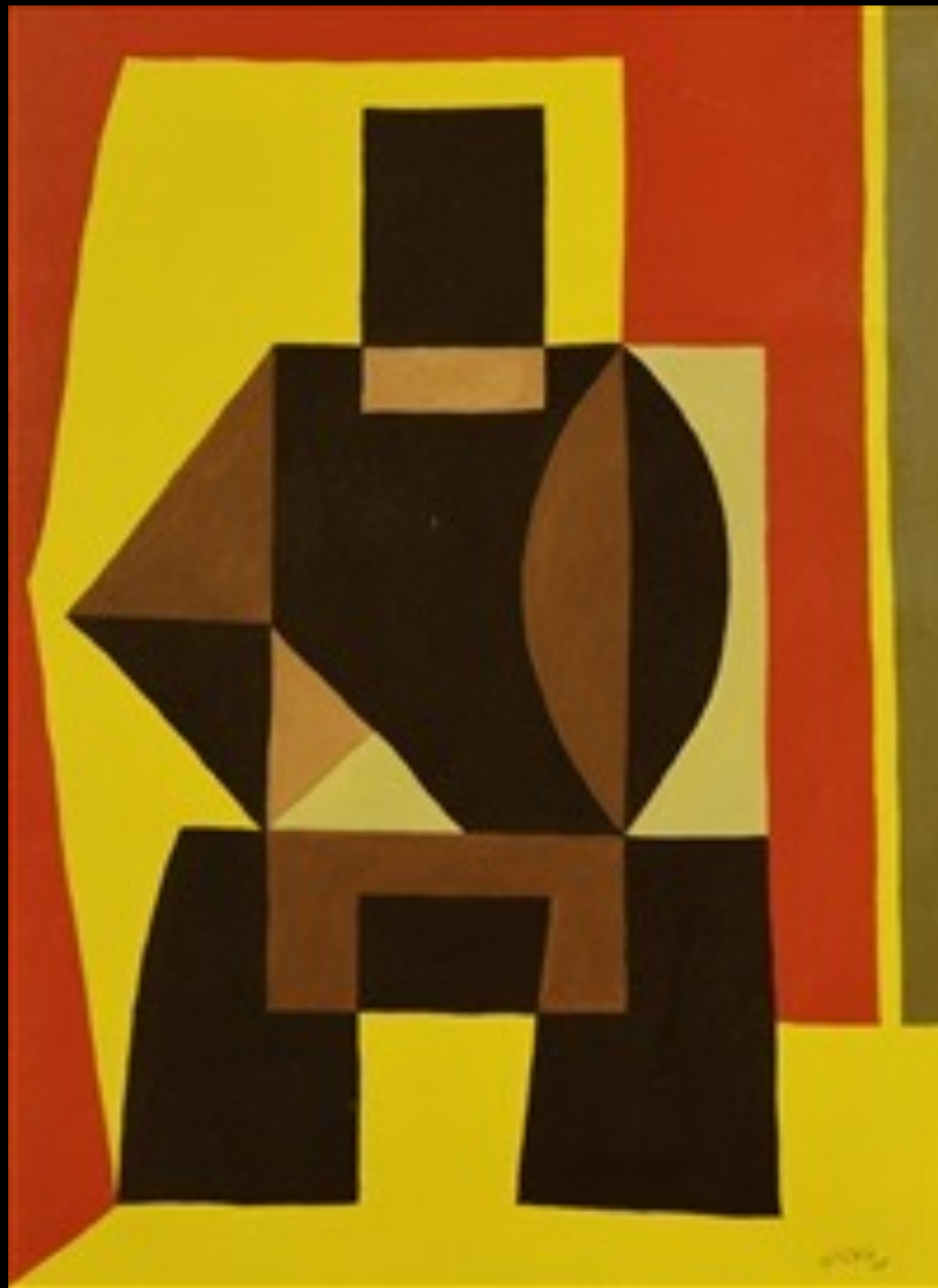
Léon Gischia Composition 1949