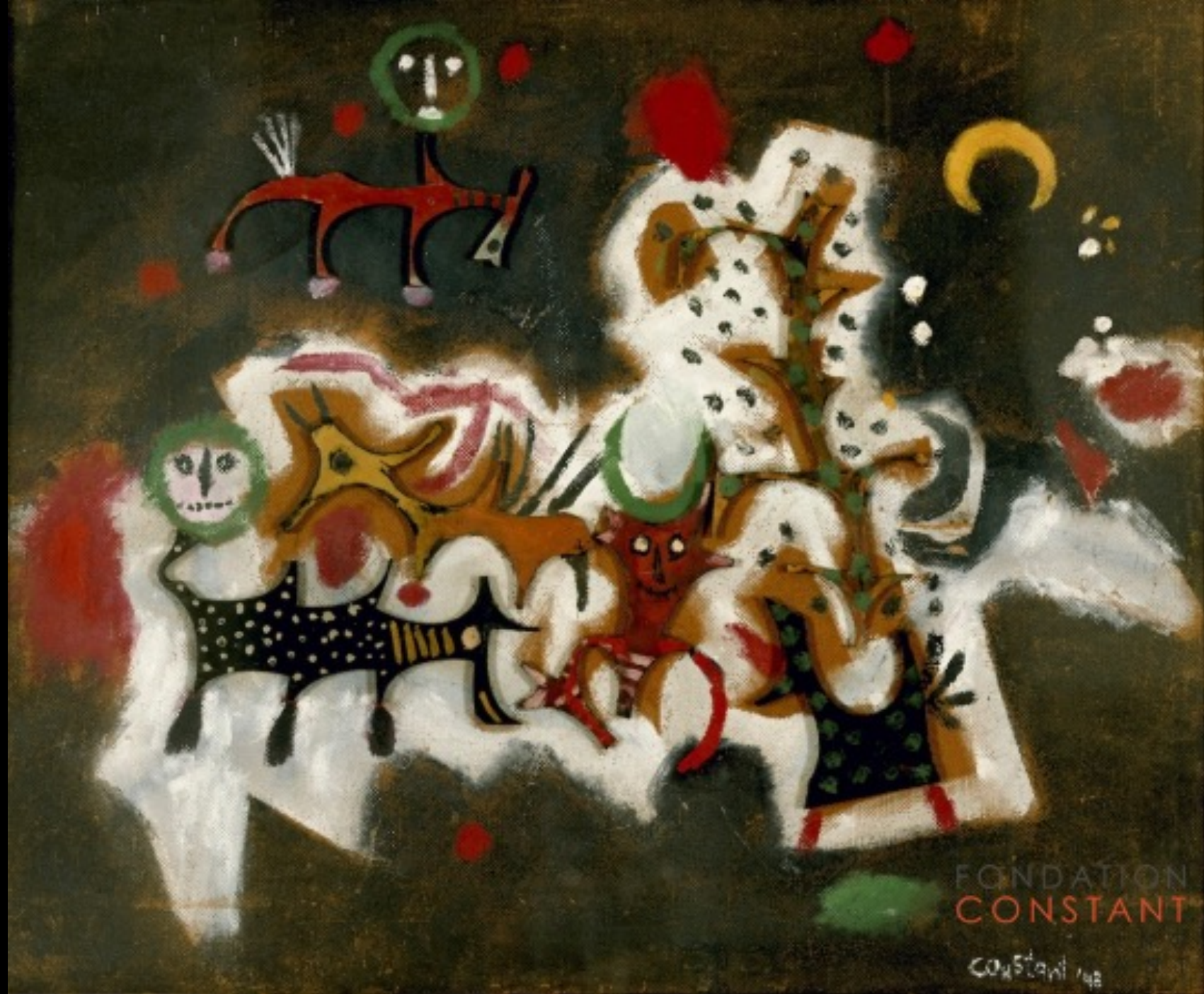
Constant Maanlandschap [I] 1948