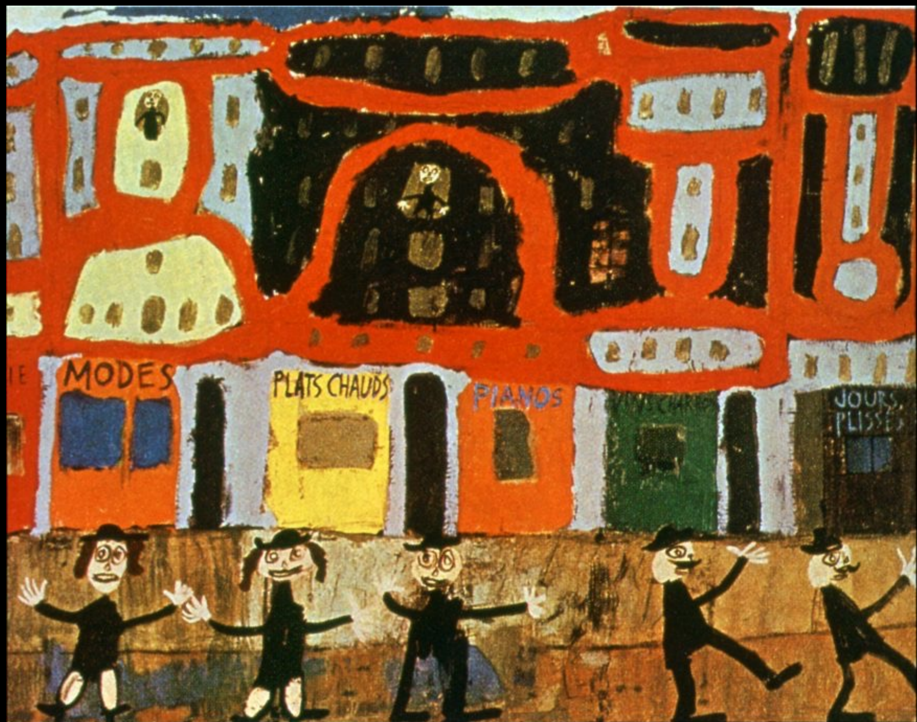
Jean Dubuffet, View of Paris, The Life of Pleasure , 1944, oil on canvas,