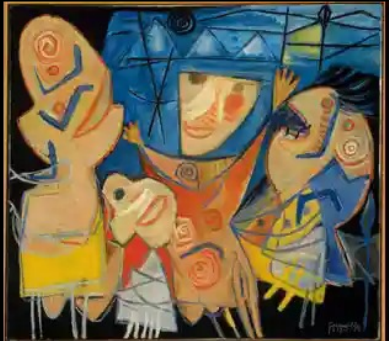
Fête Nocturne (Party at Night), a canvas by Corneille, from 1950,