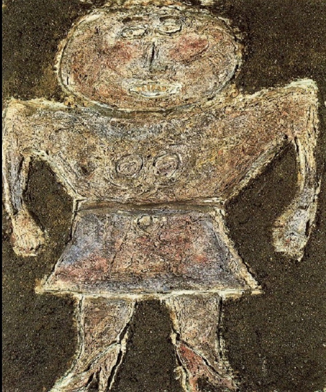
Jean Dubuffet, Miss Cholera , January 1946, oil, sand, pebbles, and straw on canvas