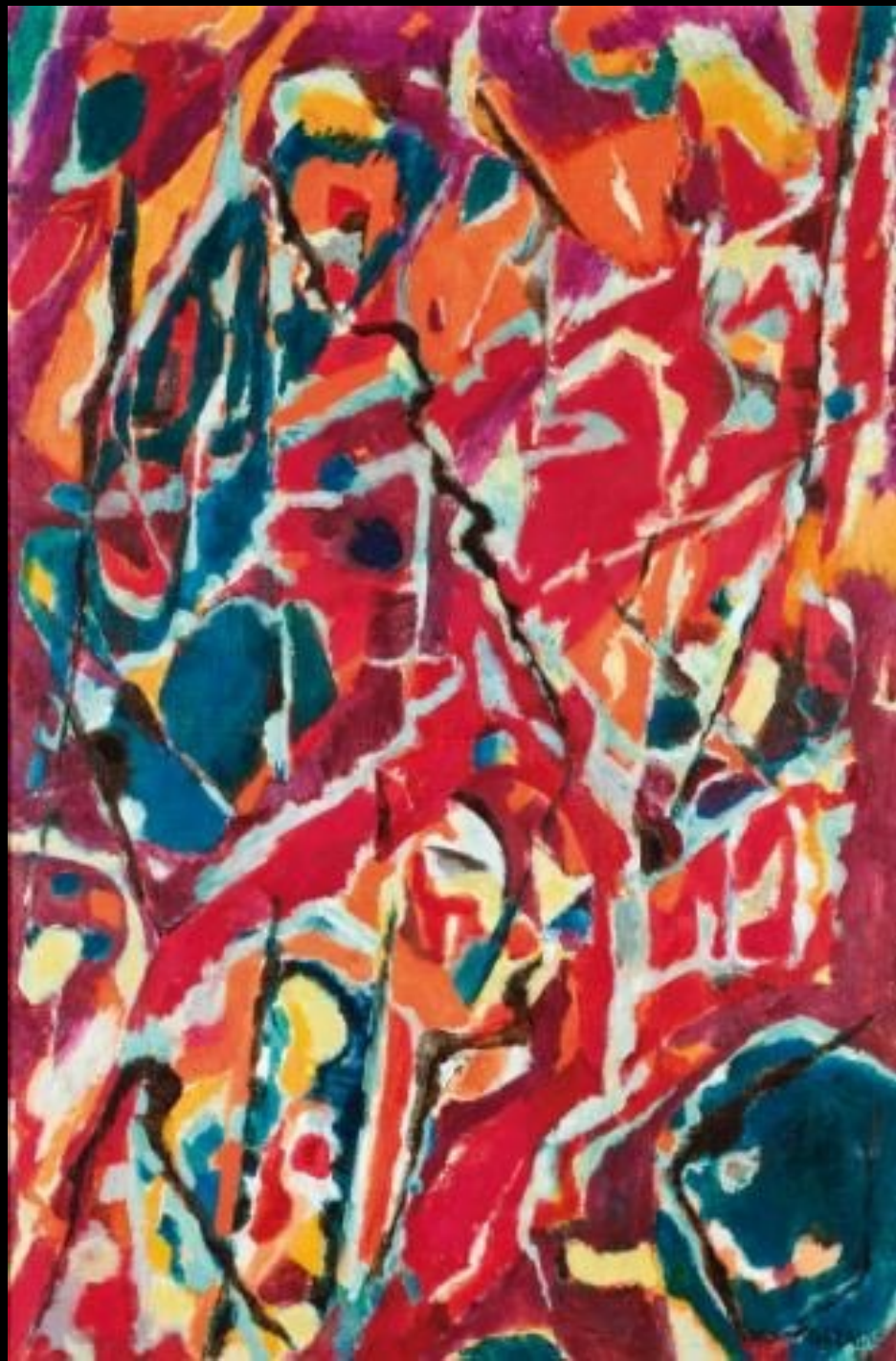
Jean Rene Bazaine Autumn 1948