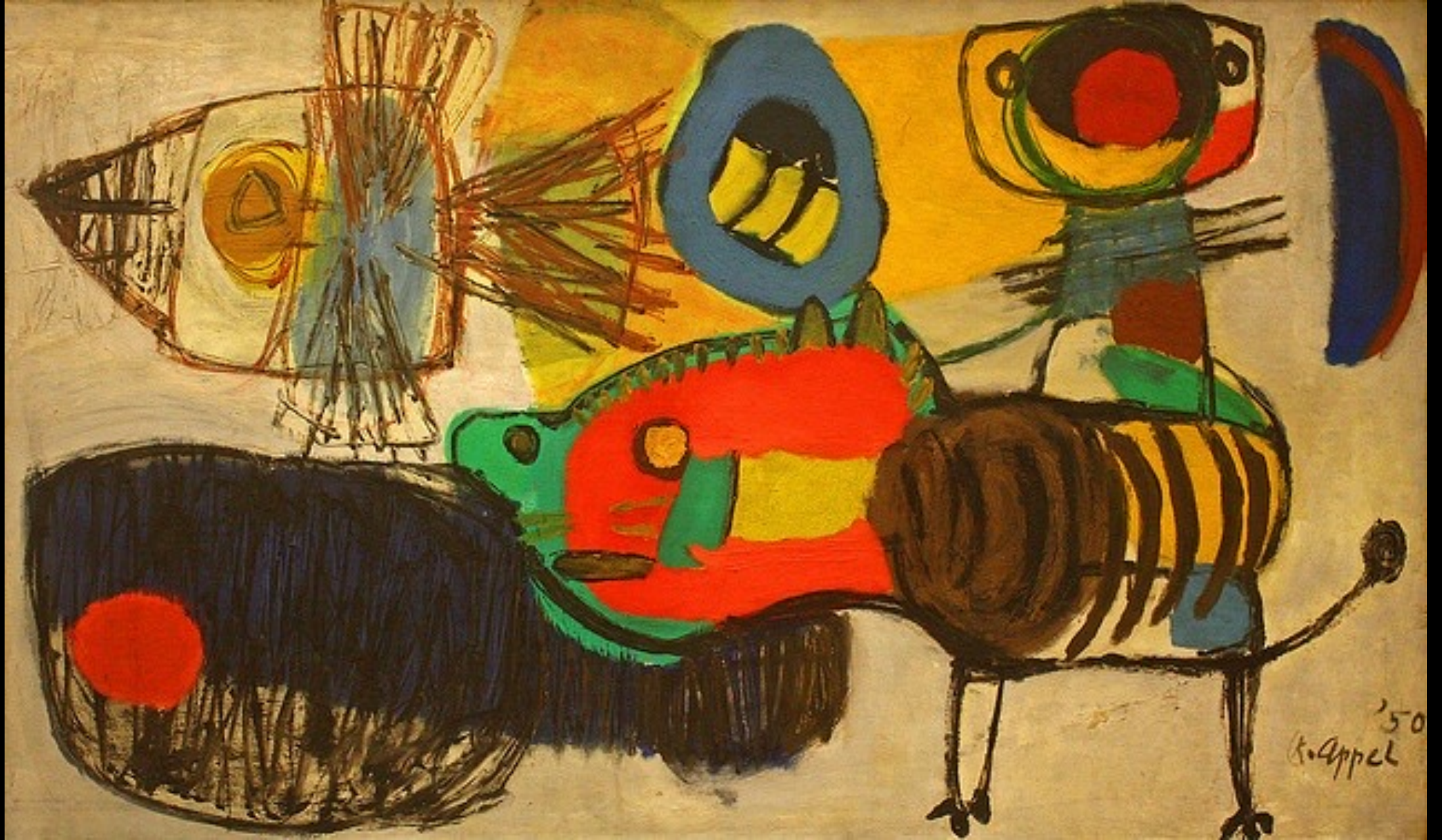
Karel Appel - la promenade, oil on canvas, 1950