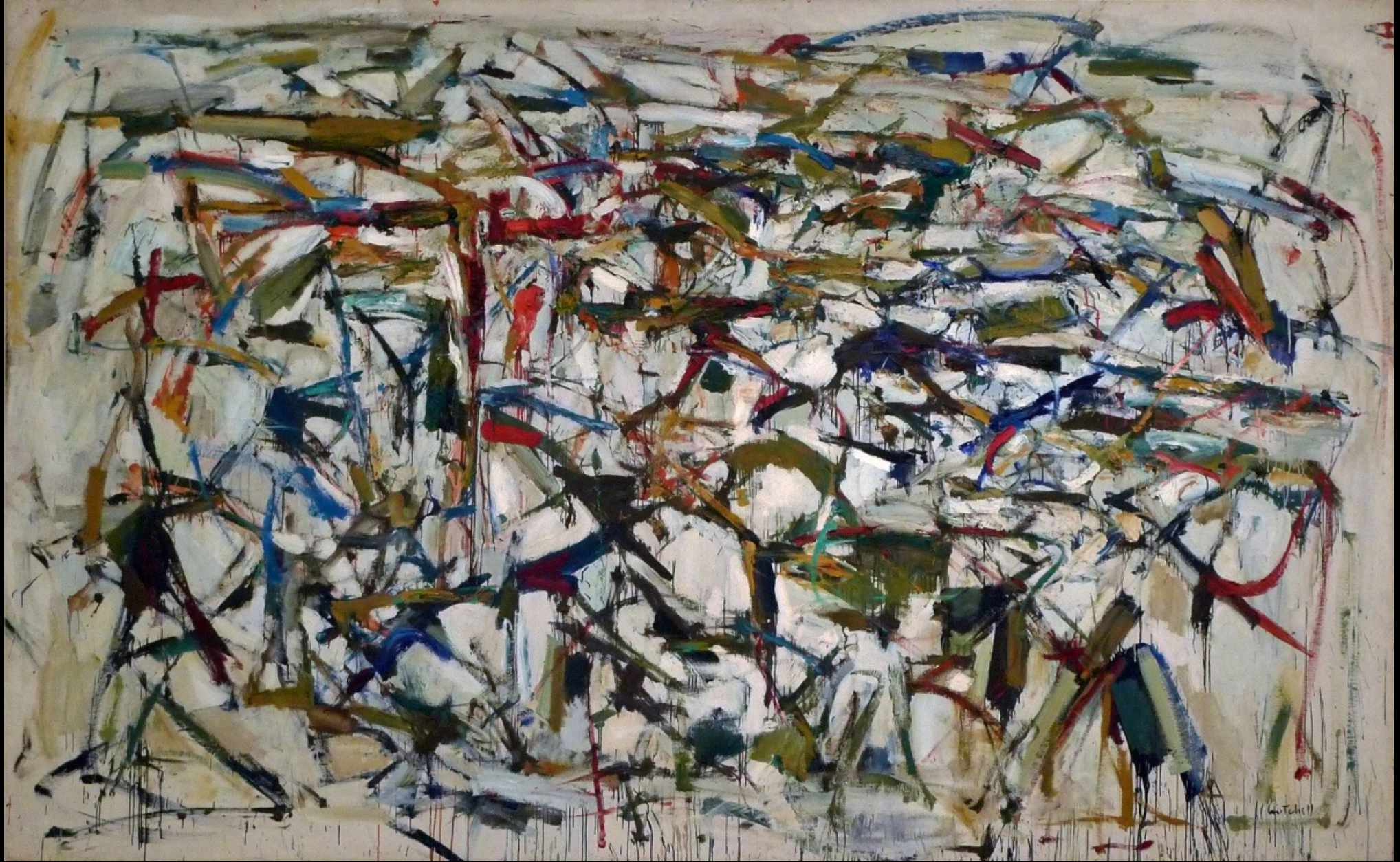
Joan Mitchell, Piano mécanique , 1958. Oil on canvas