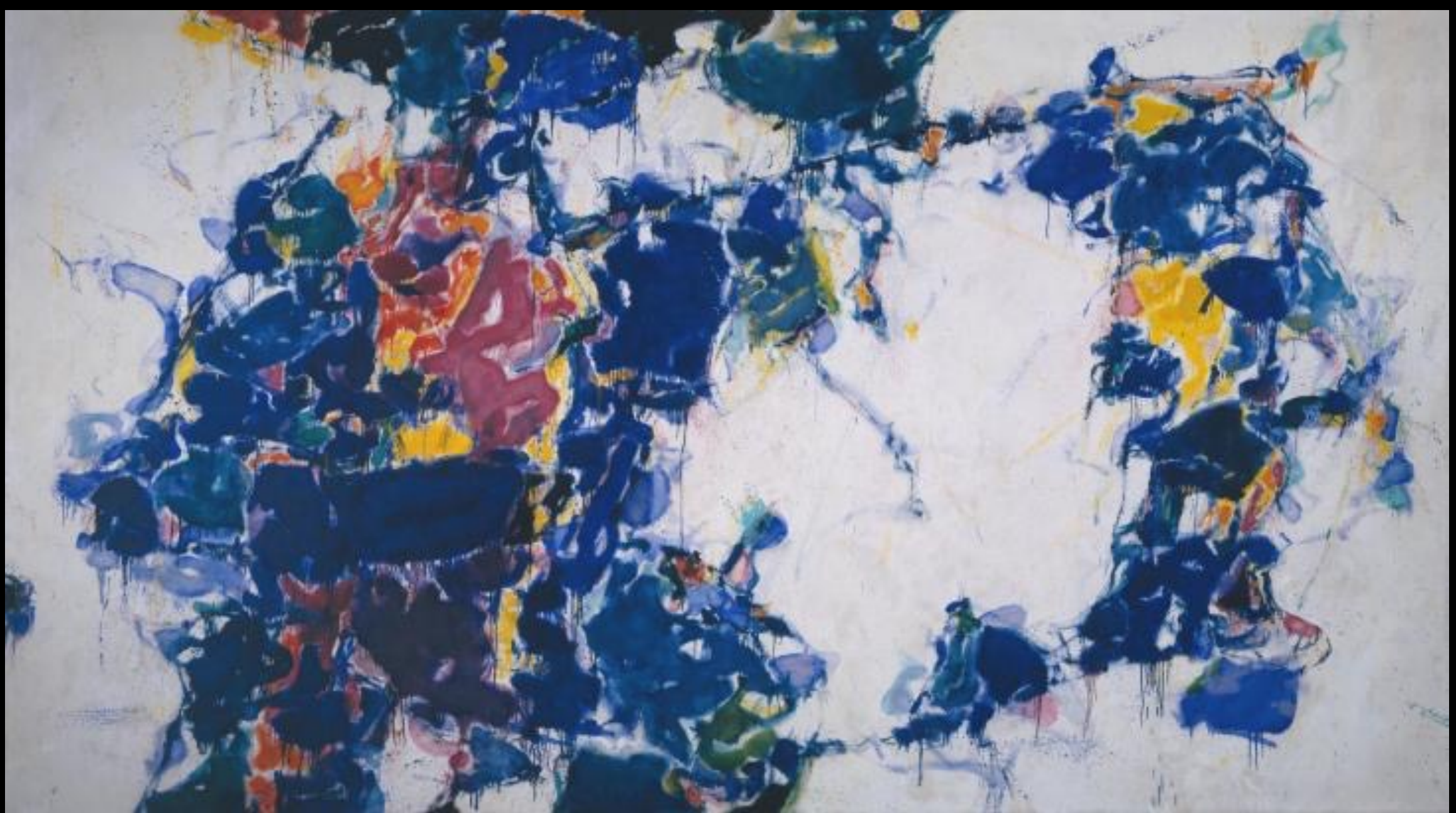
Sam Francis (1923-1994) Around the Blues 1957