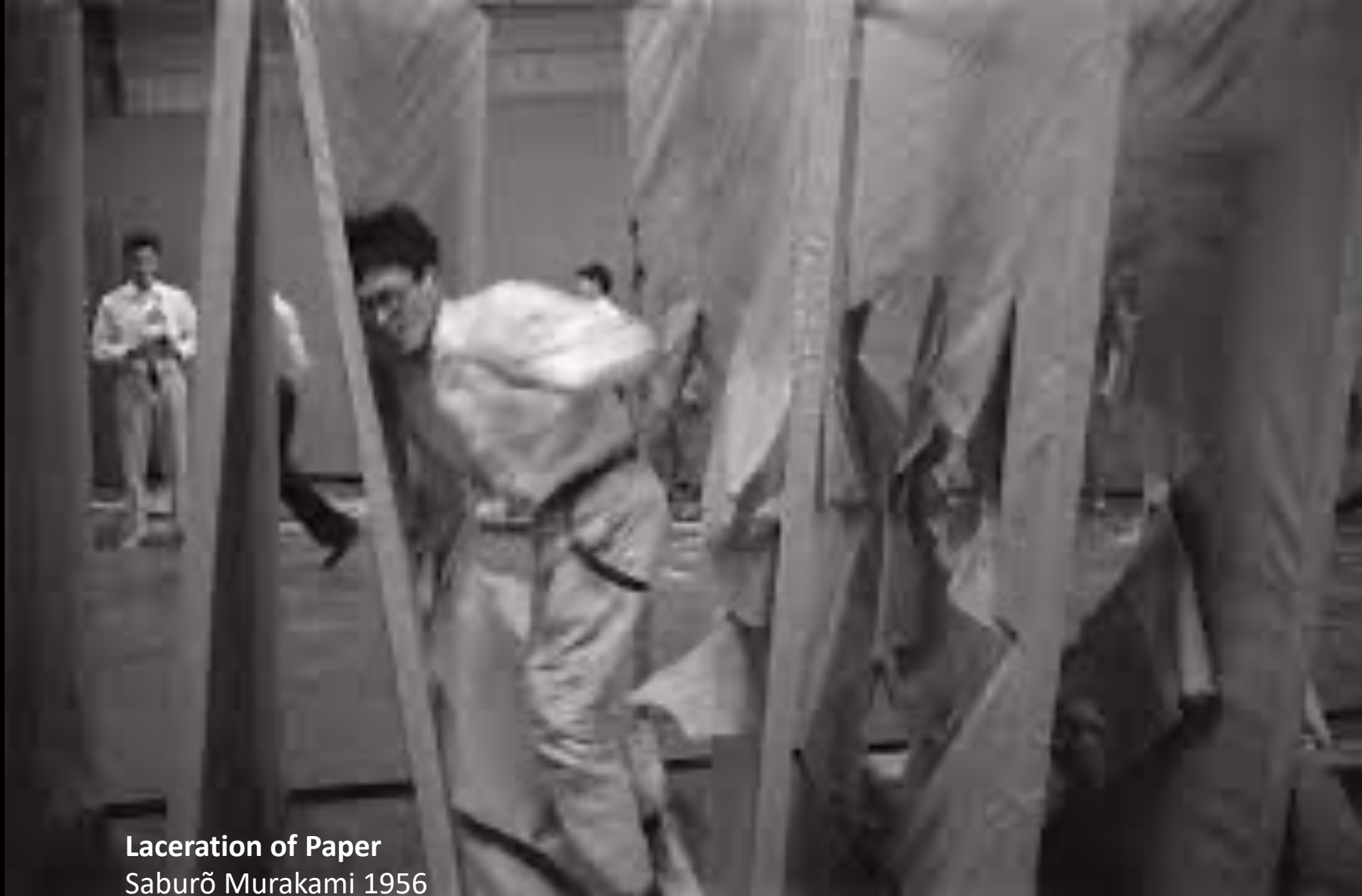
Laceration of Paper Saburō Murakami 1956