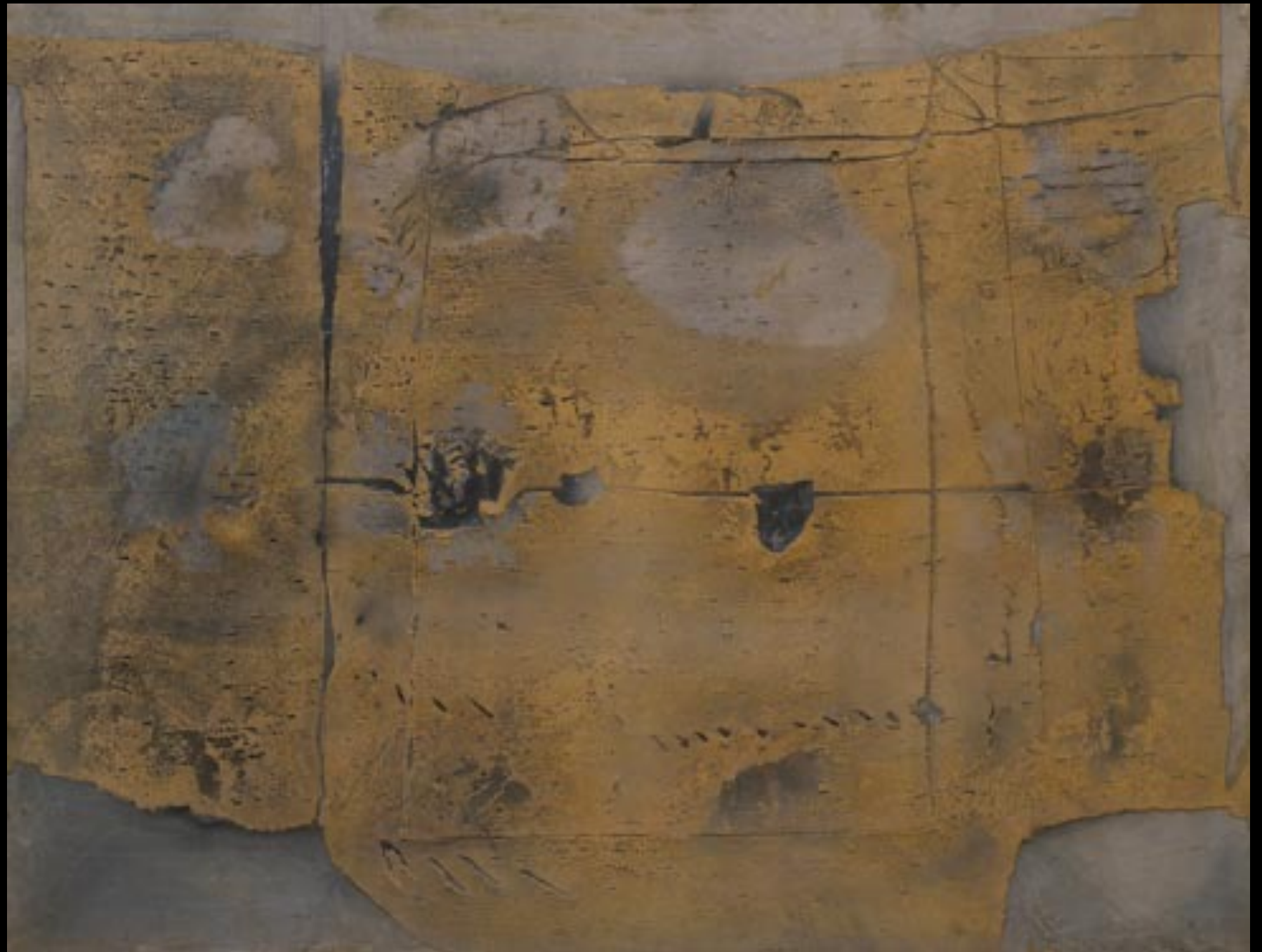
Tapie Great Painting 1958