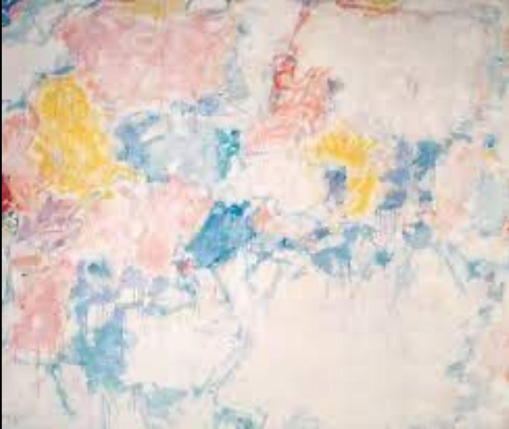
Sam Francis Pink with turquoise 1952