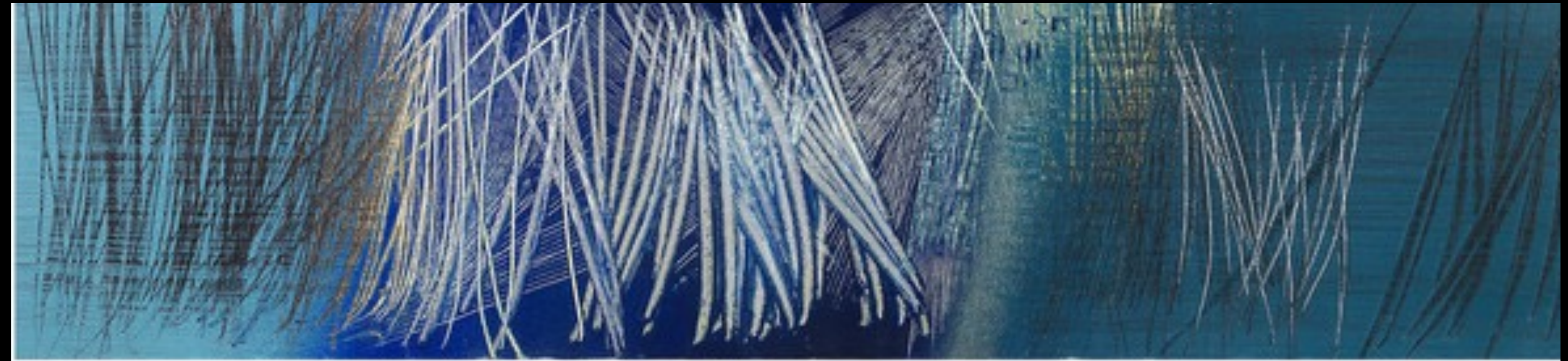
Hans Hartung T 1962 - L8, 1962