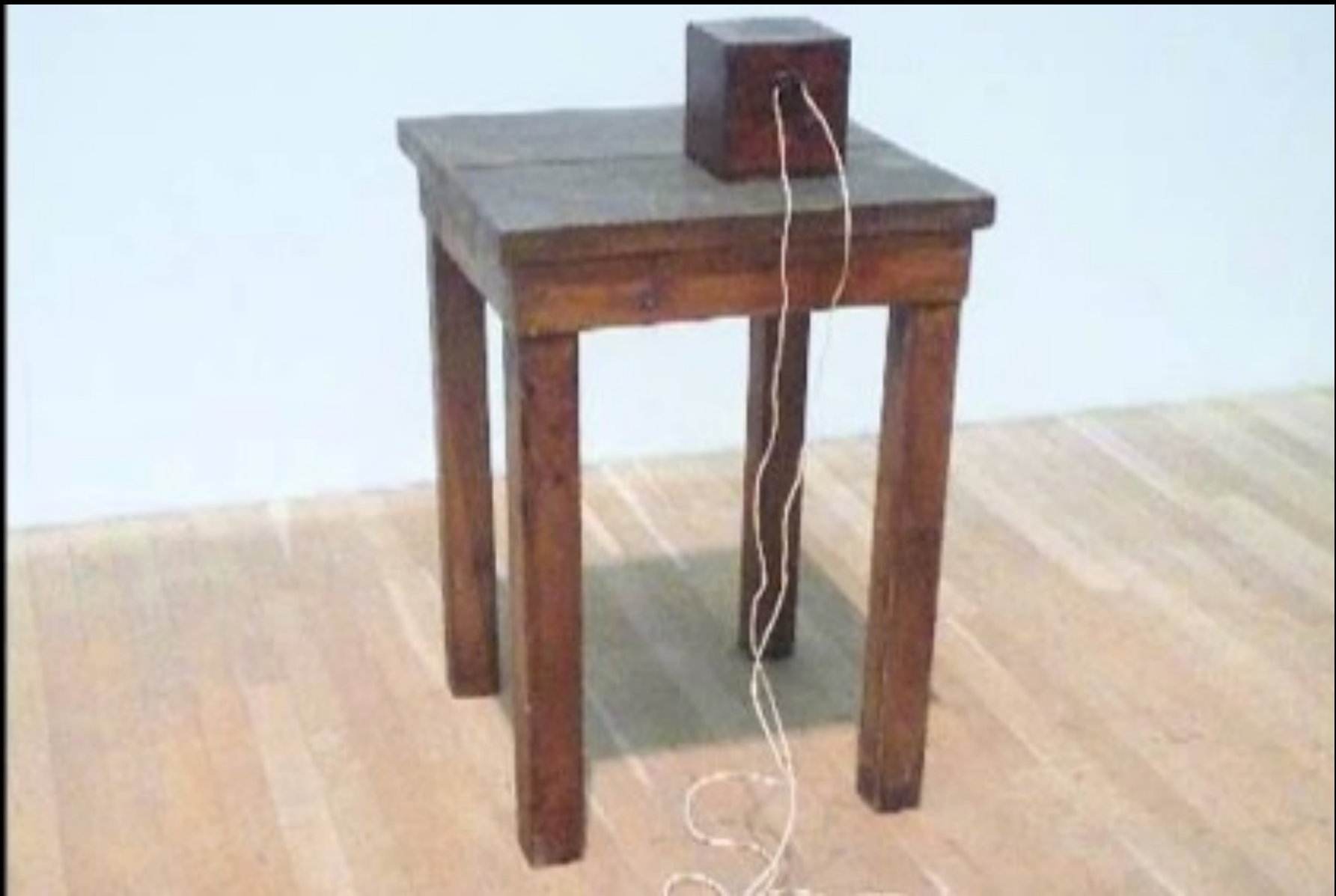
Joseph Beuys Table With Accumulator 1950