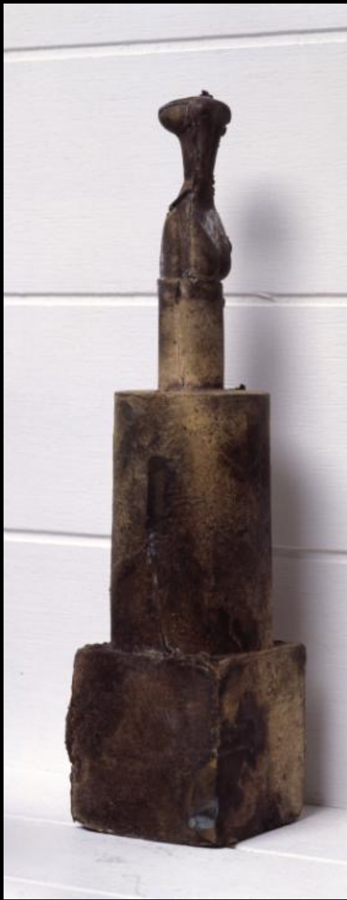
Joseph Beuys Animal Woman 1949