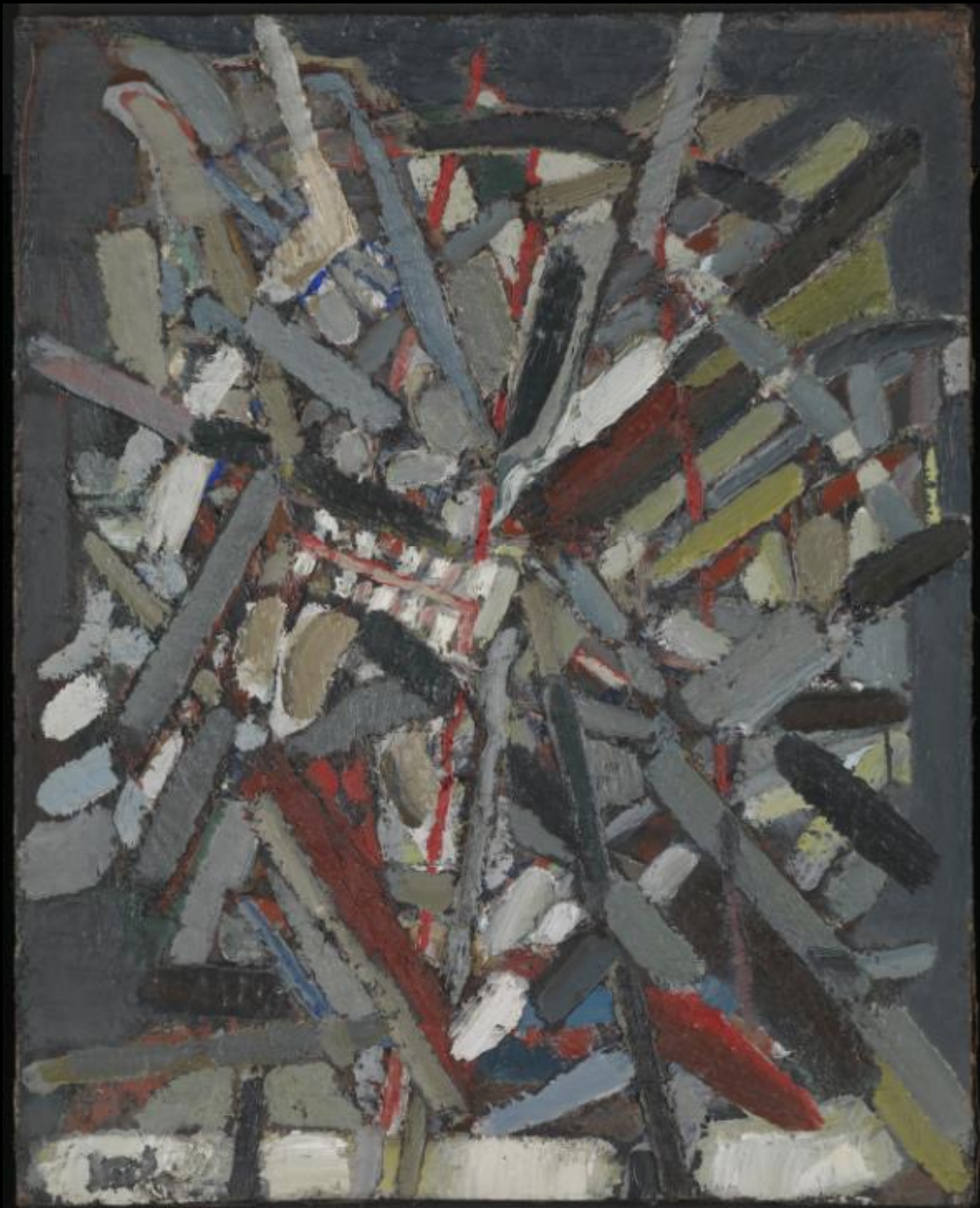
Nicolas de Stael Marathon 1948