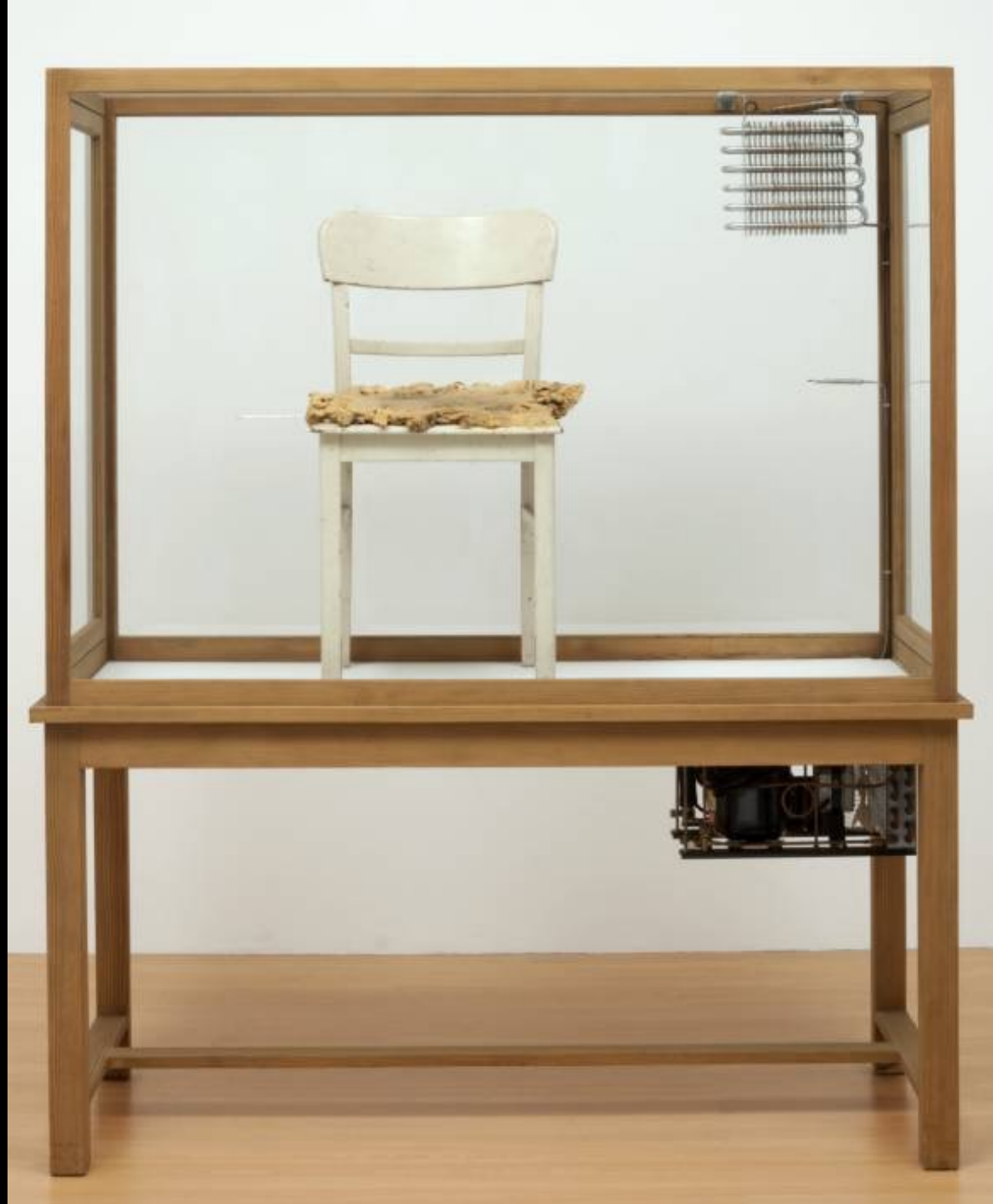
Joseph Beuys, Fat Chair 1960