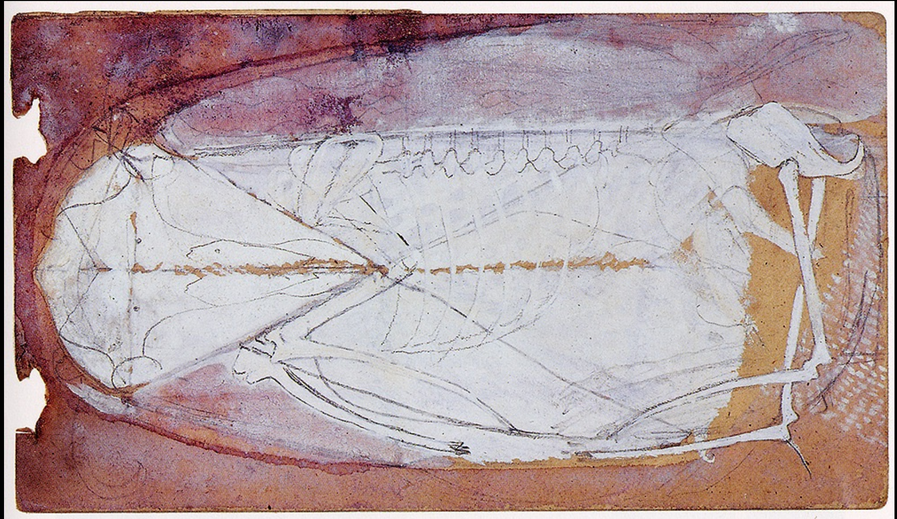
Joseph Beuys (Sheep Skeleton), 1949