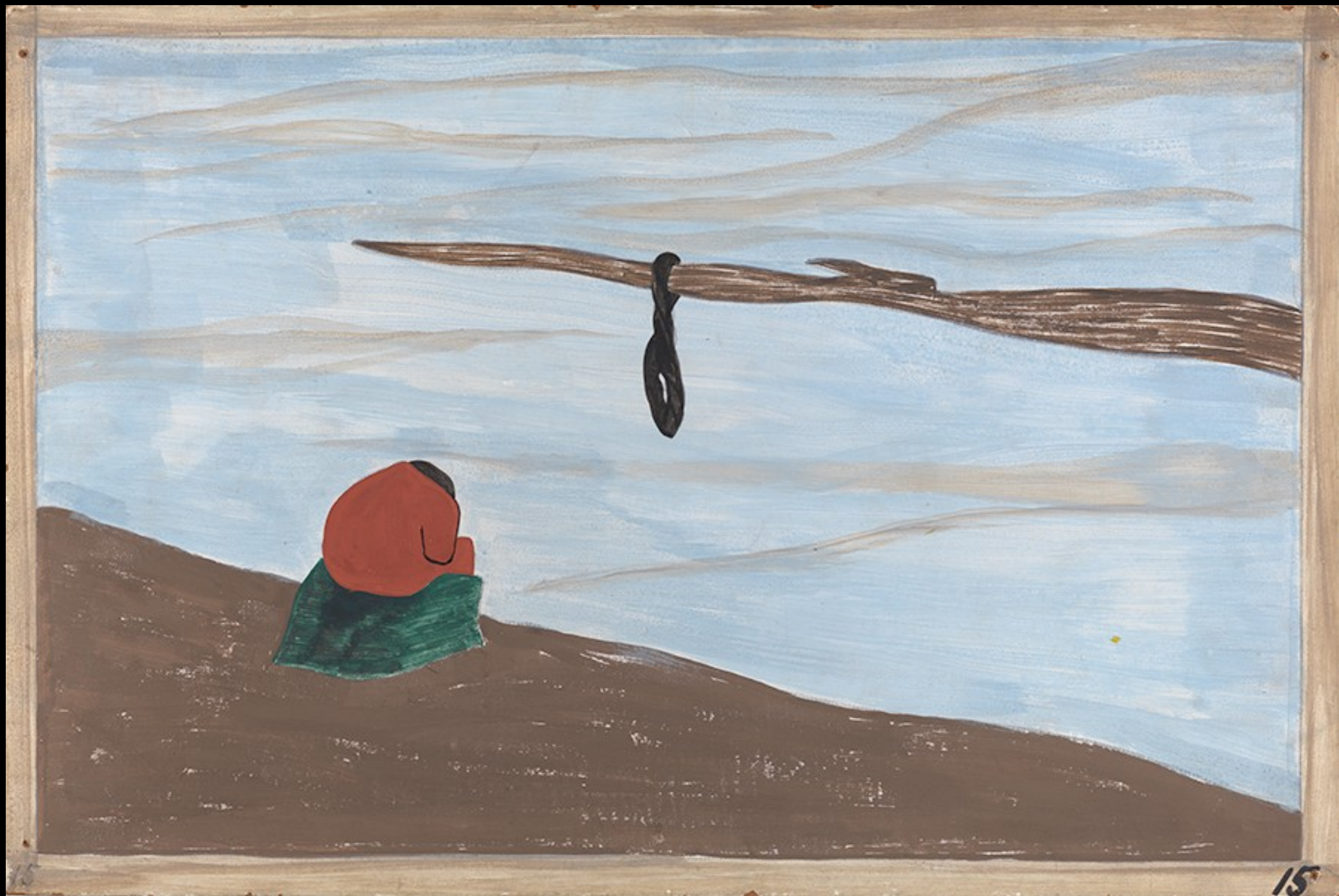
Jacob Lawrence The great Migration Series Panel 15