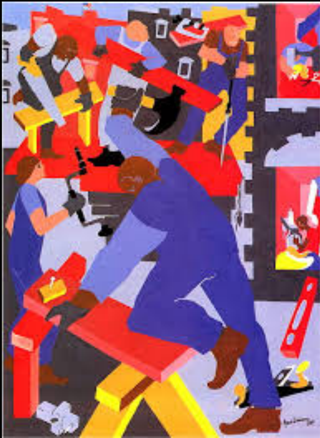
Jacob Lawrence The Builders 1980