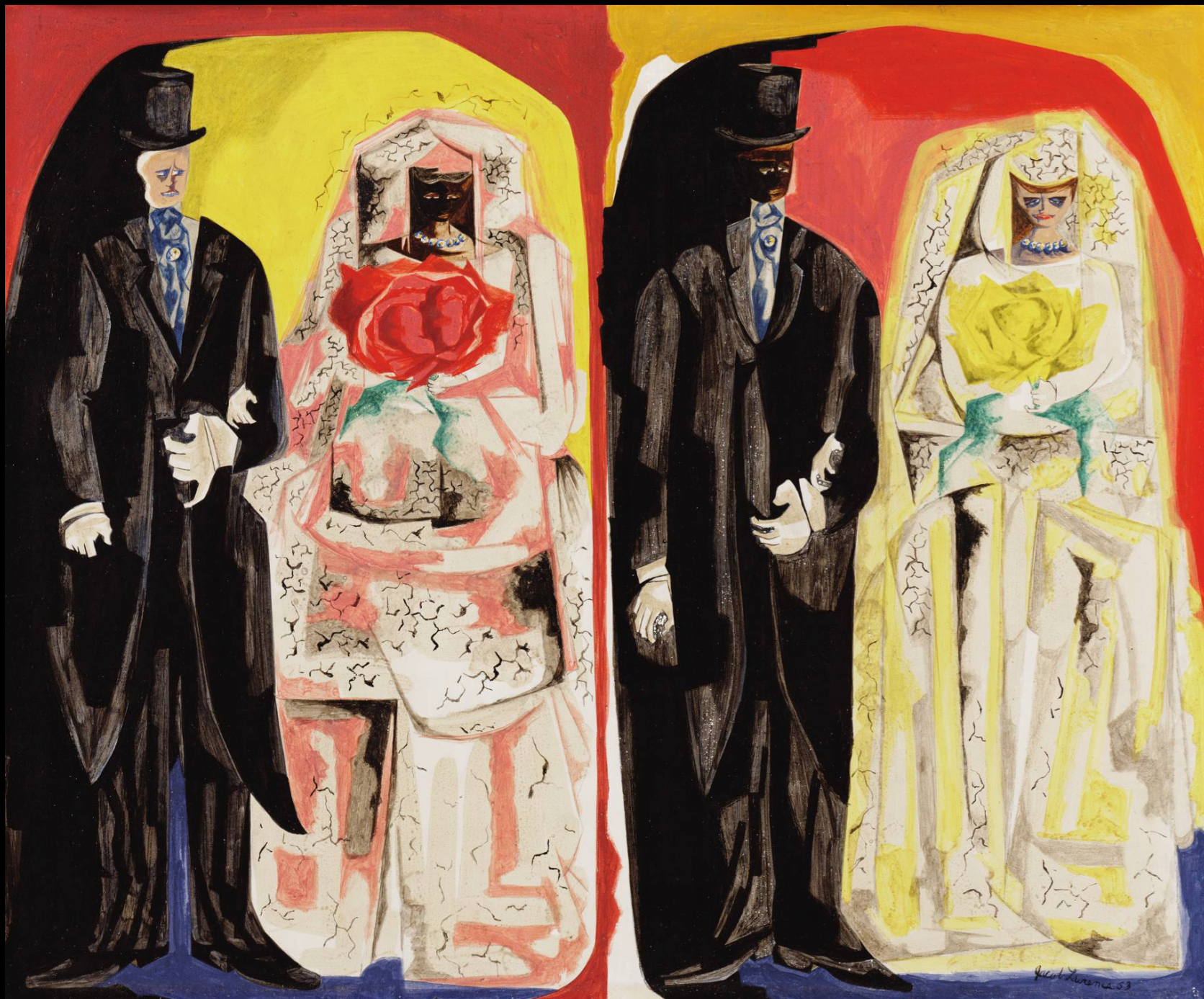
Jacob Lawrence, Taboo , 1963. Tempera on hardboard,