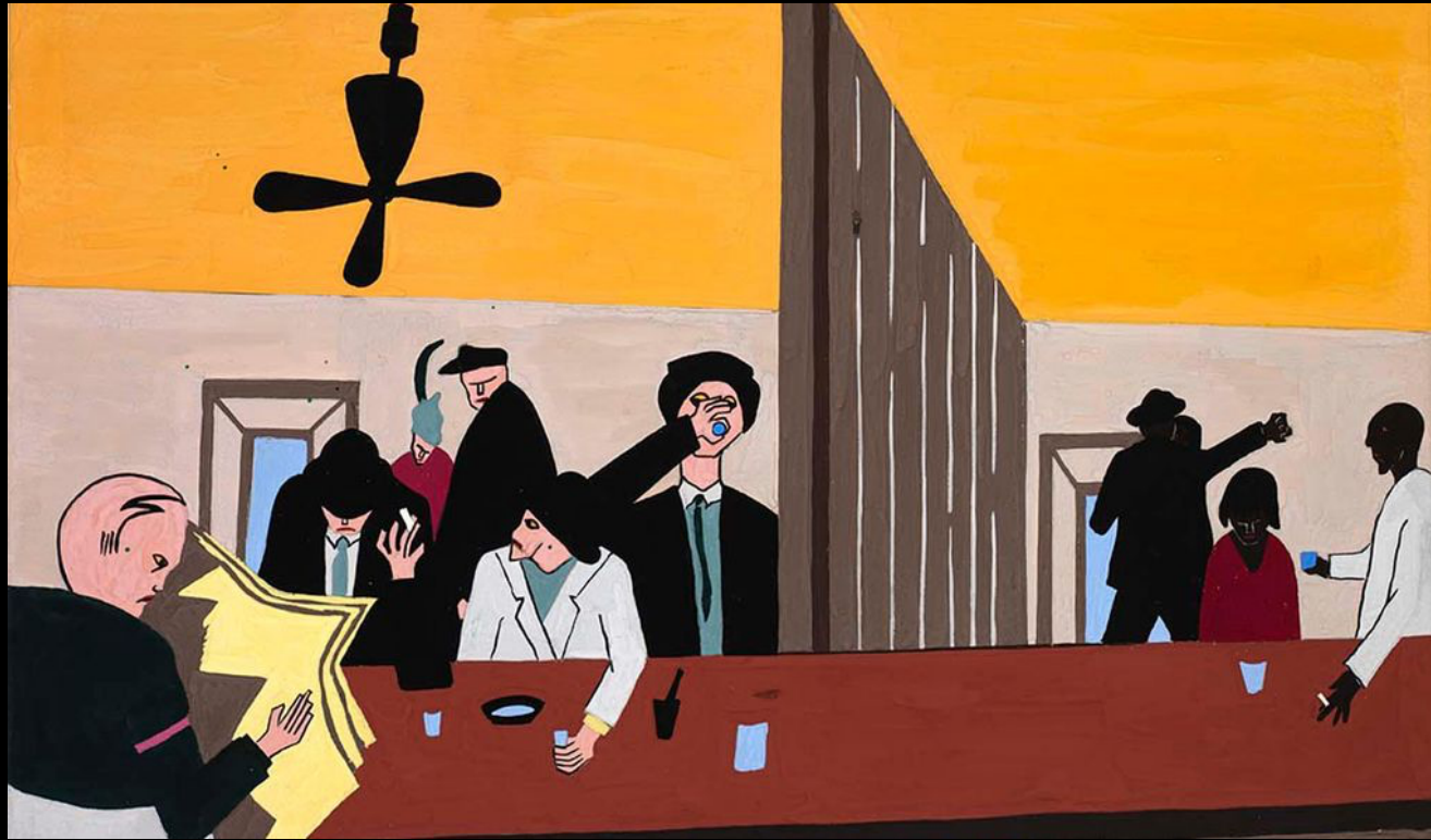
Jacob Lawrence This is Harlem Series Bar and Grill, 1941