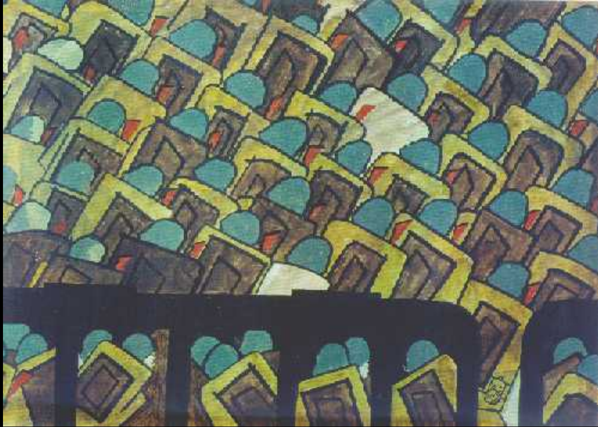
Jacob Lawrence Embarkation or possibly Landing Craft, gouache and watercolor on board 1944