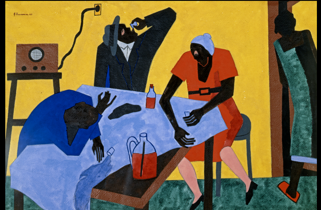
Jacob Lawrence You Can Buy Bootleg Whiskey for Twenty-Five Cents a Quart 1943