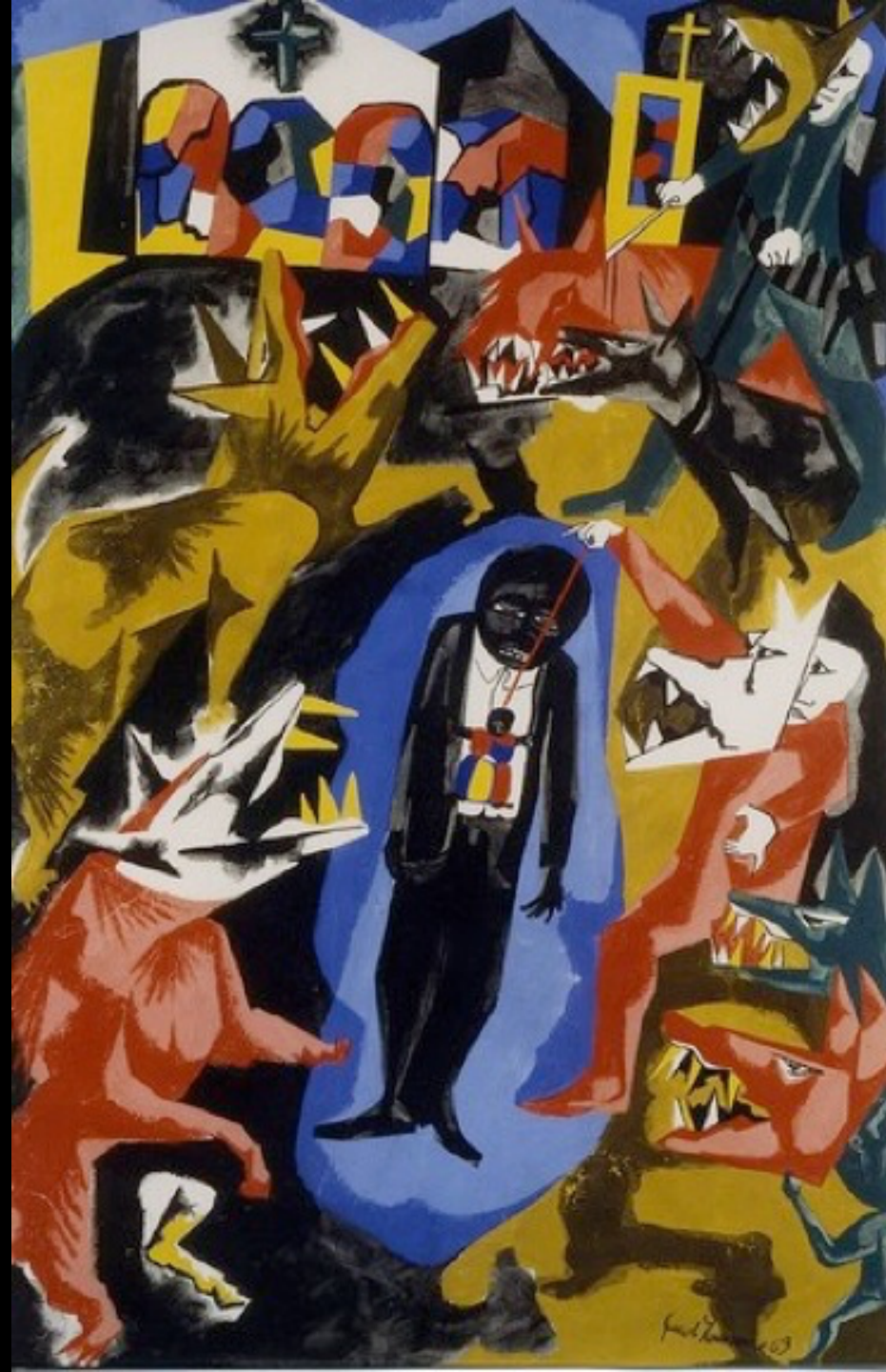
Jacob Lawrence American Revolution 1963