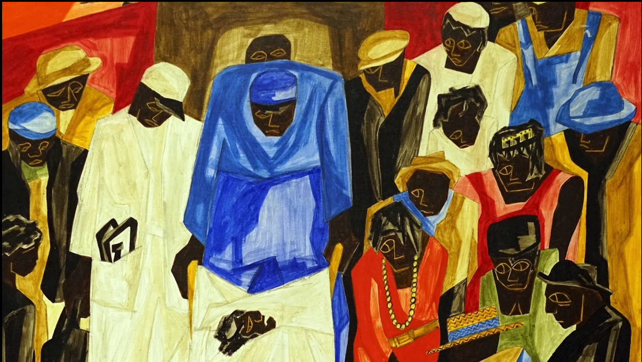
Jacob Lawrence The Ambulance Driver 1948