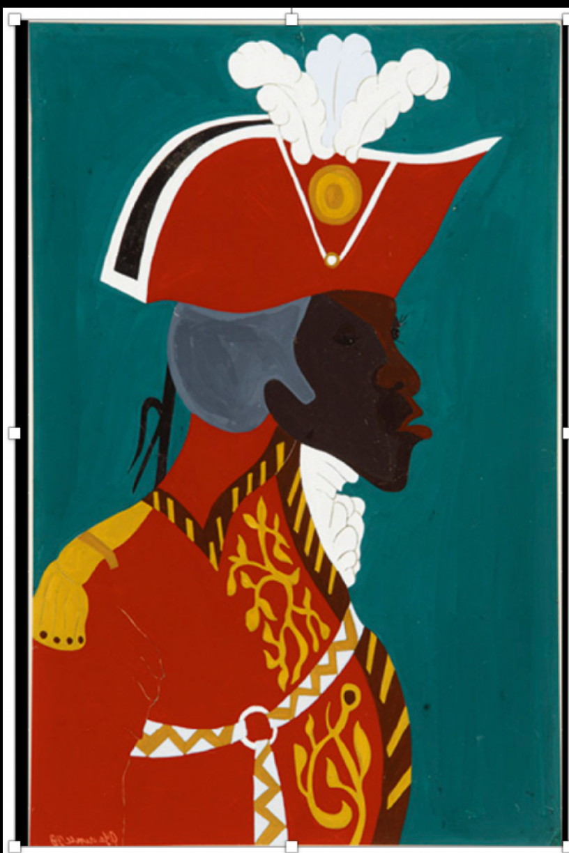
Figure 1 Jacob Lawrence, General Toussaint L'Ouverture from the series The Life of Toussaint L'Ouverture , 1937-1938, gouache on paper, The Jacob and Gwendolyn Lawrence