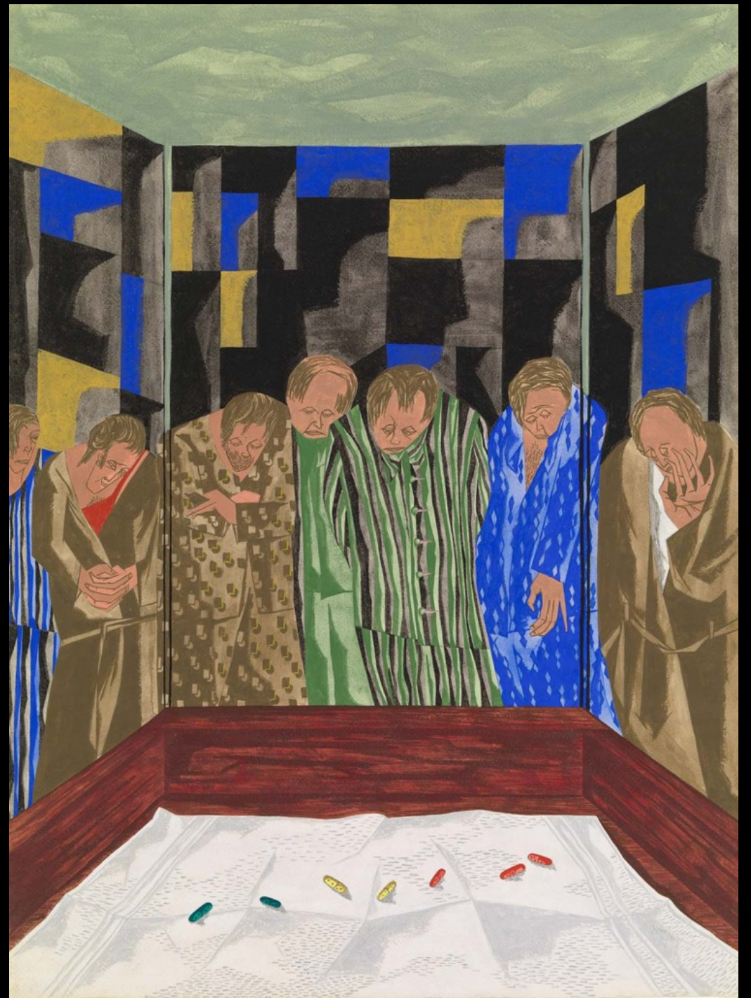
Jacob Lawrence. Sedation . 1950. Gouache on paper,