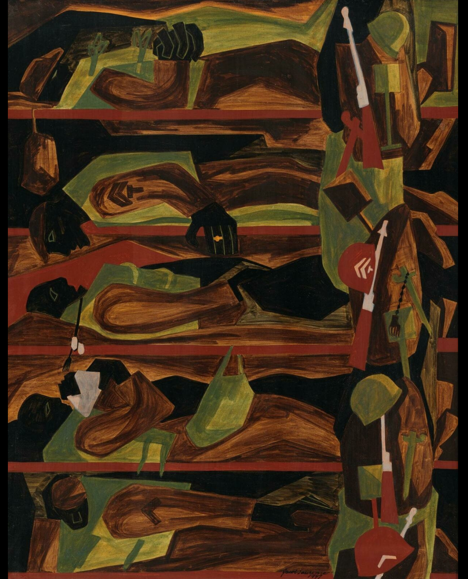
Jacob Lawrence Shipping Out to Victory 1947