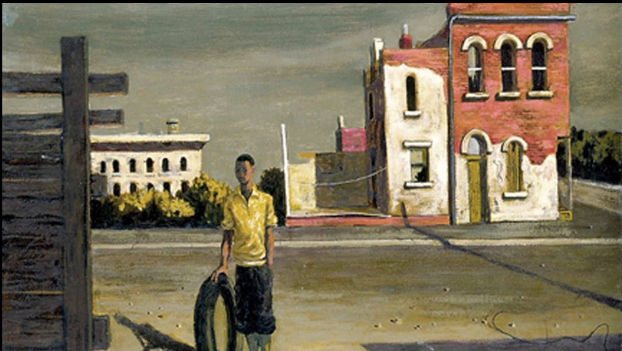
Hughie Lee- Smith Boy With Tire 1952