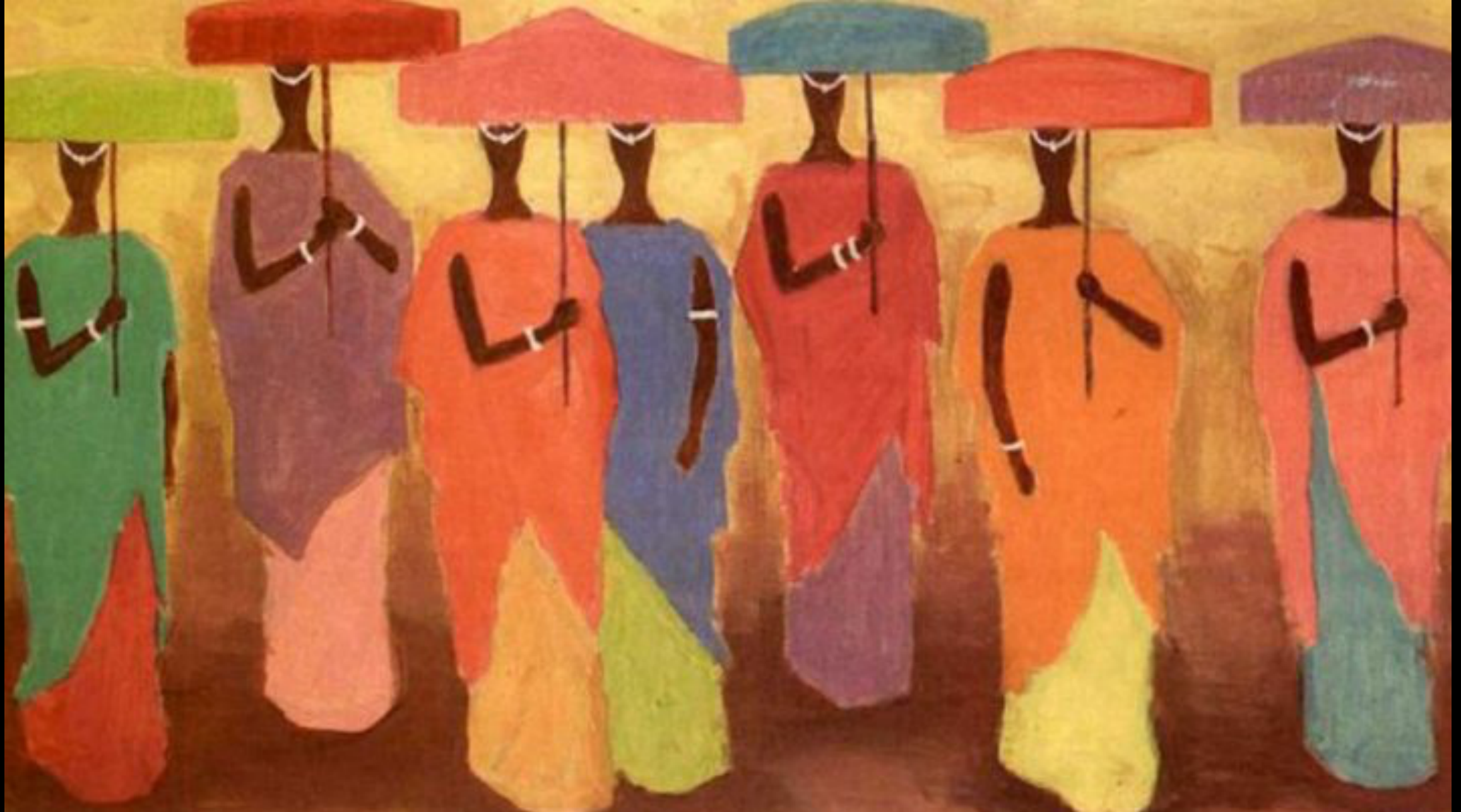
Ellis Wilson Haitian Umbrellas 1950