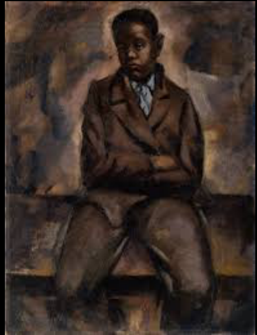
Hughie Lee-Smith Portrait of Boy 1937