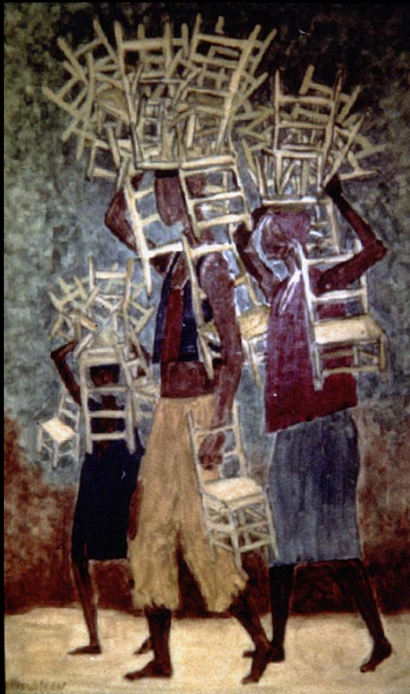
Ellis Wilson Chair Vendors Haiti 1965