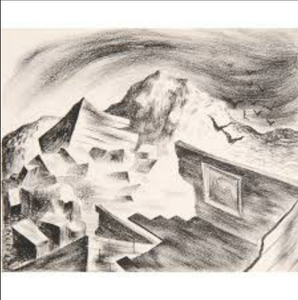
Hughie Lee-Smith Aftermath 1939