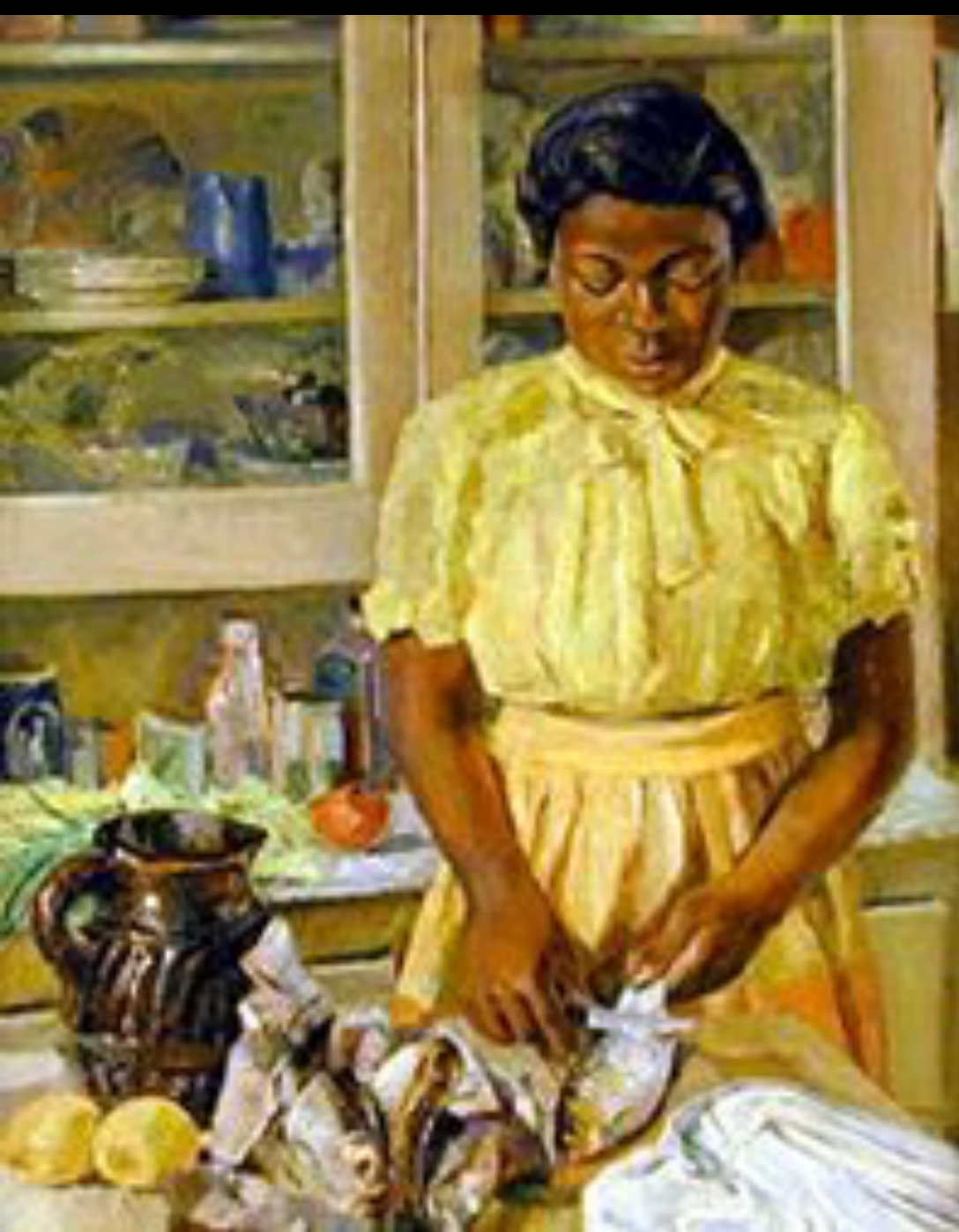
Lois Mailou Jones Jennie, 1943 Oil on canvas