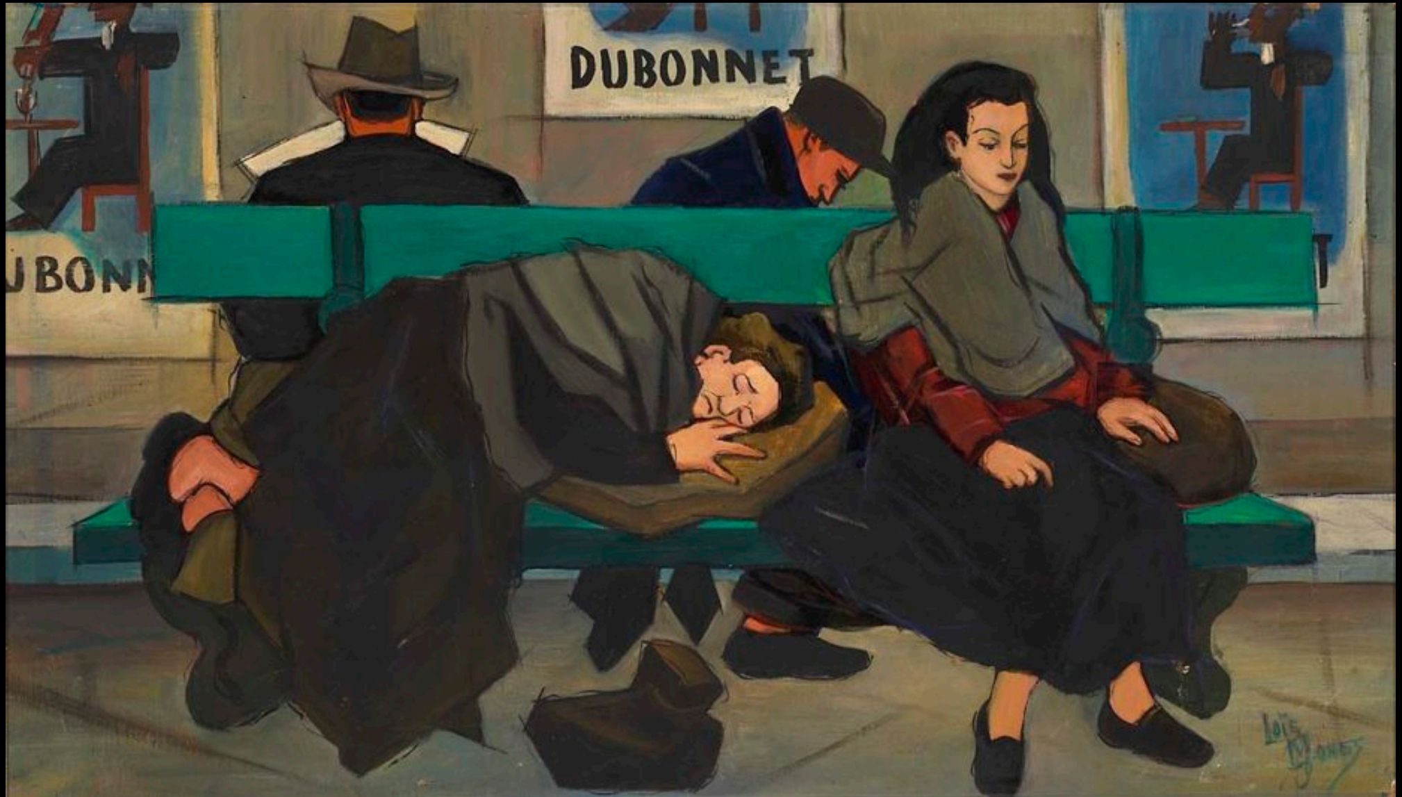
Parisian Beggar Woman. 1947, Lois Mailou Jones