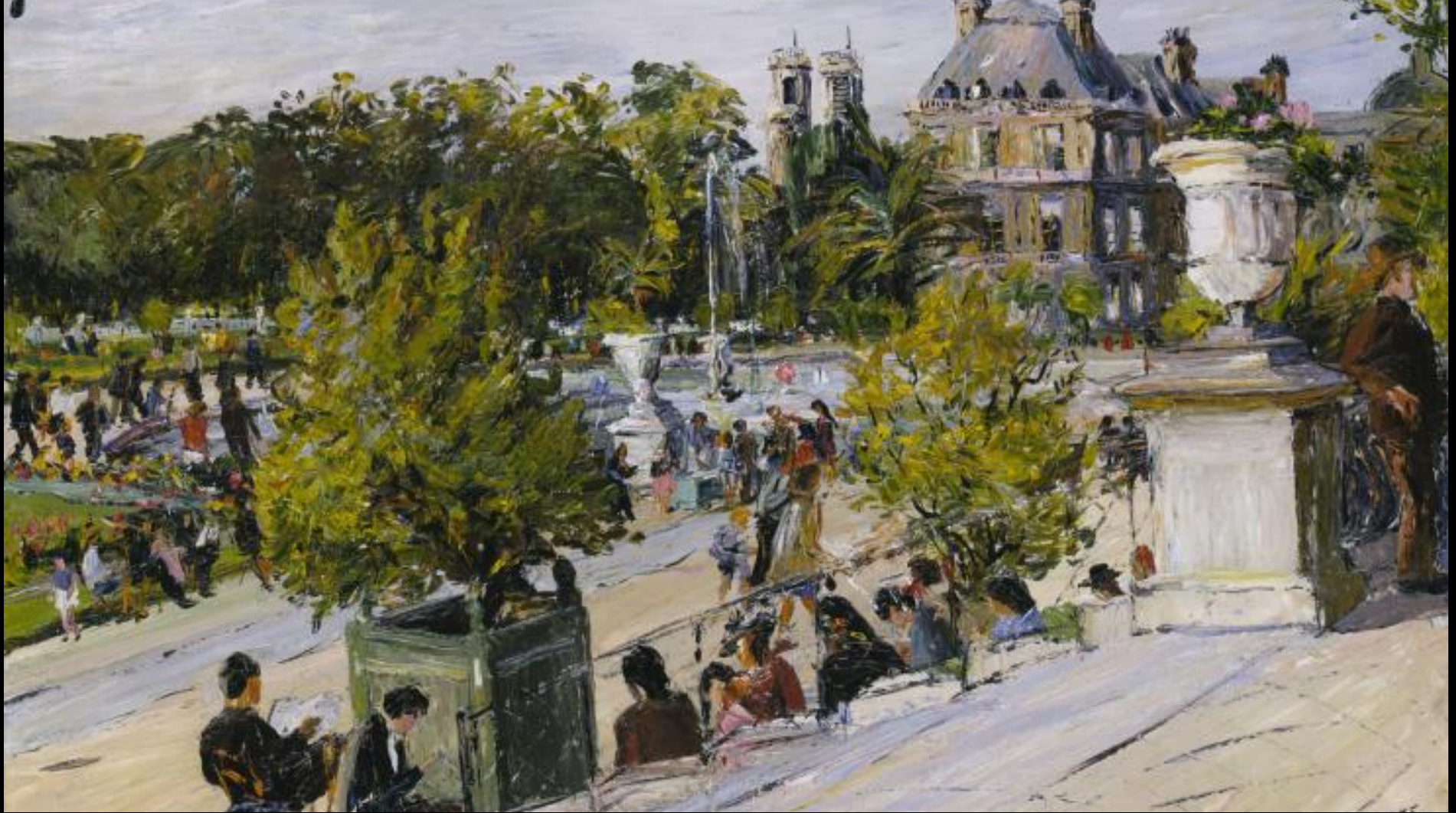
Loïs Mailou Jones, Jardin du Luxembourg , ca. 1948, oil on canvas