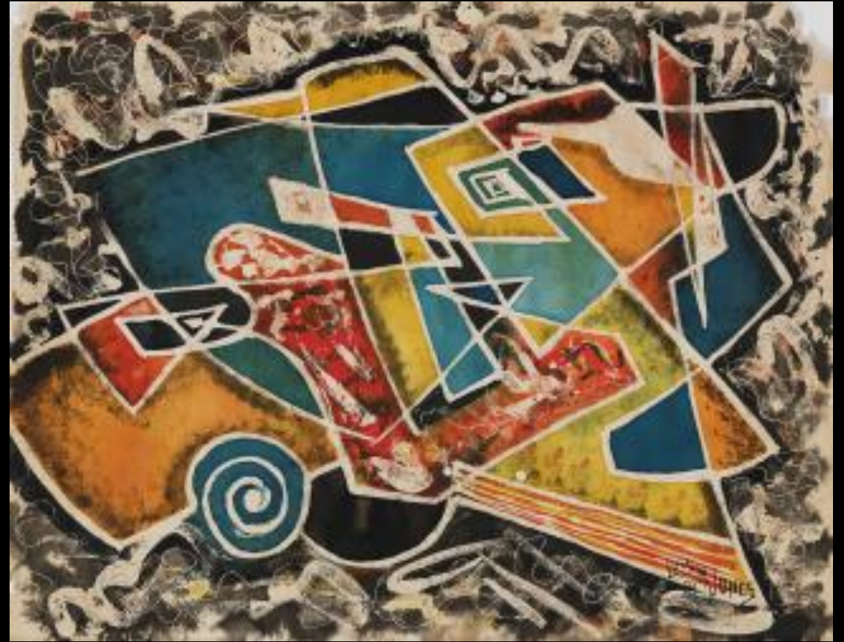
Lois Mailou Jones, Shapes and Colors , 1958, watercolor on paper,