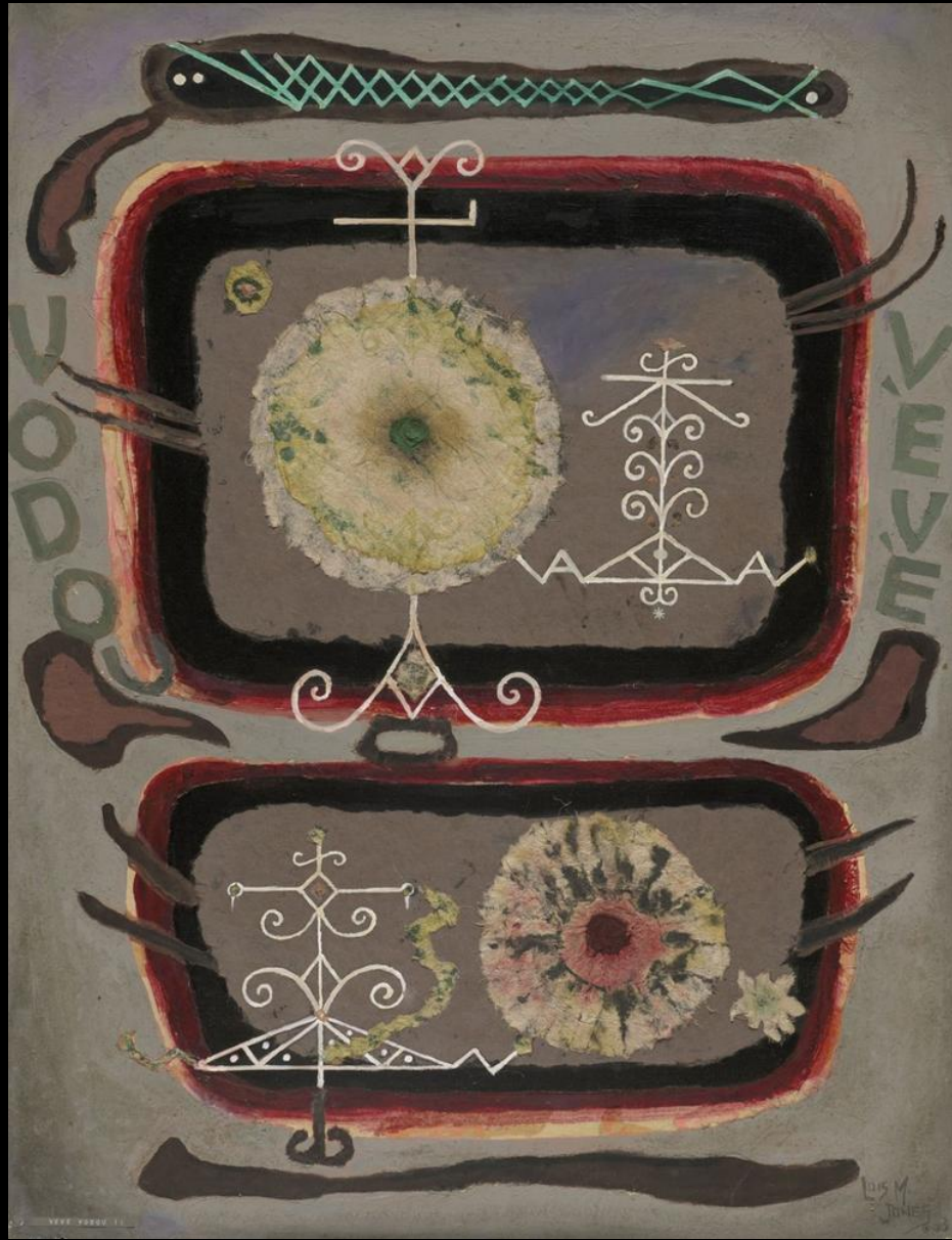
Lois Mailou Jones "Veve Voudou II," 1963, oil and collage on canvas