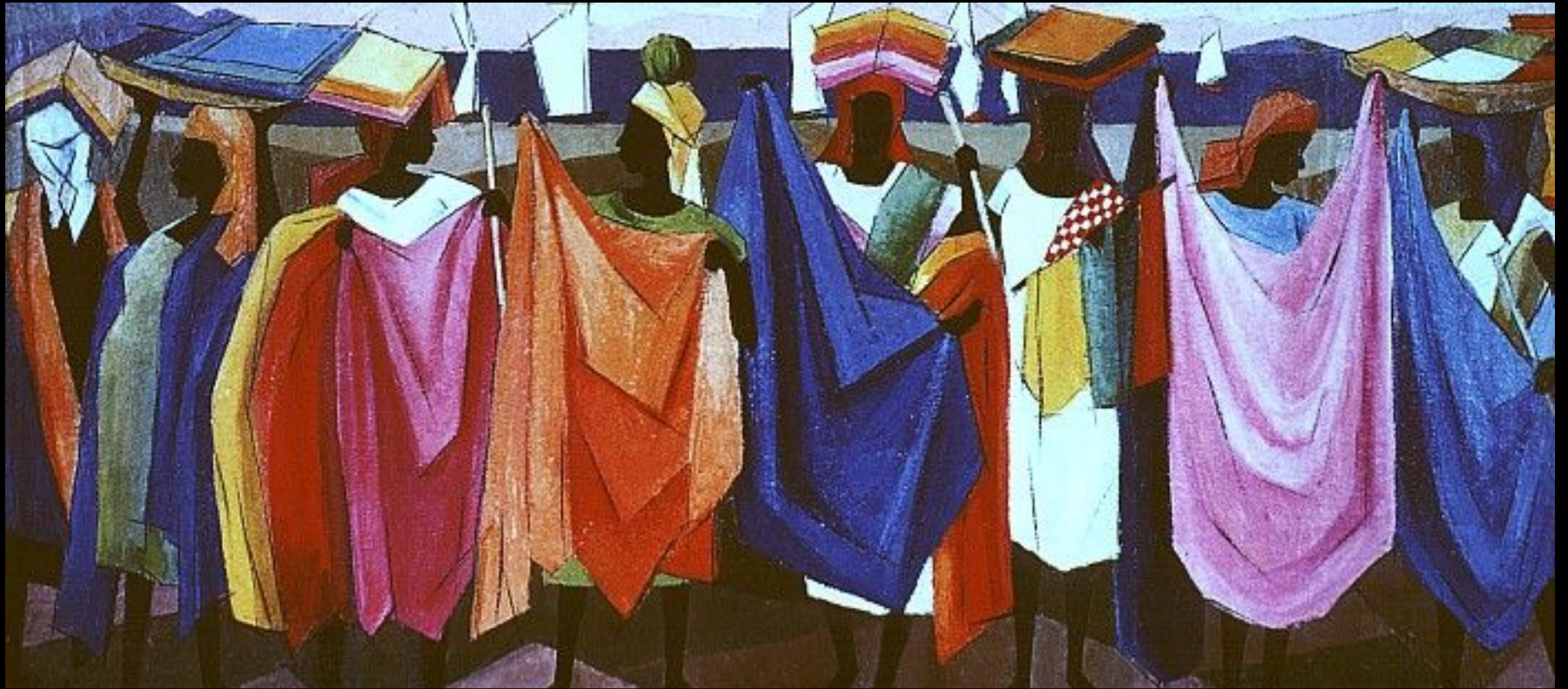
Les Vendeuses de Tissus by Lois Mailou Jones