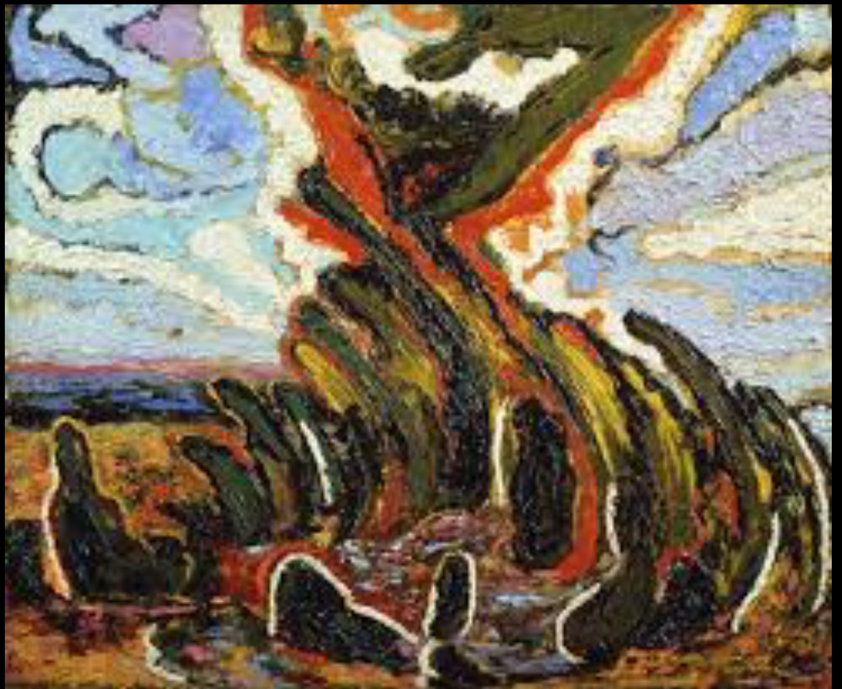
Beaufort Delaney The Burning Bush 1941