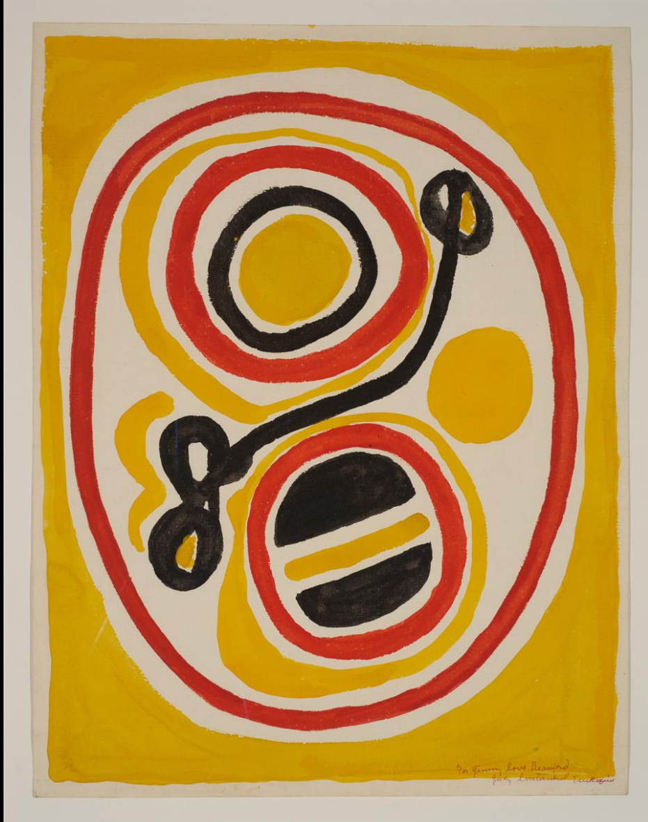
Beauford Delaney Untitled (Yellow, Red, and Black Circles for James