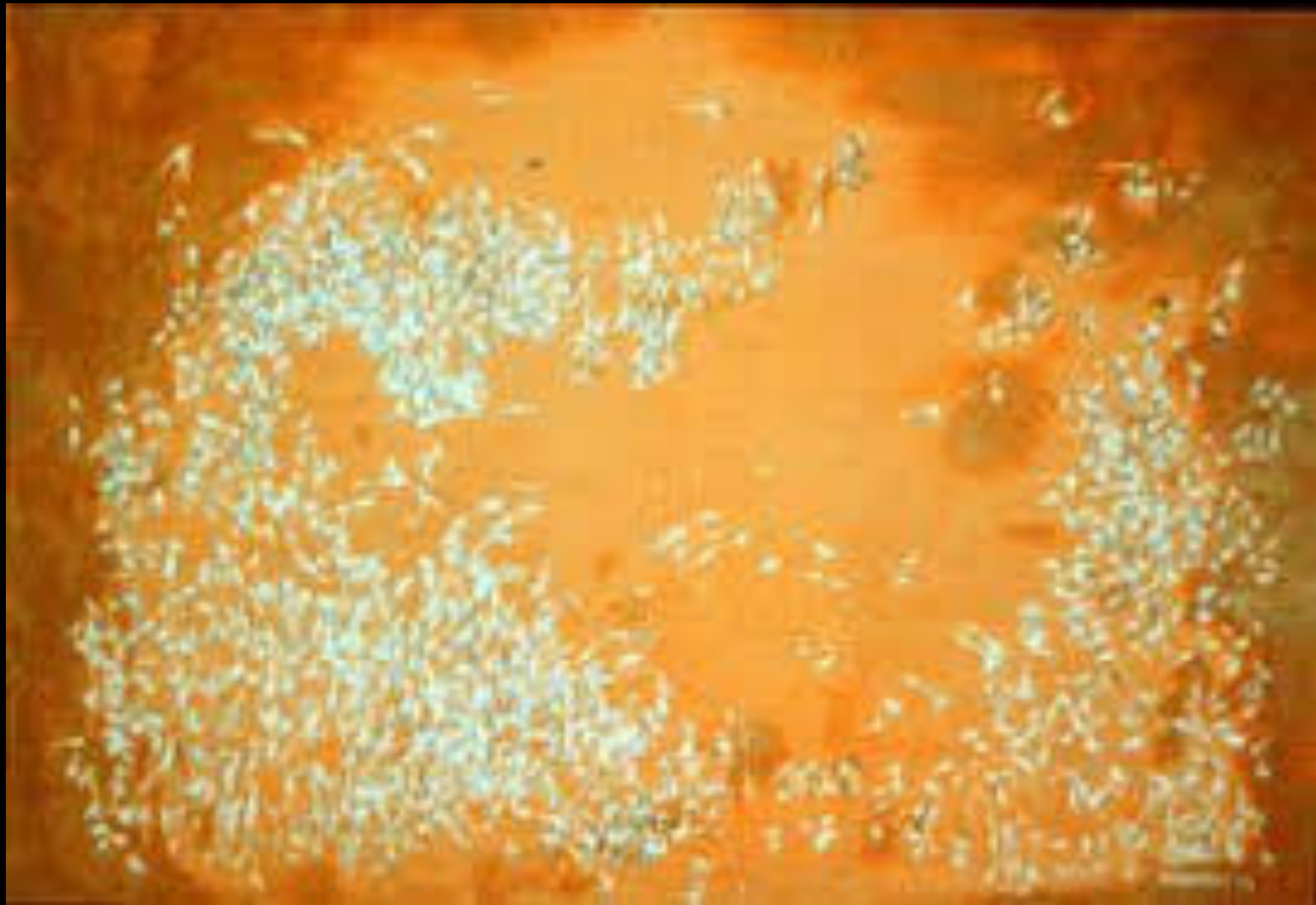
Norman Lewis Migrating Birds 1953