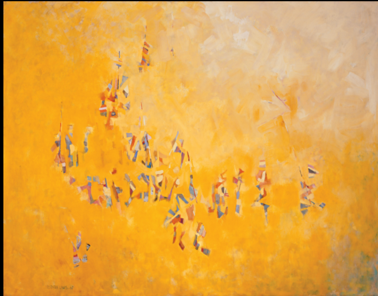
Norman Lewis Carnivale del Sol, 1962