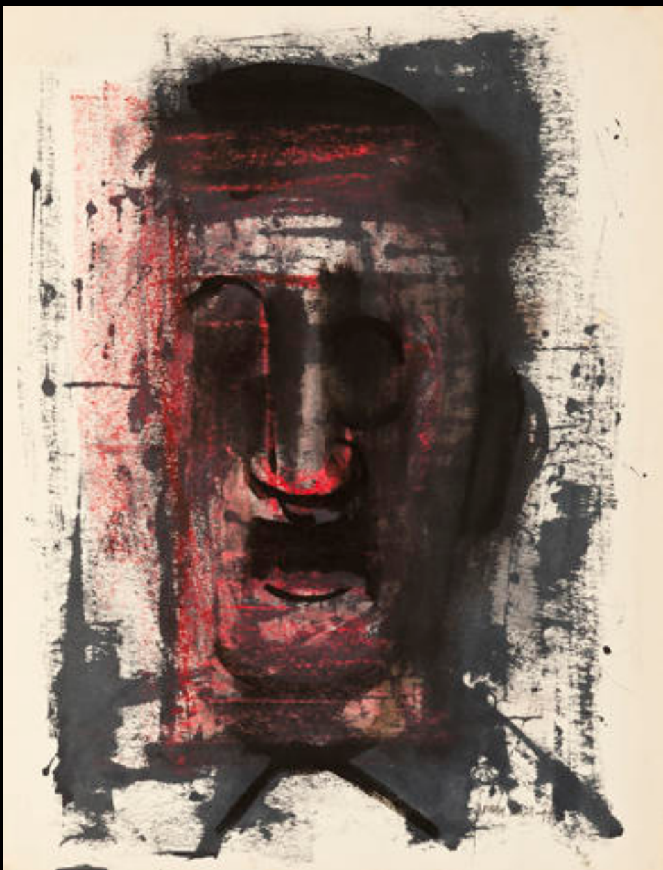
Norman Lewis Self Portrait 1949