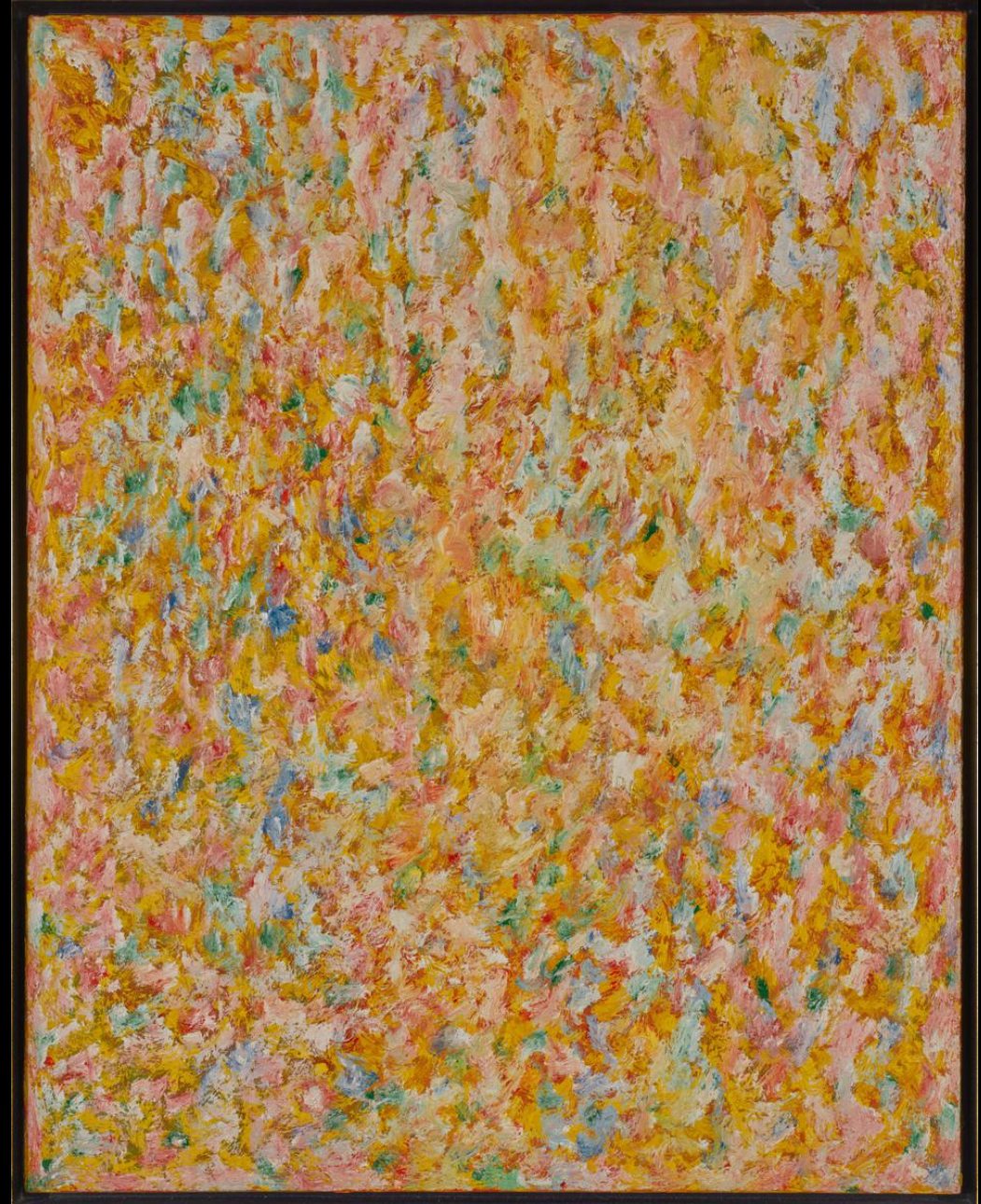
Beauford Delaney 'Scattered Light,' 1964.