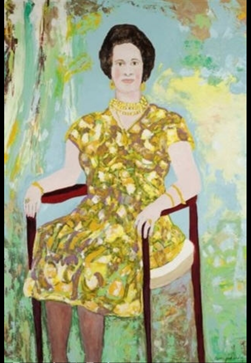
Beaufort Delaney Portrait of Vasilli Pikoula, 1970