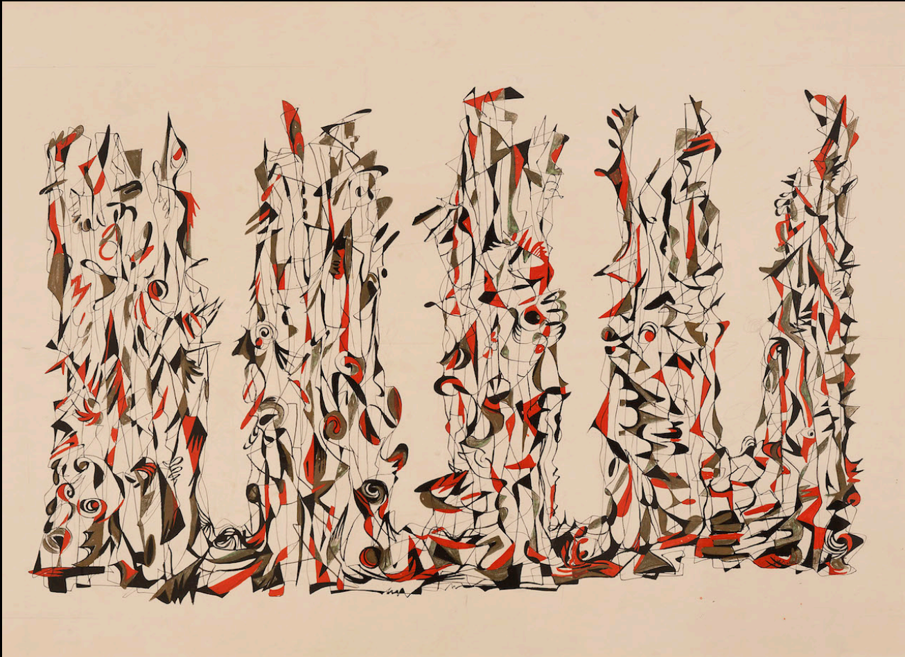
Norman Lewis, "Too Much Aspiration" (1947), opaque watercolor, ink, and graphite on paper,