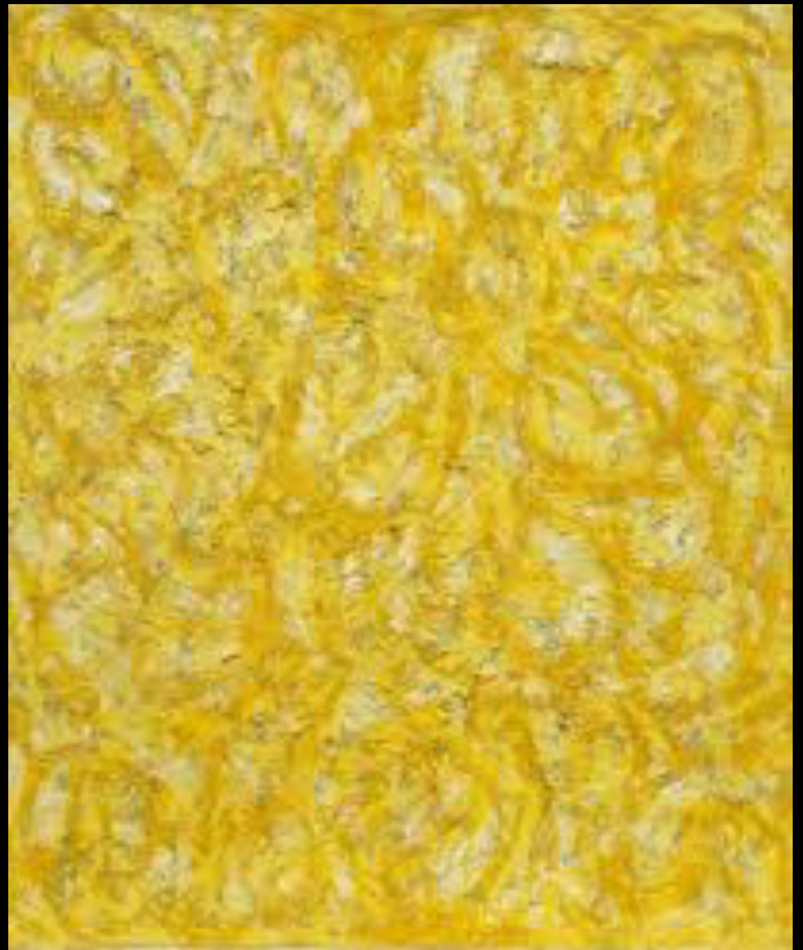
Beauford Delaney Untitled 1958