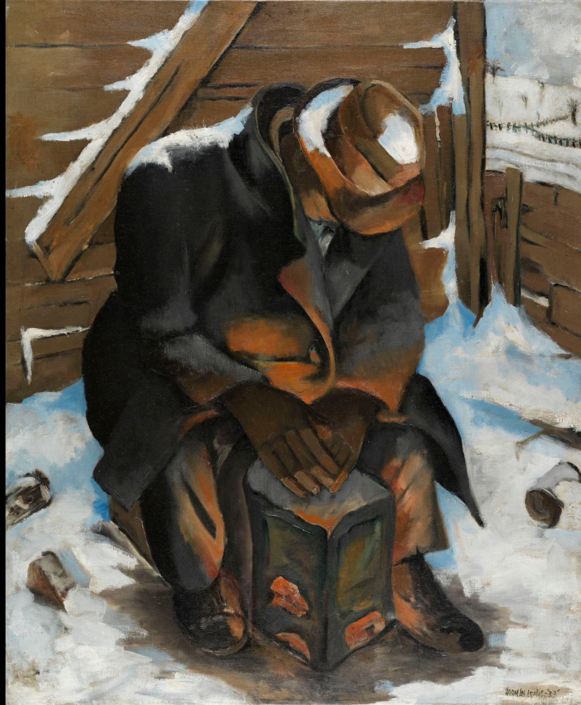
Norman Lewis "The Wanderer (Johnny)" (1933), oil on canvas, 36 x 30 inches