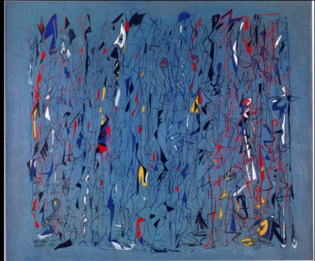
Norman Lewis, Twilight Sounds , 1946.