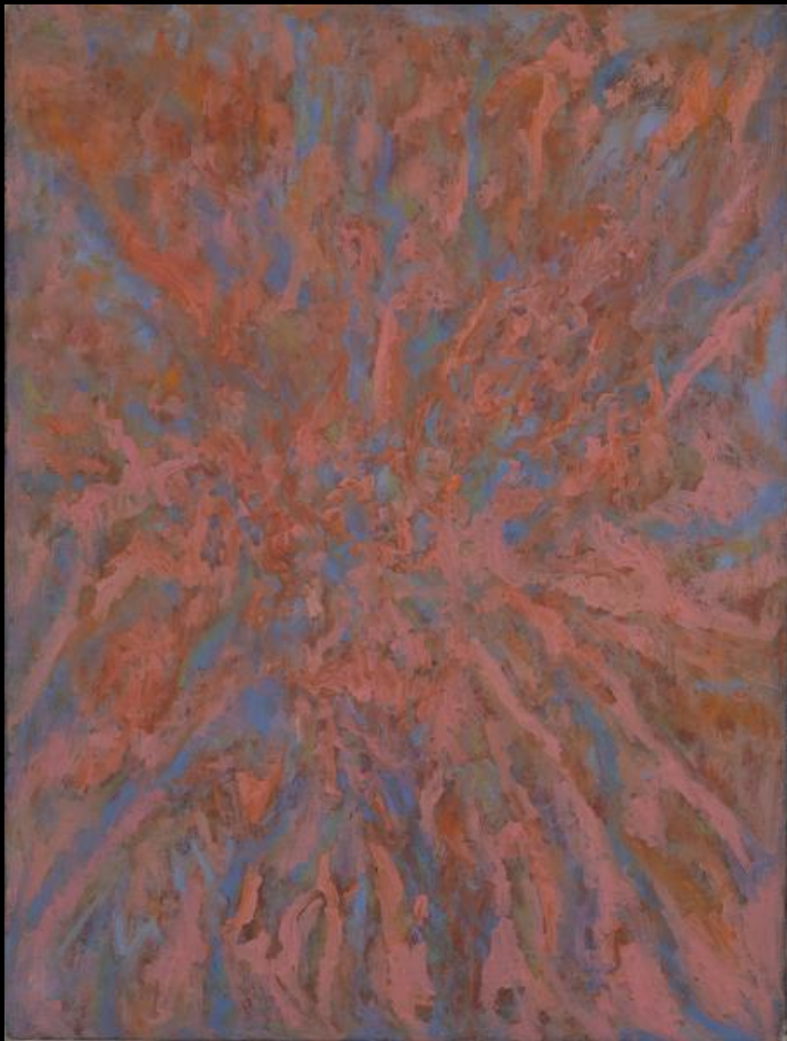
Beauford Delaney Charlie Parker Yardbird , 1958, oil on canvas,