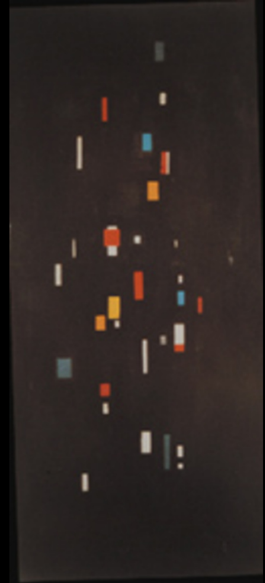
Norman Lewis The Tenement 1948