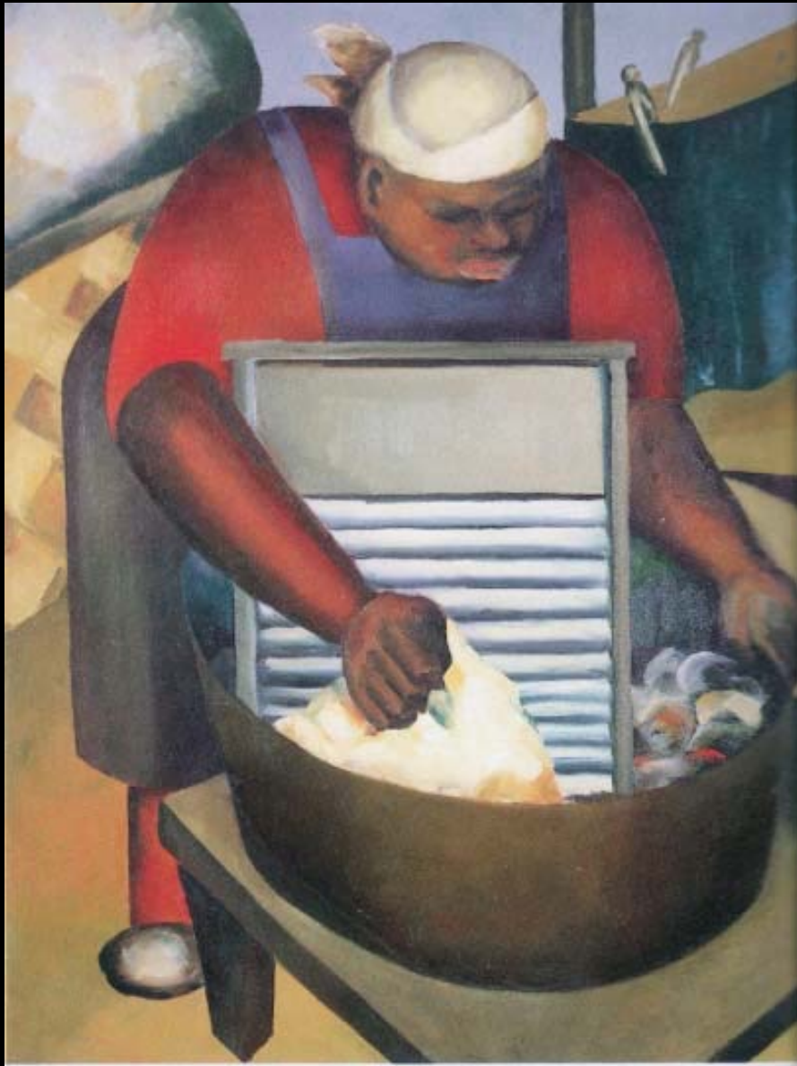
Norman Lewis, Washerwoman , 1936. Oil on canvas,