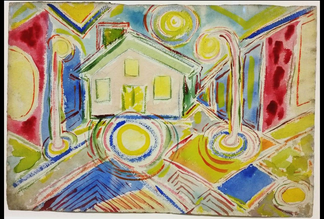
BEAUFORD DELANEY, "Untitled (New York City)," circa 1945 (watercolor on paper,