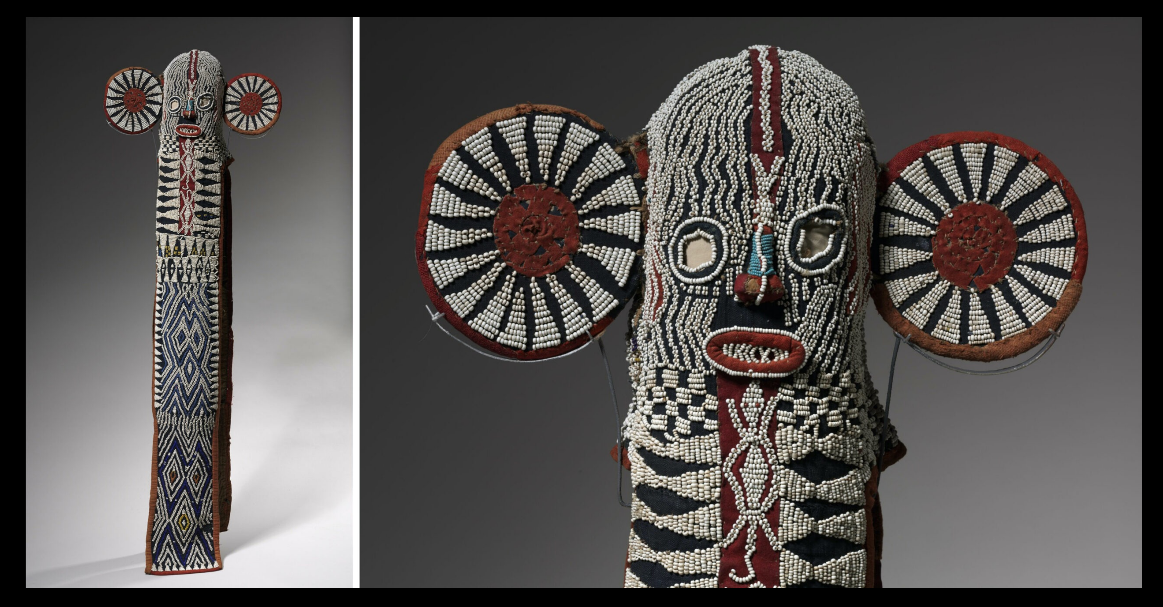
Full mask; right: face of mask (detail). Mask (mbap mteng), early 1900s (Bamileke peoples), cotton, burlap, glass beads, twine, leather, and wood,