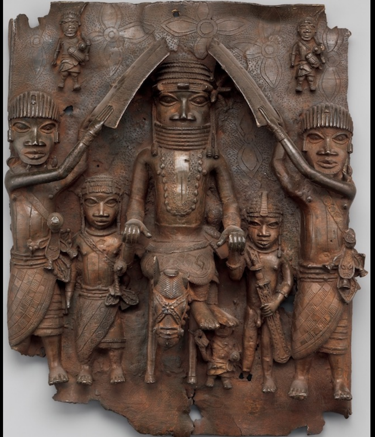
Equestrian Oba and Attendants, 1550-1680, Nigeria, Court of Benin, Edo peoples, brass, 49.5 x 41.9 x 11.4 cm (