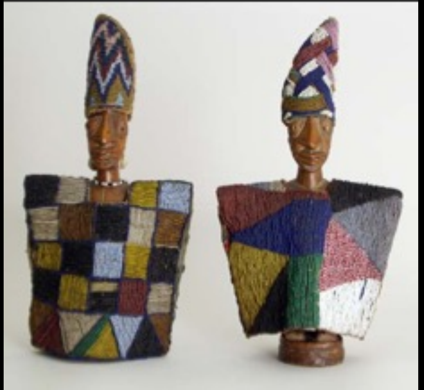
Beaded Ibeji (twins)