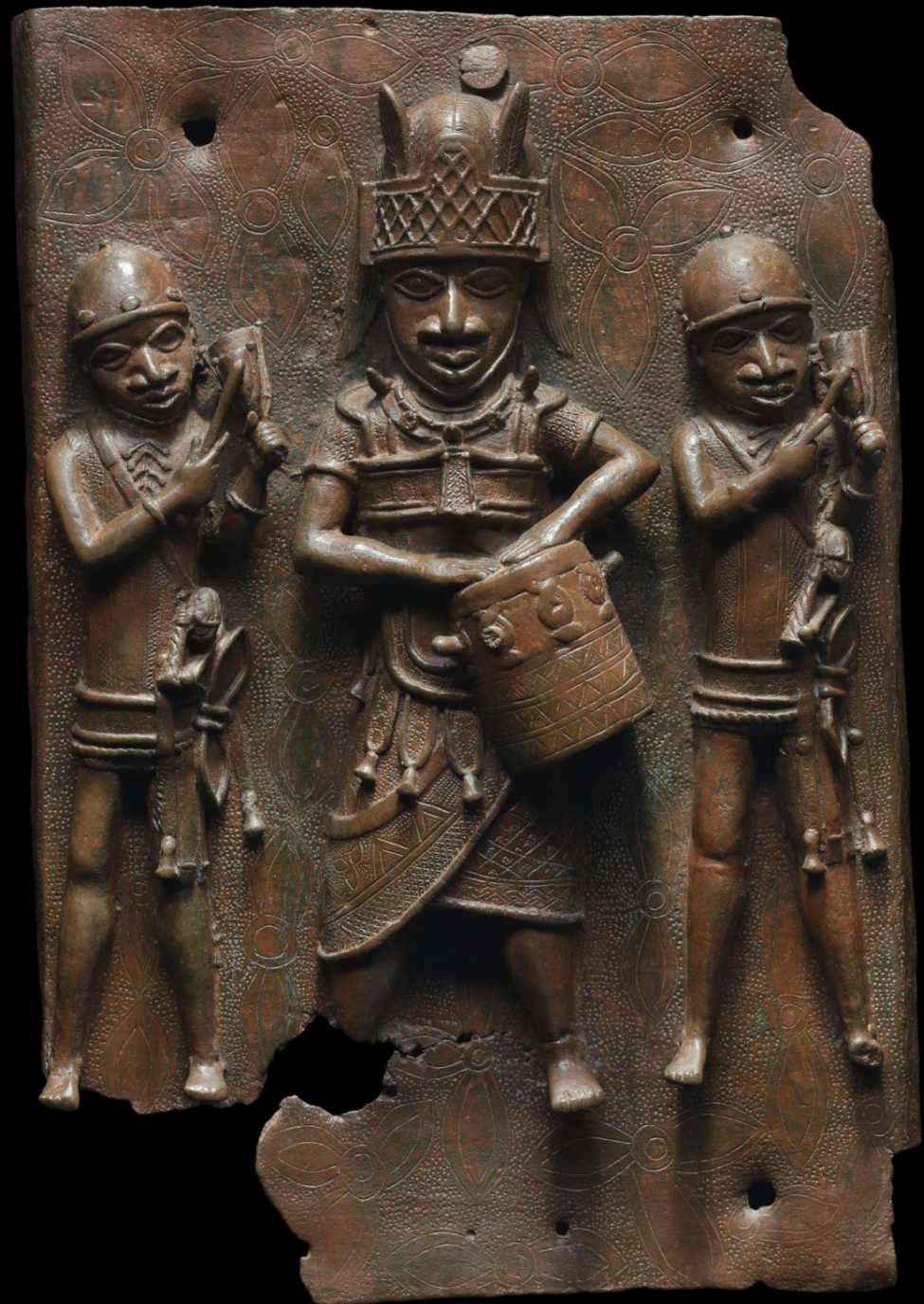
Artist Unidentified, Relief plaque showing a dignitary with drum and two attendants striking gongs , c. 1530-1570, copper alloy