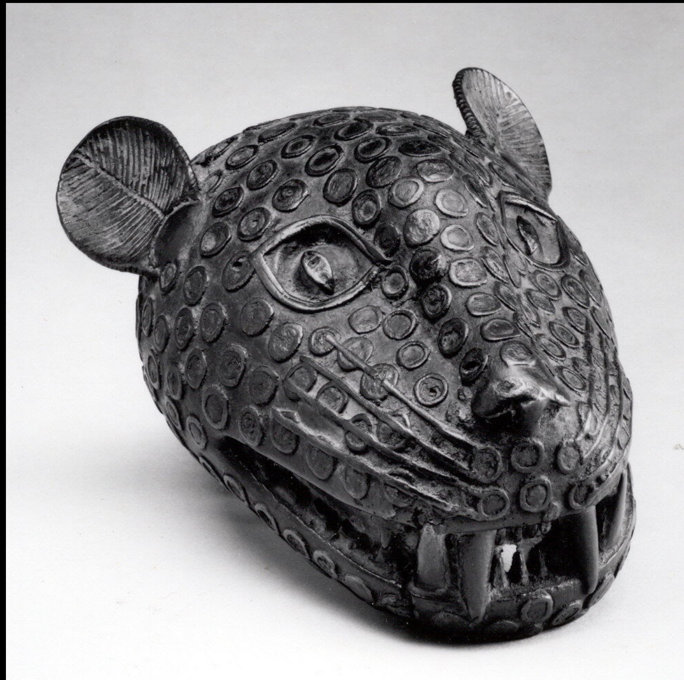
Figure: Leopard Head Edo peoples 16th–19th century