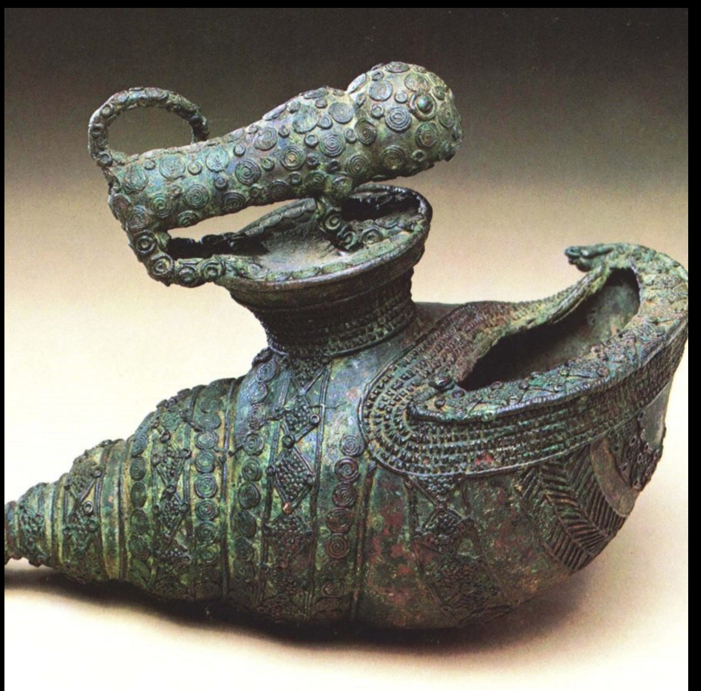
Shell Vessel with Leopard from Igbo-Ukwu, Nigeria, c. 9th–11th century C.E.