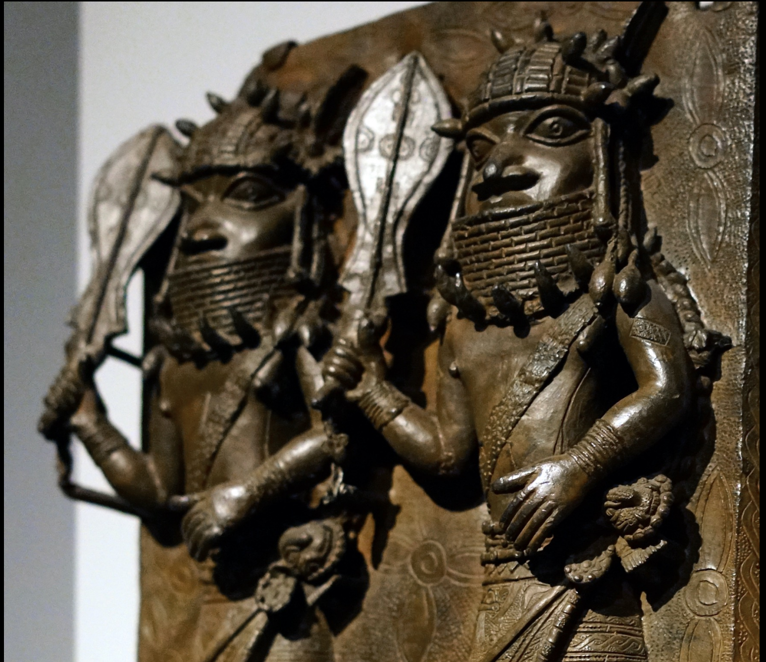
Detail of relief plaque showing two officials with raised swords, showing the high relief of the bodies and fully-free swords