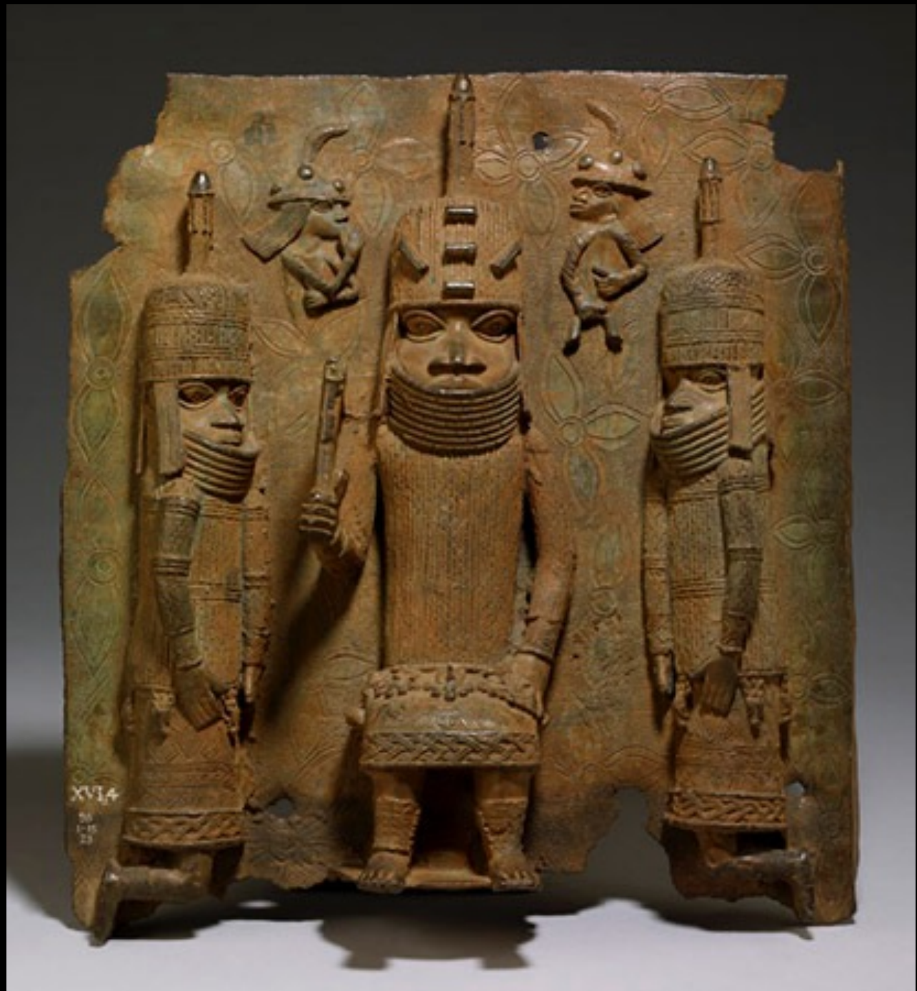
Benin Plaque: the Oba with Europeans, 16th century,