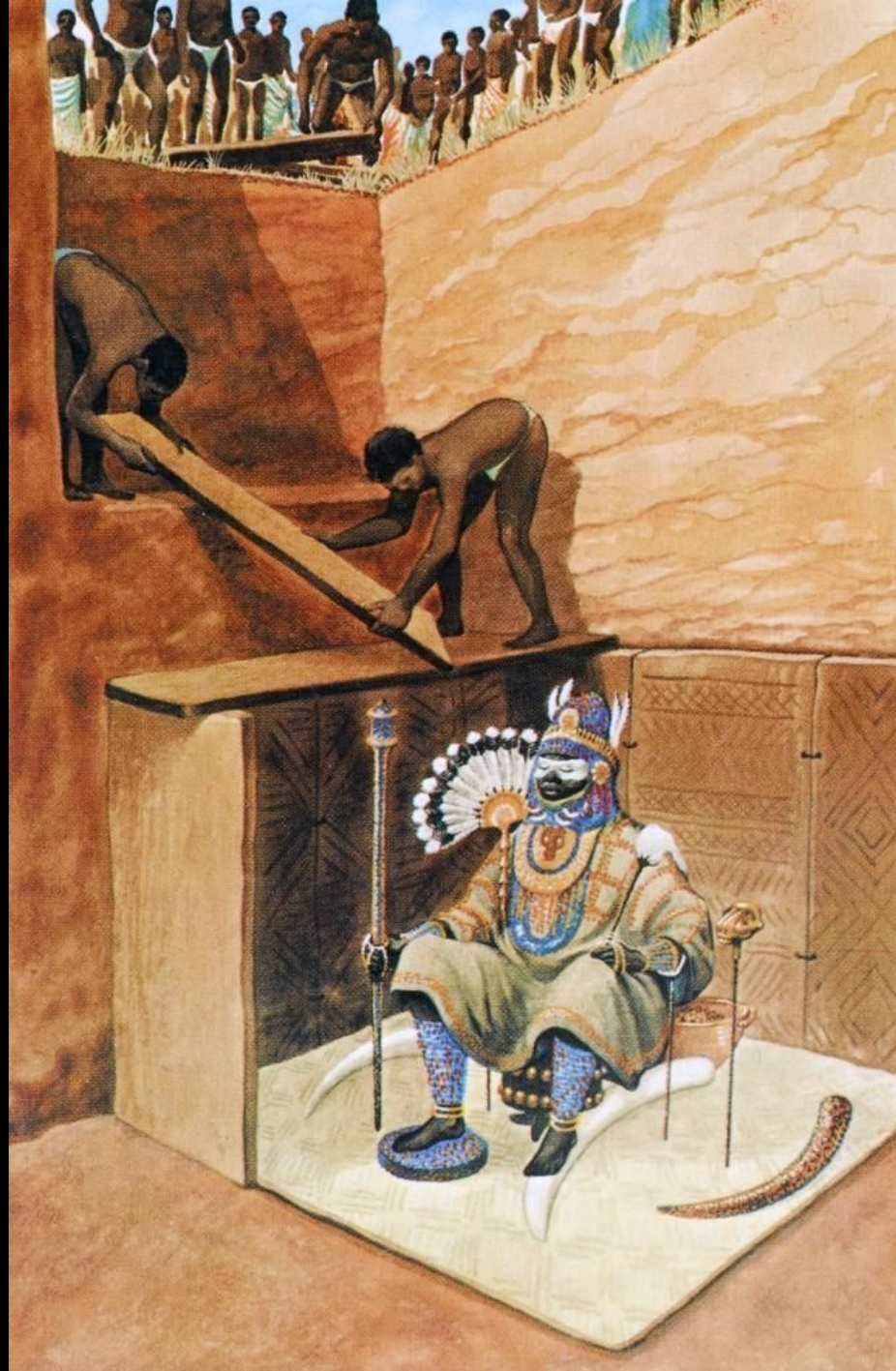
Reconstruction of the grave found at the Igbo Richard sub- site, Igbo-Ukwu, Nigeria