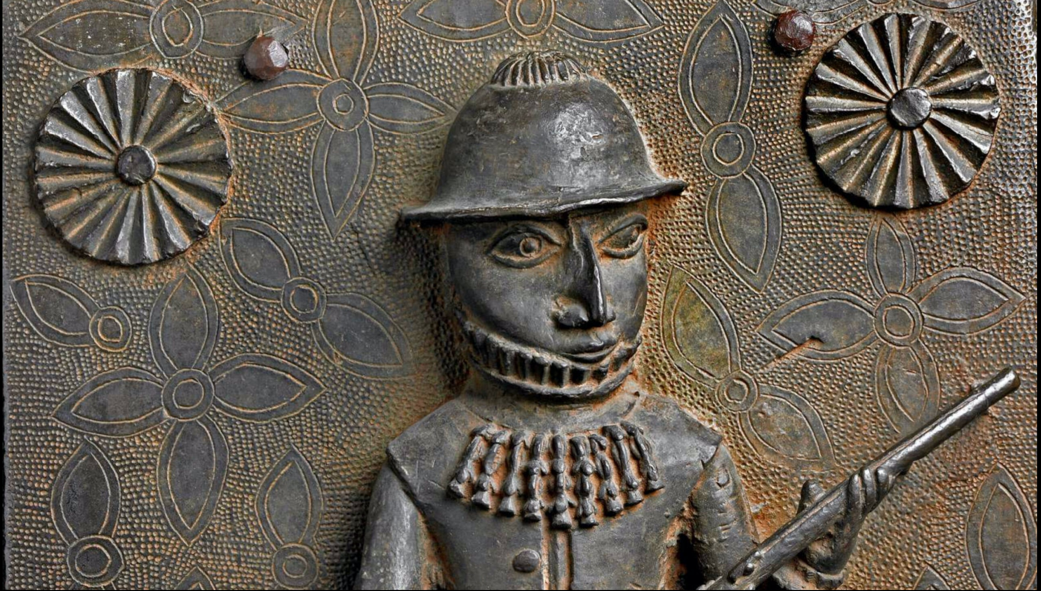
relief plaque (Portuguese soldier, detail), c. 16th–17th century, copper alloy, from Benin City, Edo