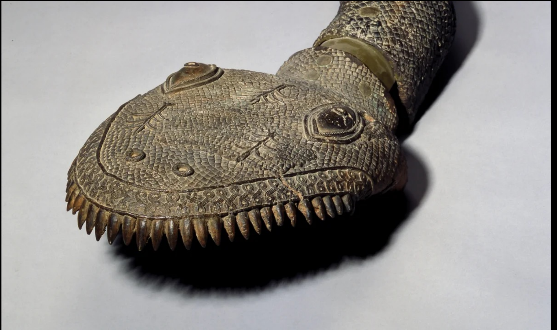
The Hamburg ethnological museum's collection of Benin bronzes includes this snake sculpture (17th-18th century).