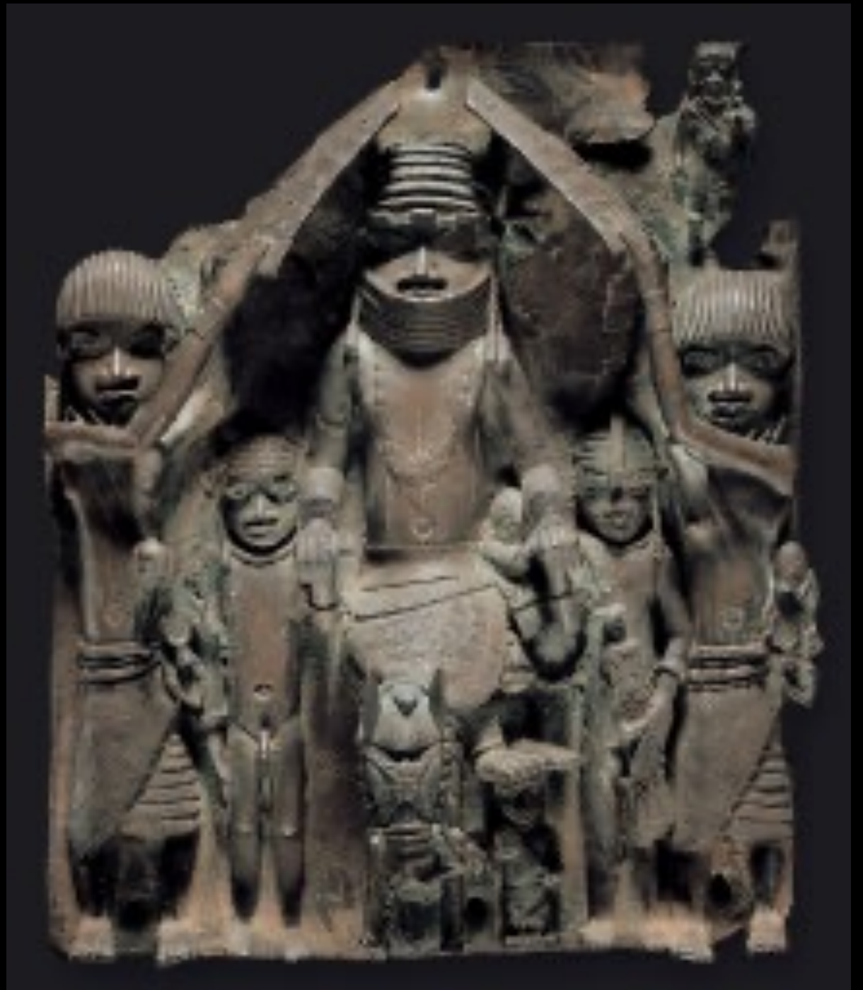
Plaque of Oba Esigie on Horseback with Attendants, 16th/17th century