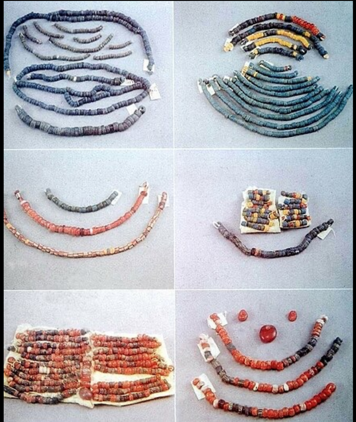
9th century Glass beads from Igbo-Ukwu