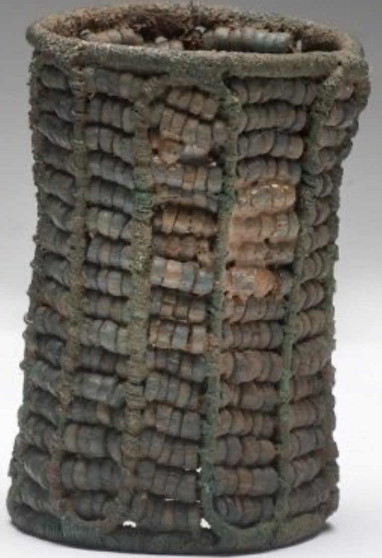
Armlets, 9th/10th century, excavated at Igbo Richard, Igbo Ukwu, eastern Nigeria. Beads and copper wire, height 14.9 cm.