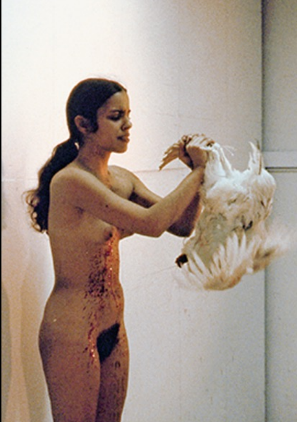
Ana Mendieta Death of a Chicken 1972