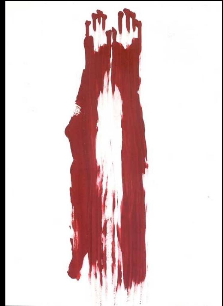
Ana Mendieta Body Tracks 1982 Blood and tempera on paper