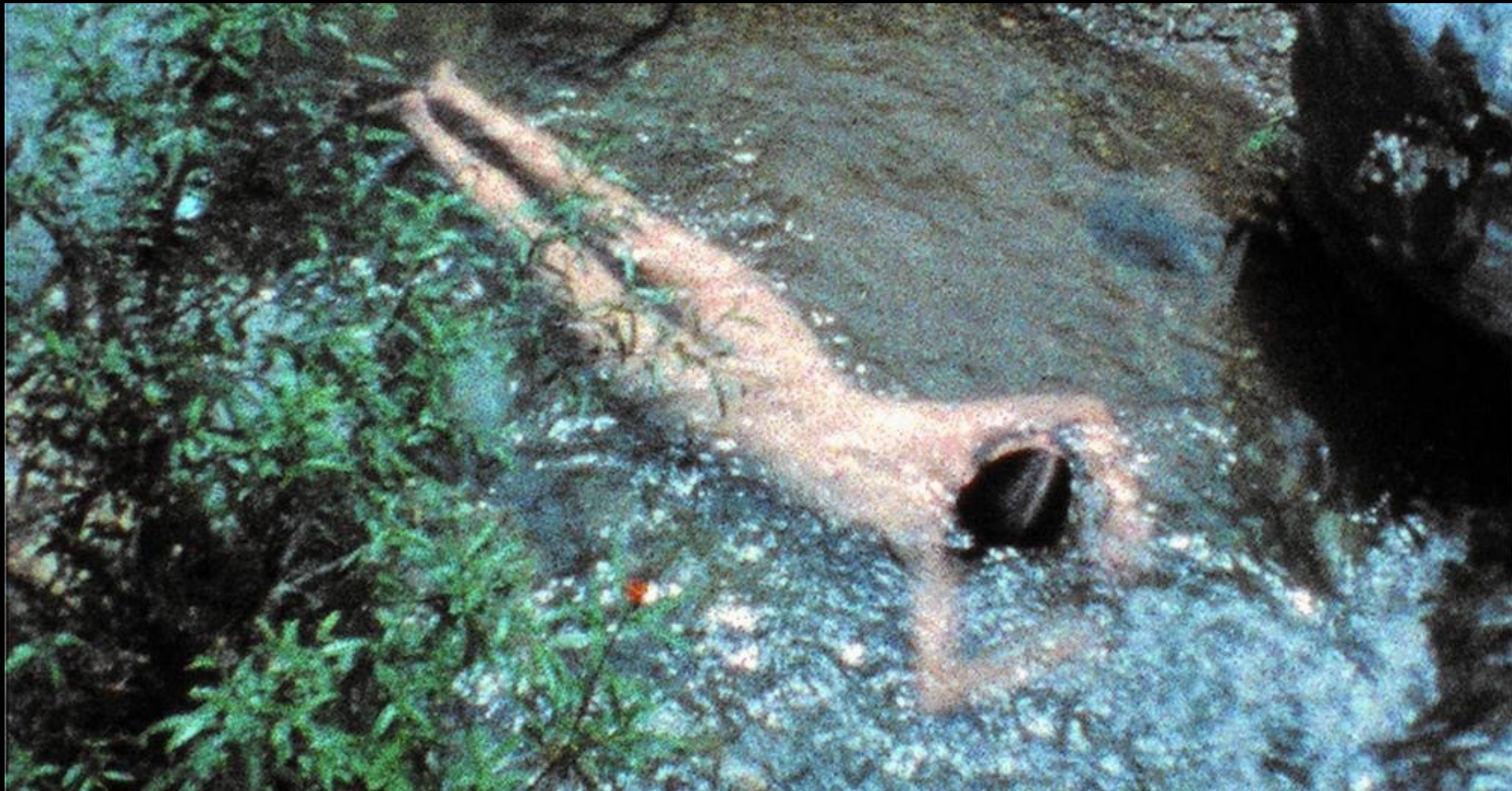
Ana Mendieta Untitled 1973