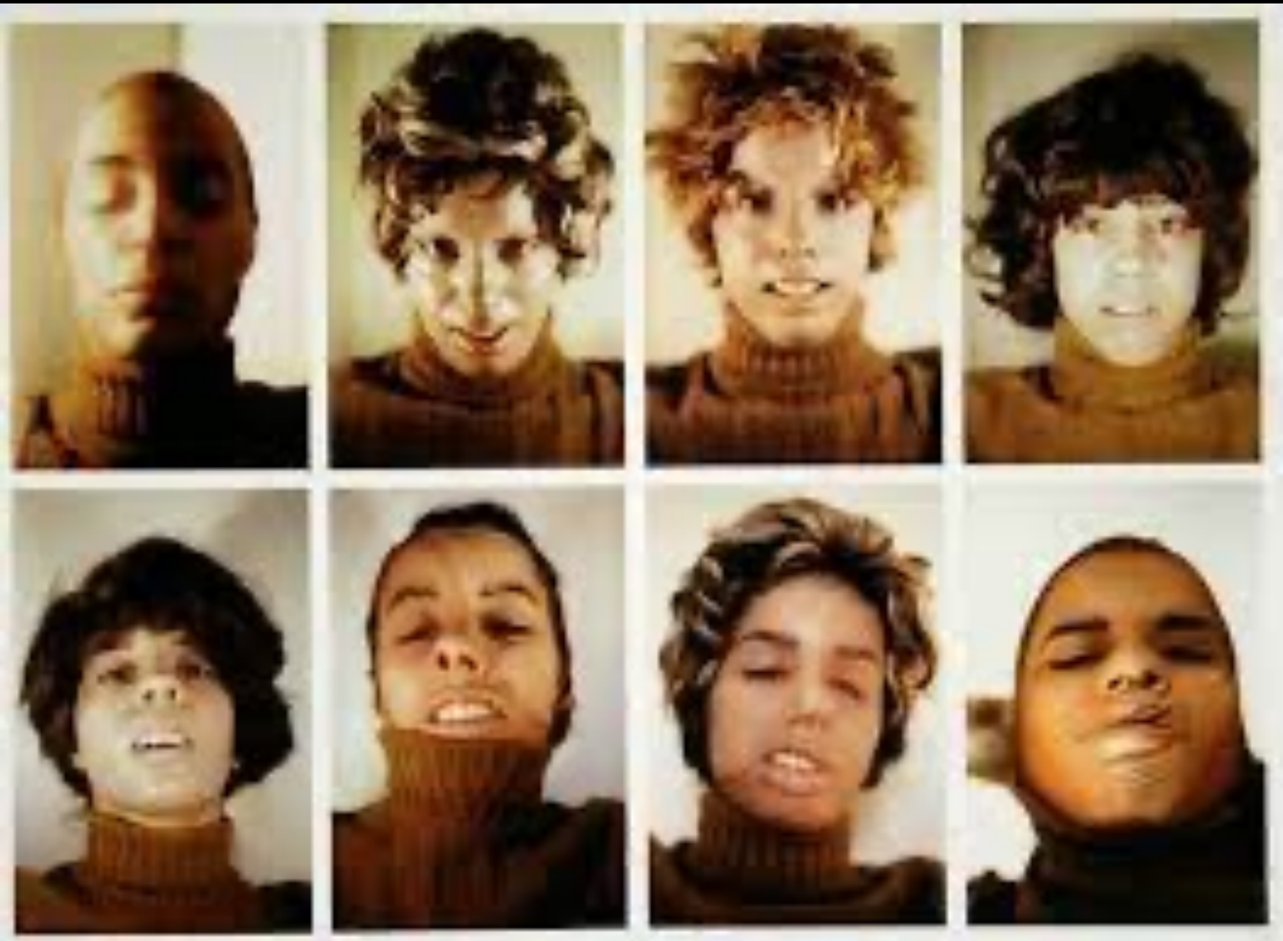
Ana Mendieta Cosmic Variations 1972