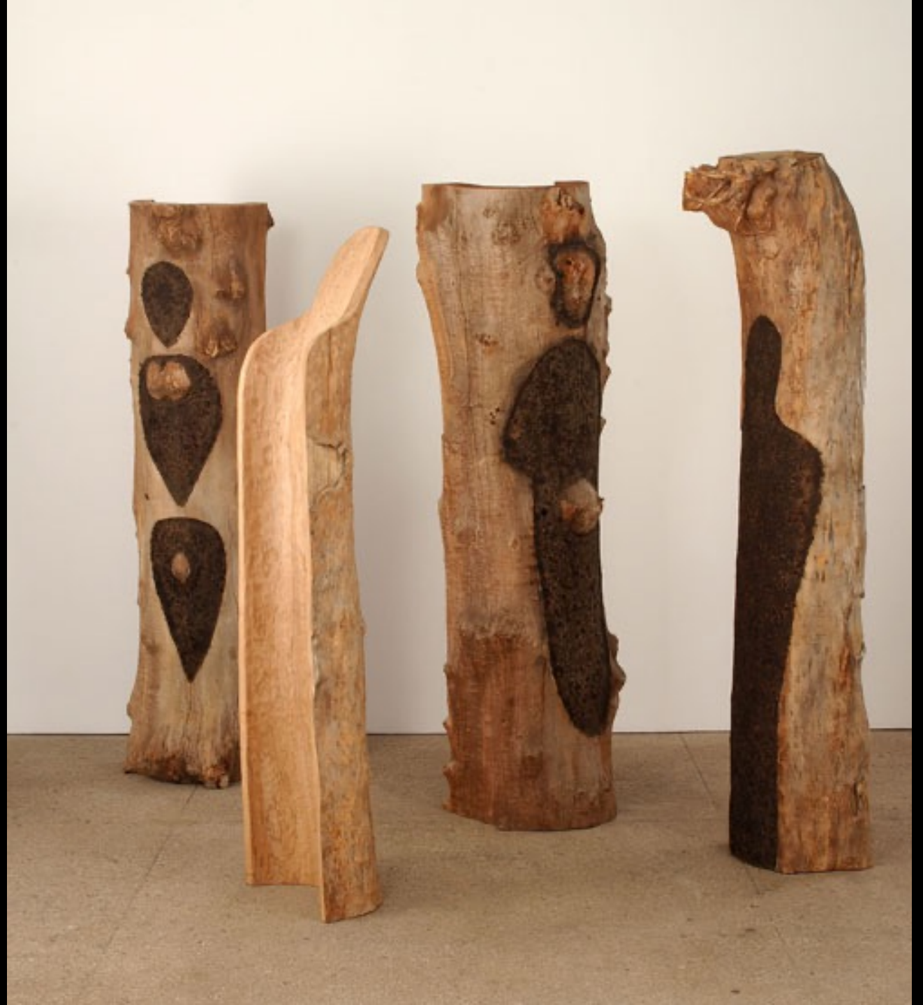
Ana Mendieta Untitled. 1985. Made with Wood and Gunpowder.