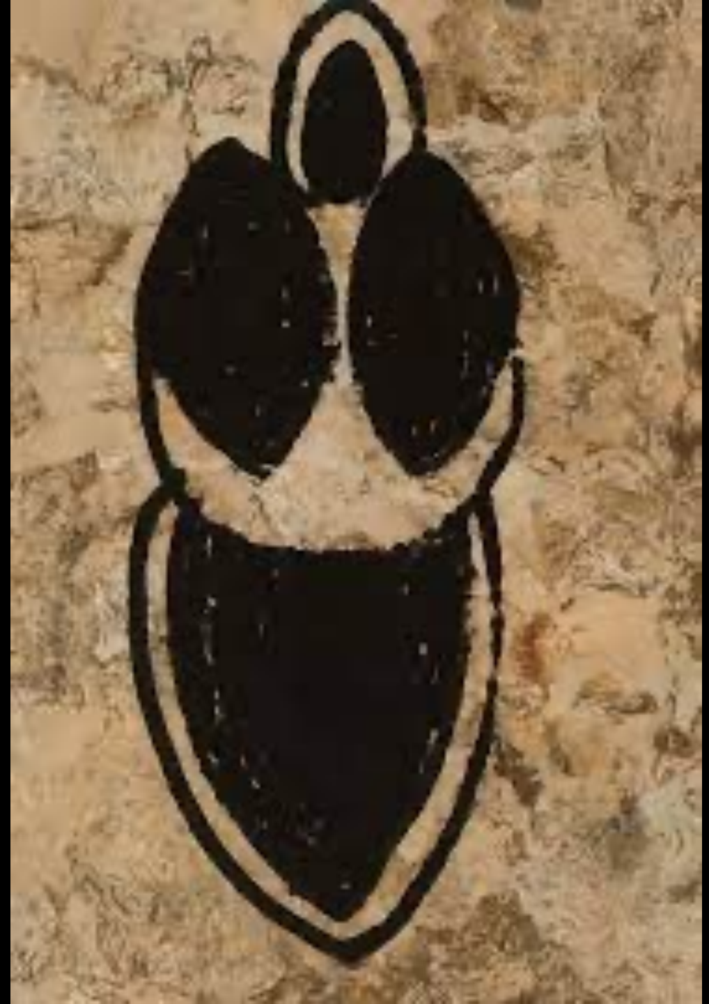
Ana Mendieta Amategram 1983