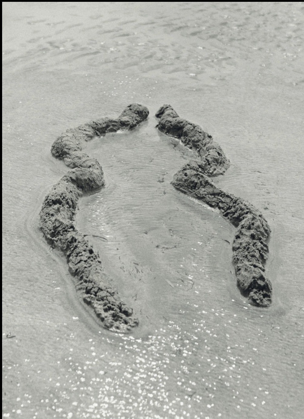
Ana Mendieta Ochún , 1981