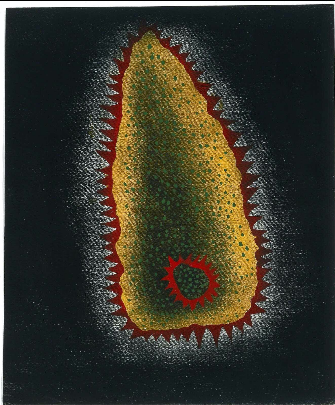
Yayoi Kusama The Woman 1953