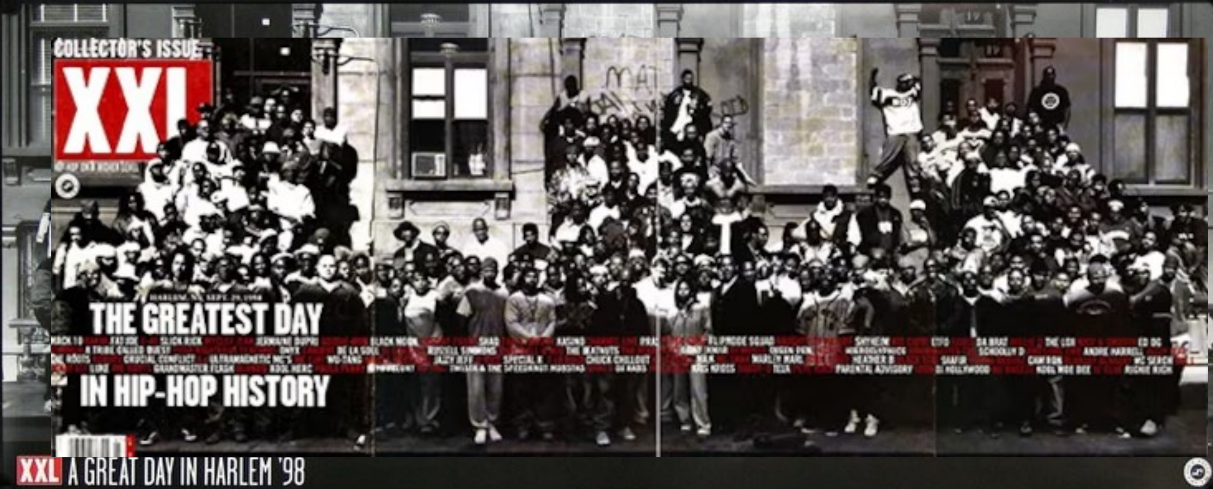
Published on the cover of issue #7 of XXL magazine, Gordon Parks's homage to Art Kane's 1958 photograph of 57 jazz musicians spilling off the same Harlem brownstone stoop for Esquire magazine. 177 hip hop artists, producers and influencers.