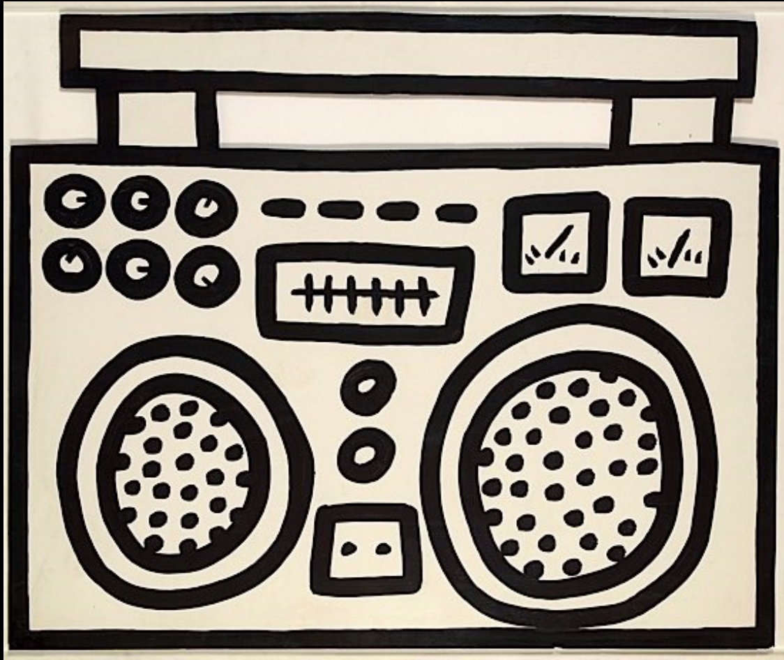
Keith Haring Boom Box