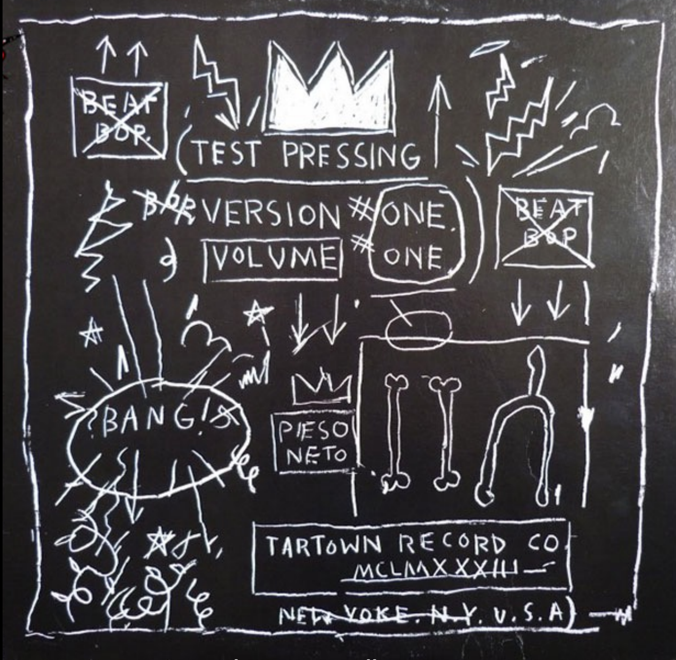
K-Rob Vs. Rammellzee Basquiat Cover 1983