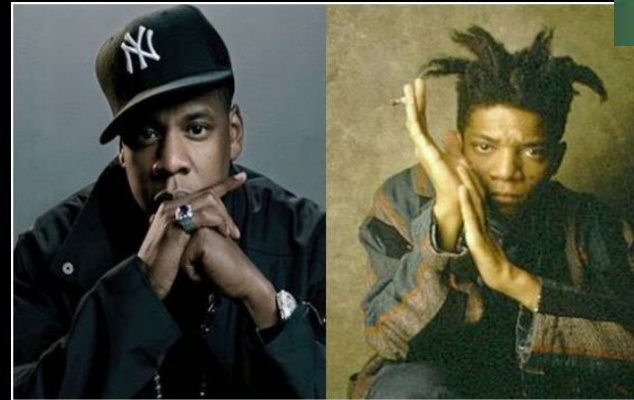
Jay Z & Jean-Michel Basquiat as poets