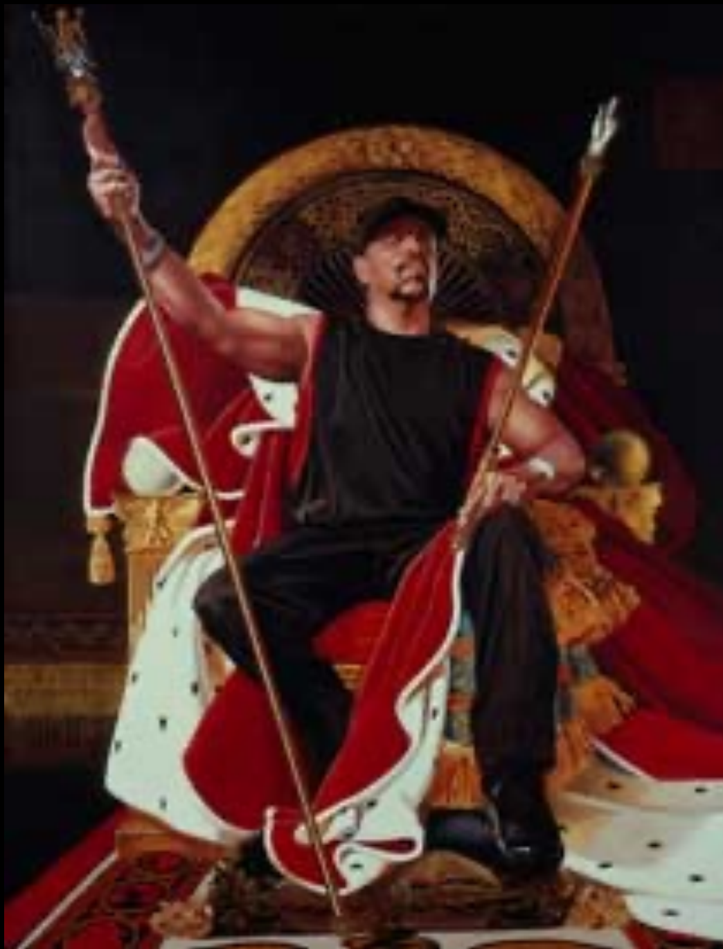
Ice T Kehinde Wiley, 2005 Oil on canvas