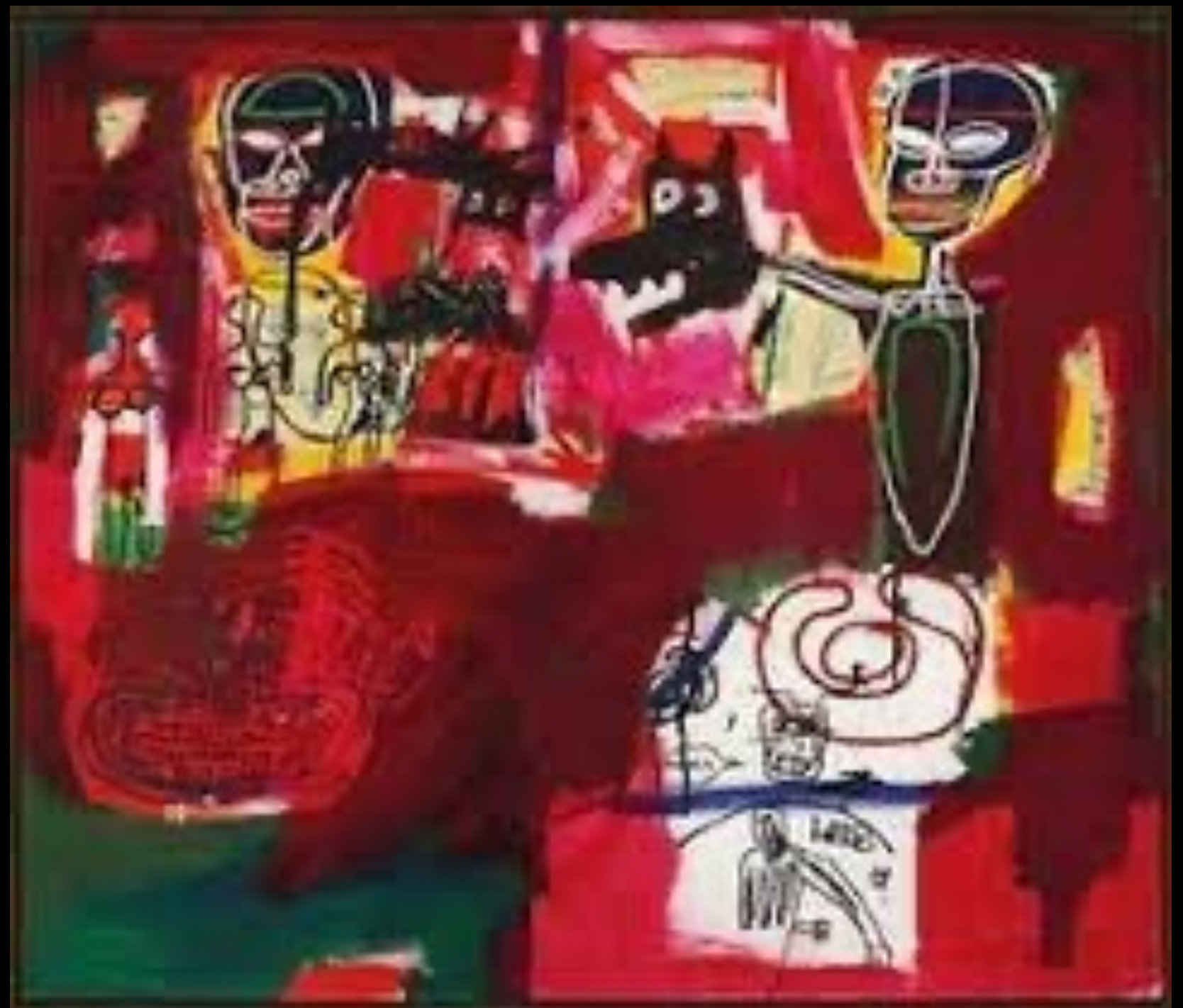
Jean-Michel Basquiat (1960-1988). Sabado por la Noche ( Saturday Night )