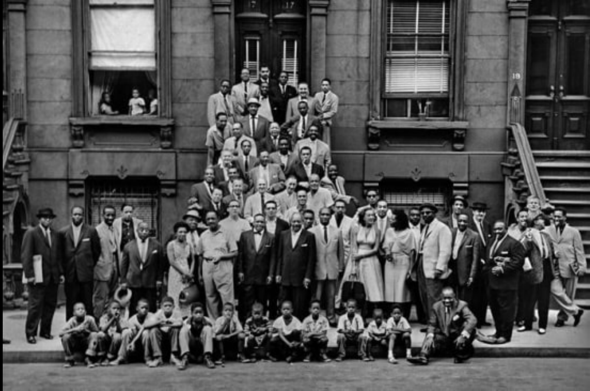
Art Kane, A Great Day in Harlem, 1958.