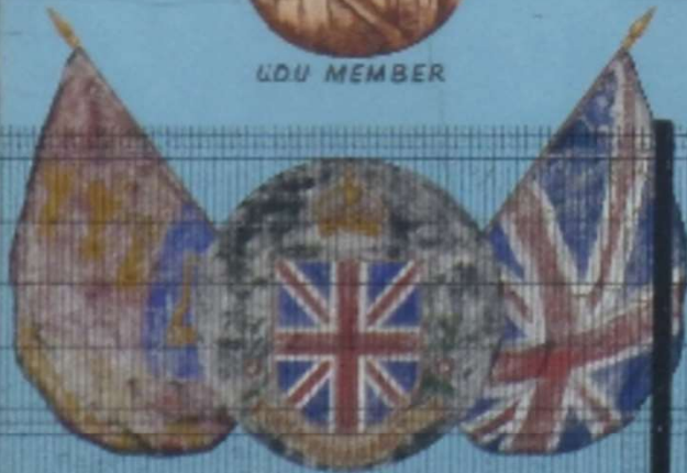
UDU DEFENCE UNION FORMED 1893.