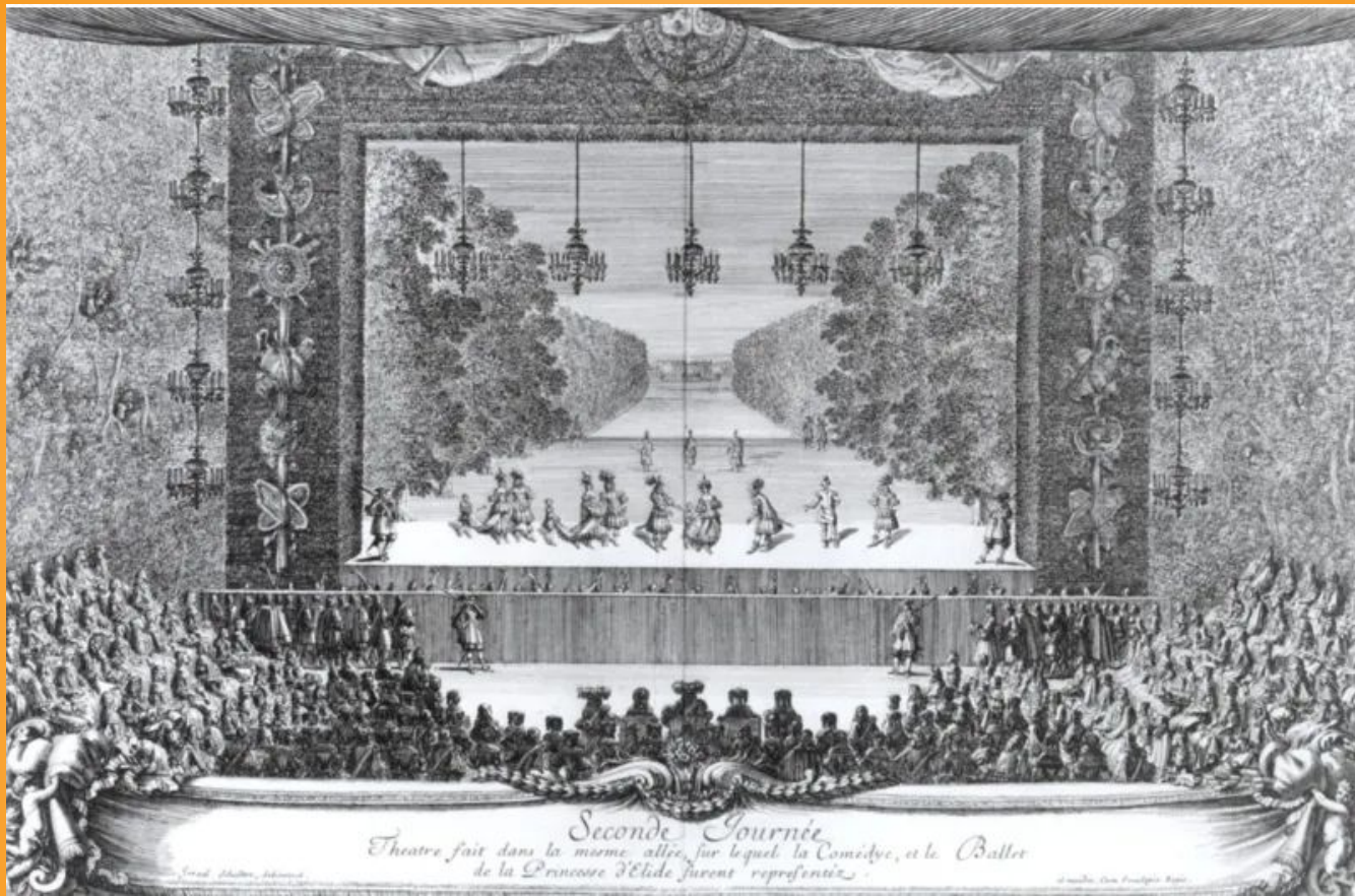
Engraving of the ballet La Princess d'Elide, Palace of Versailles, Paris, published in 'Les Plaisirs de L'Isle', 1673-4