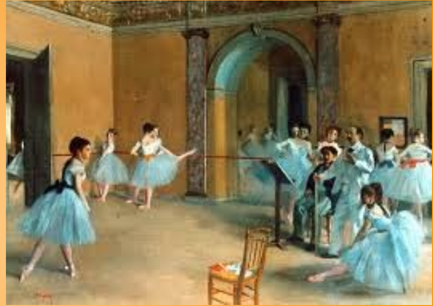
Degas's painting is set in a rehearsal room in the old Paris Opéra.